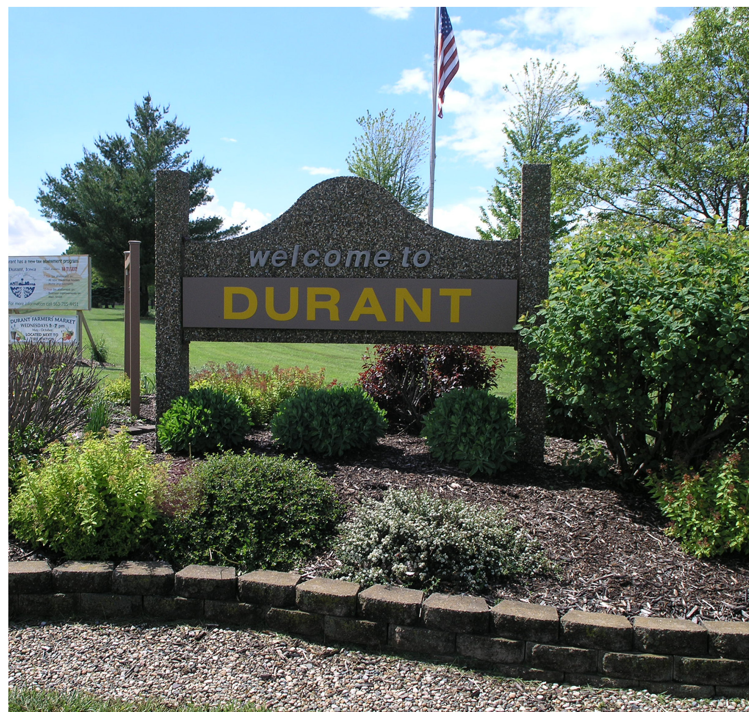
Existing east entrance sign located at Feldhan Park entrance