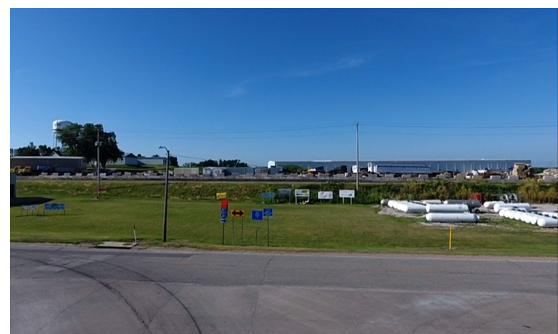
Existing conditions at the end of 1st Street