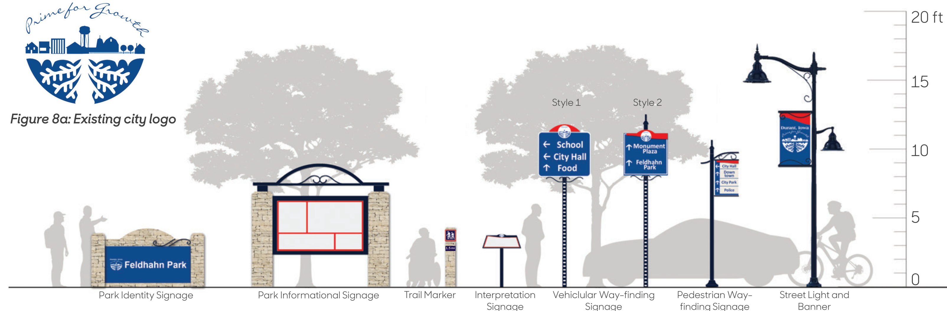
Figure 8b: Proposed concepts for community way-finding signage family