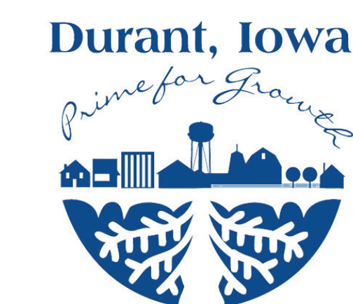
Figure 8a: Existing city logo