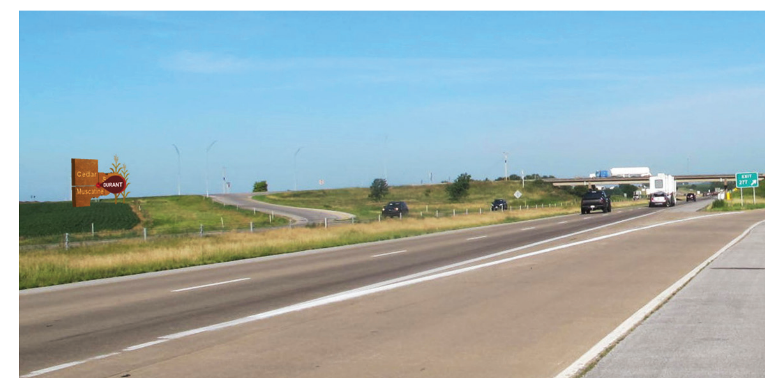
Concept C: Tri-county reflects Durant's location, combined with the corn's symbolism as discussed in Concept A