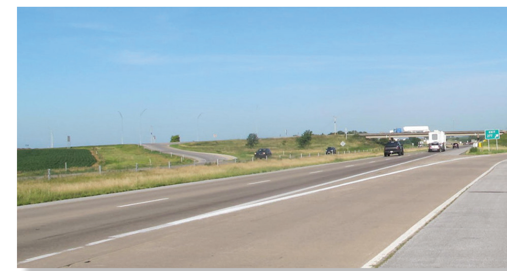
Existing I-80 westbound Exit 277 to Durant (looking west)