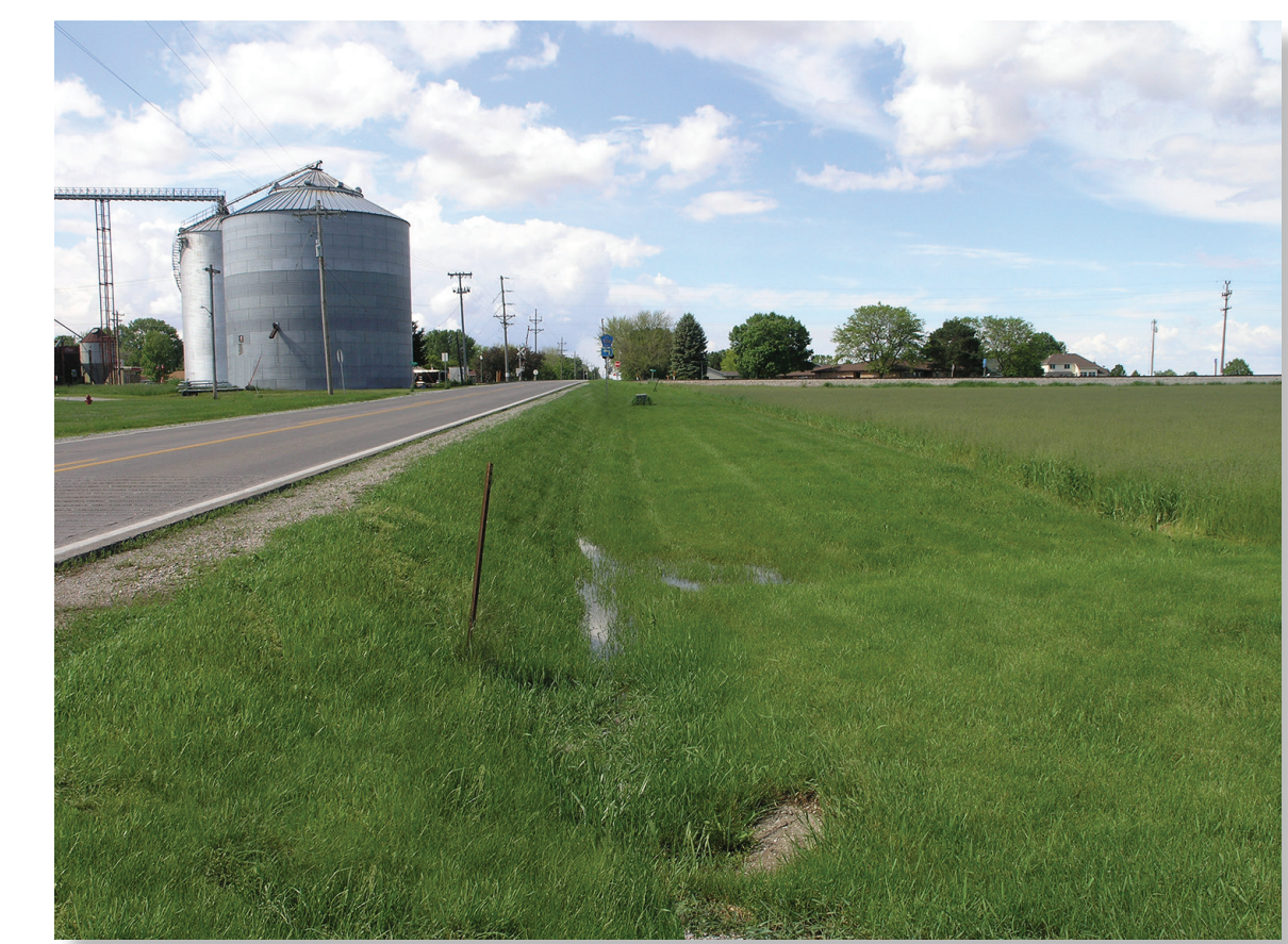
Existing: East side of 14th Ave. just to the north of the cemetery entrance looking north.

A raised crosswalk is integrated into this design in order to calm traffic and increase pedestrian safety. Raised crosswalks are designed to accommodate the intended traffic, including emergency vehicles and semis.