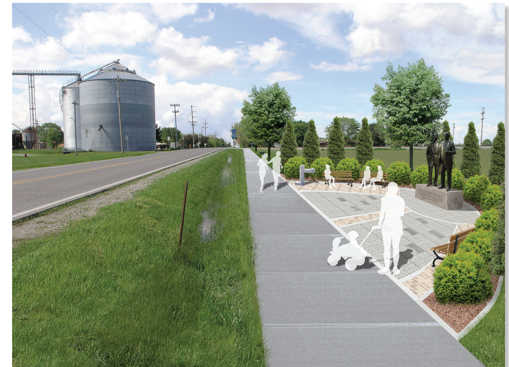
Proposed concept: "Founders Plaza" includes monuments of city founders, seating, and decorative pavement.