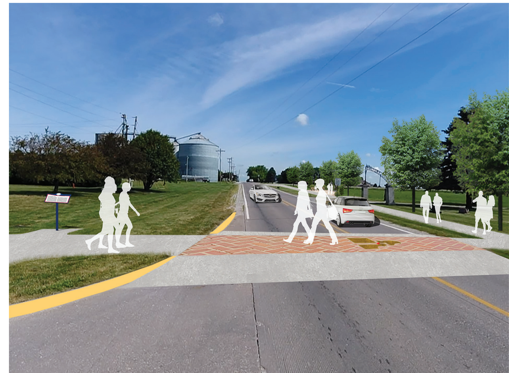
Proposed Concept: A raised crosswalk calms traffic and a bronze monument mark the Tri-County point.