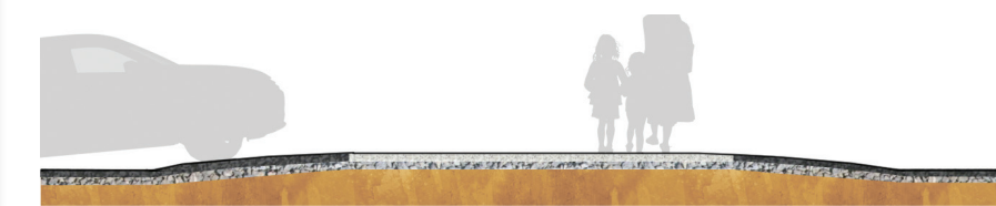
Typical section of raised crosswalk.