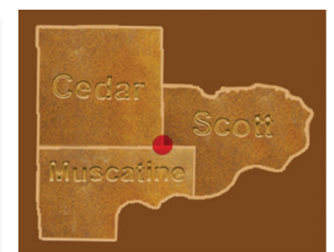
Tri-County marker enlargement.