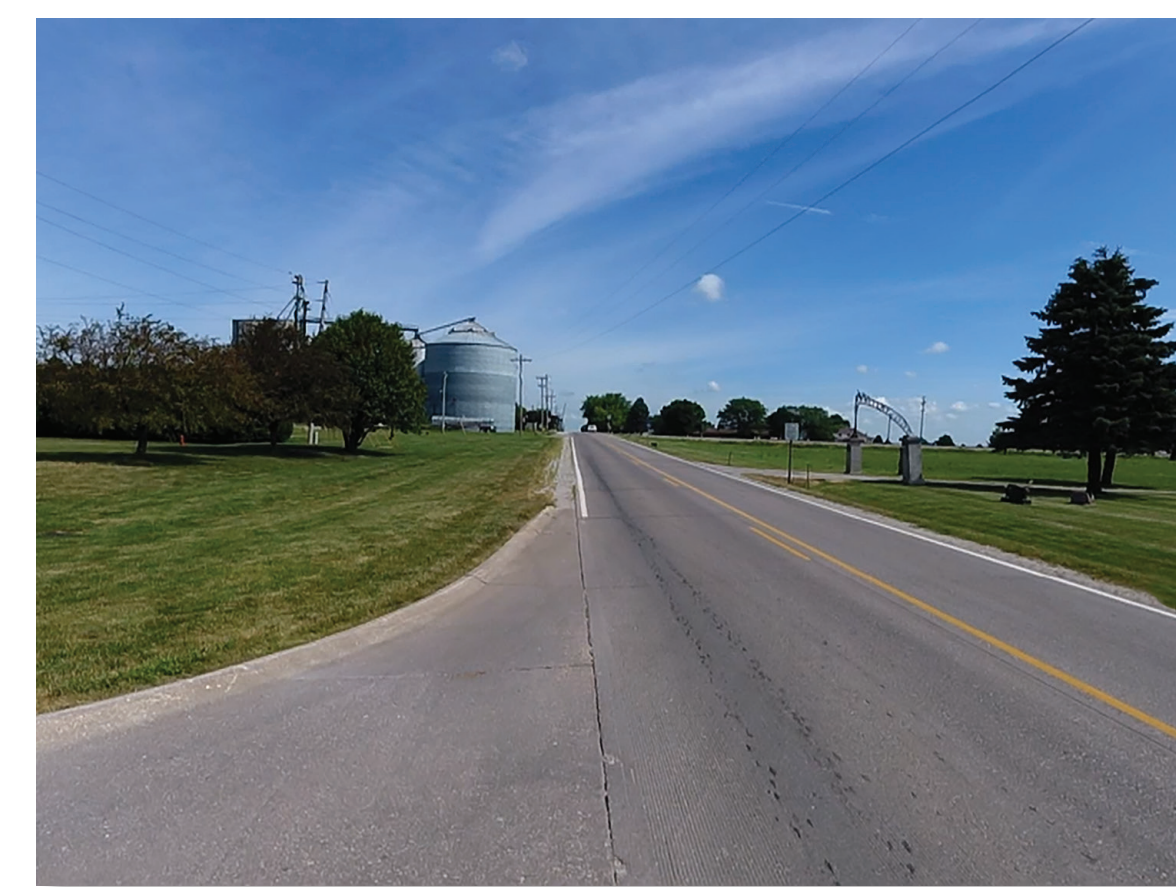
North side of 3rd St. & 14th Ave. intersection looking north.

Only one pedestrian crossing is proposed for 5th St. due to safety concerns of having two at this intersection. The pedestrian traffic paralleling 5th St. will cross 14th Ave. to get to the 5th St. crossing. Fourteenth Ave. has less traffic and the traffic has to stop at the intersection. A new pedestrian railroad crossing (width of trail) will be required. All signage and pavement markings will need to follow MUTCD requirements.