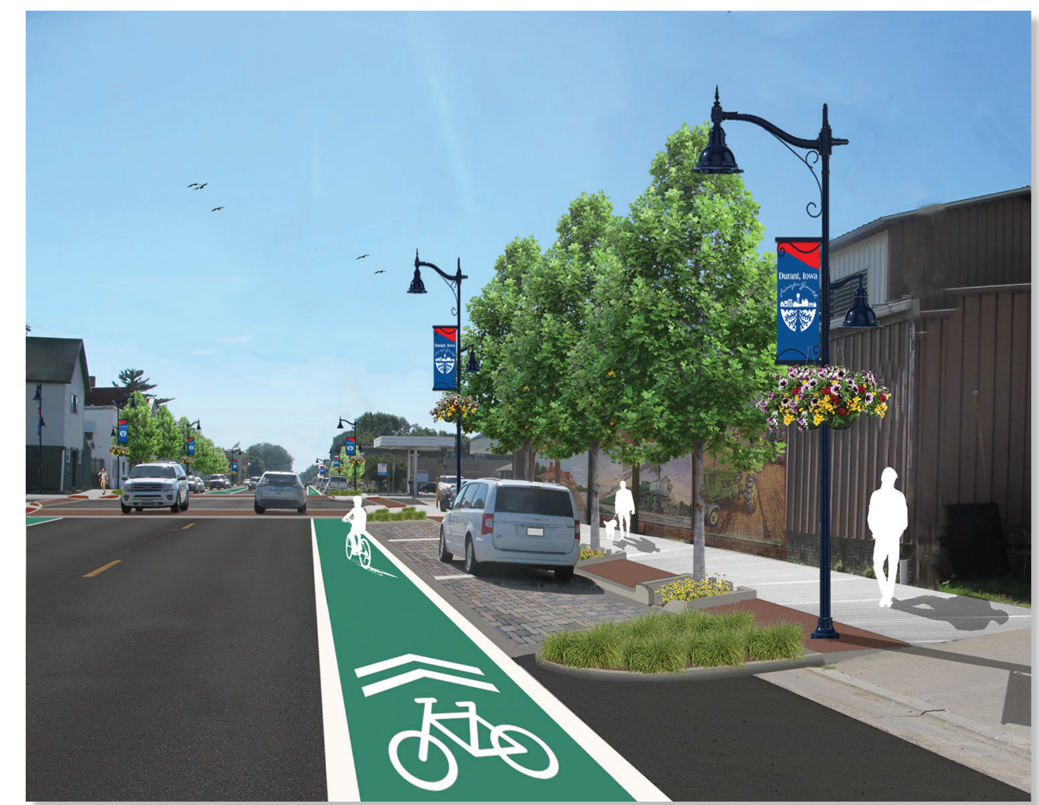
A Proposed concept: This edit illustrates the typical downtown enhancements that are proposed, including a mural on Jeff's Market