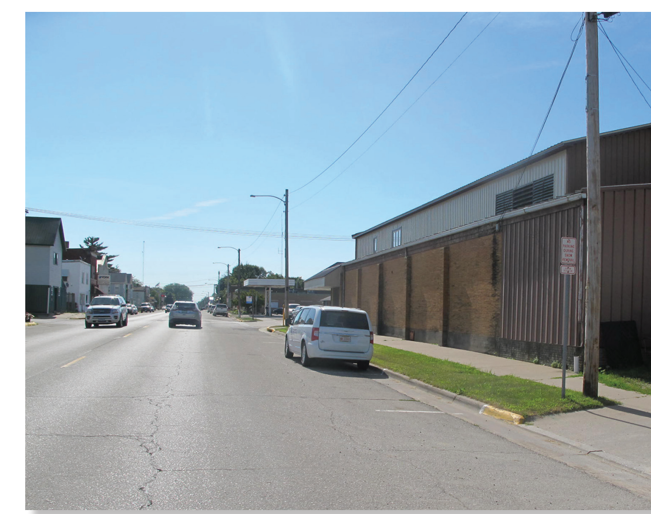
Existing photo taken from 5th St., west of 6th Ave. looking southeast