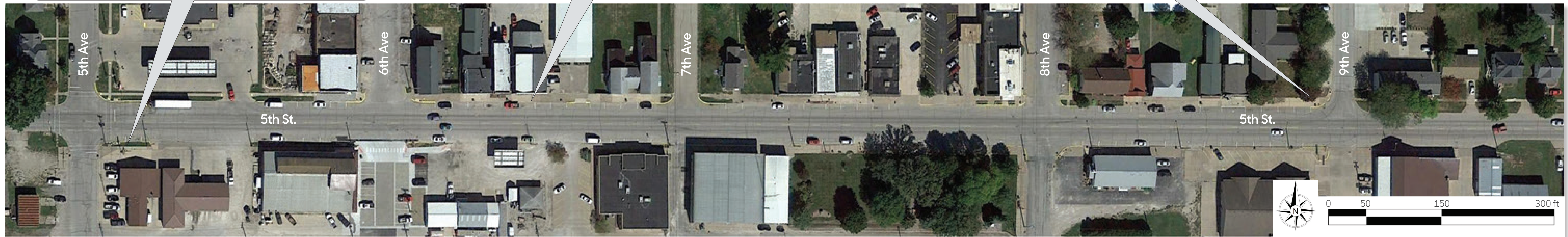
Existing aerial (plan view) of the Downtown District.

"...even on Main Street, the sidewalks are just uneven; it's hard to push a stroller or have your kids ride a bike on it..."