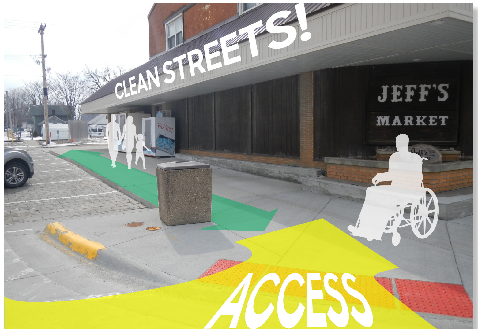
Accessible corners, parking and cleanliness is appreciated downtown.