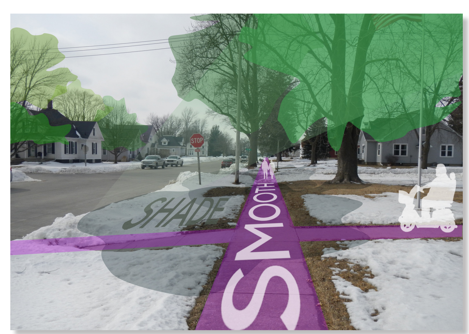
Smooth shaded sidewalks are appreciated by kids and people who walk for exercise, as well as the mobility impaired.