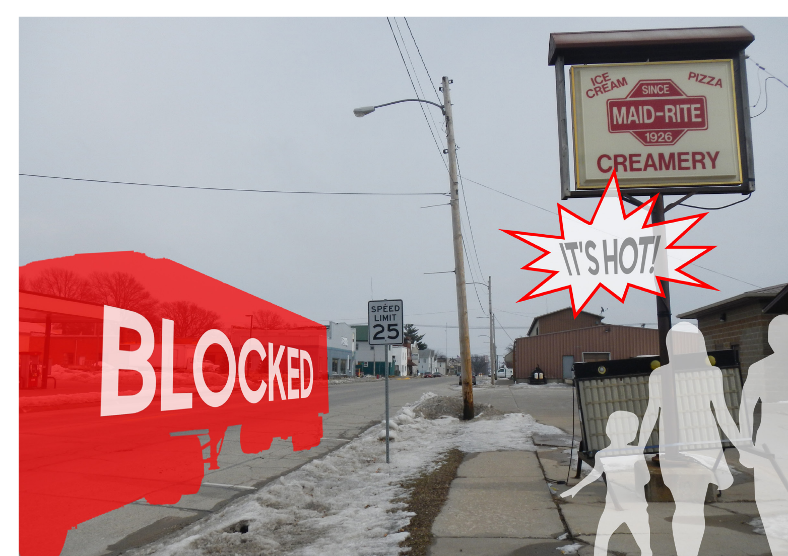
Truck traffic sometimes blocks views of oncoming traffic on 5th Street.