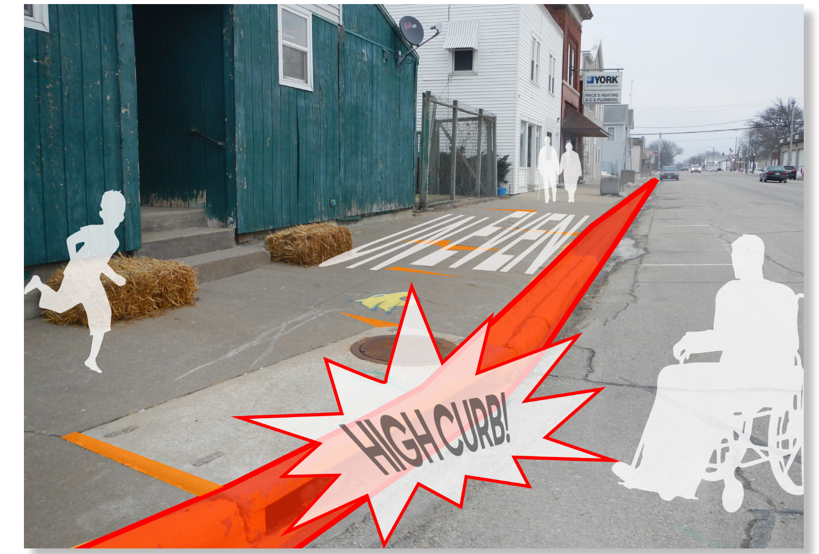
The sidewalks on Main Street are uneven and are difficult to access from the street because of the two-step curb, especially with snow in the winter.