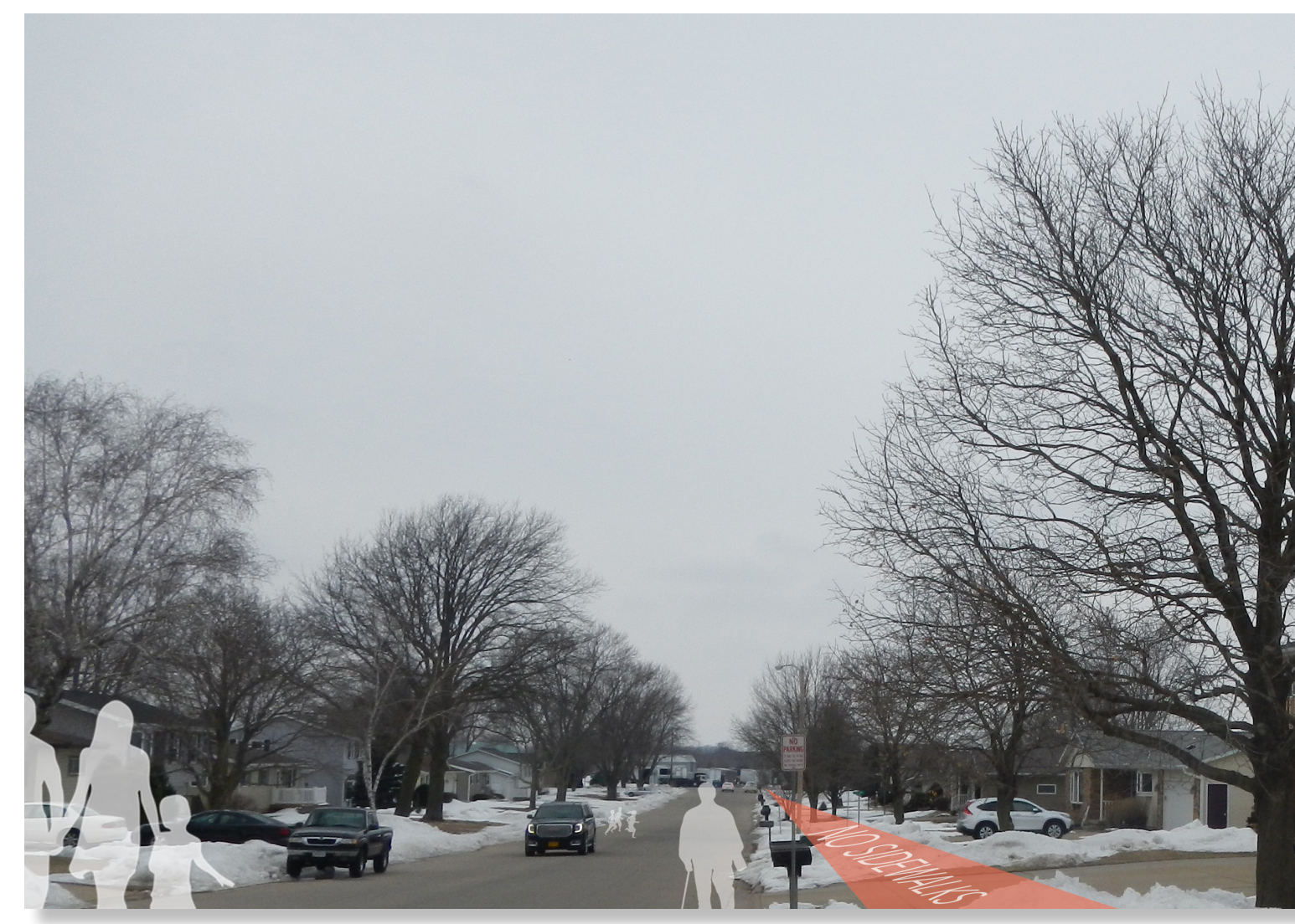
Seventh Street has no sidewalks, and is an important connector for pedestrians, cyclists, and drivers.