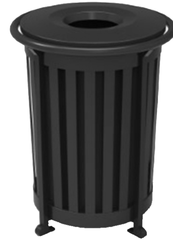
Scarborough Litter Bin, Landscape Forms