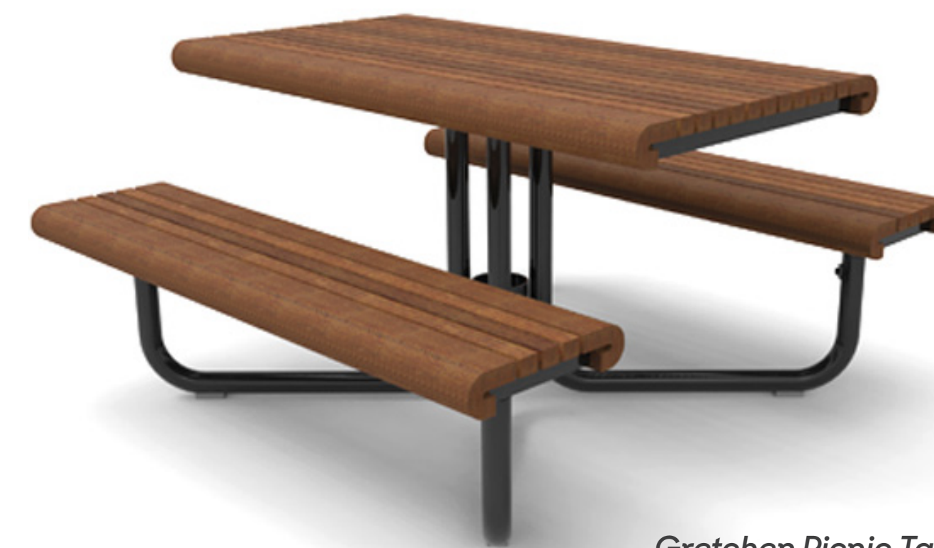
Gretchen Picnic Table, Landscape Forms