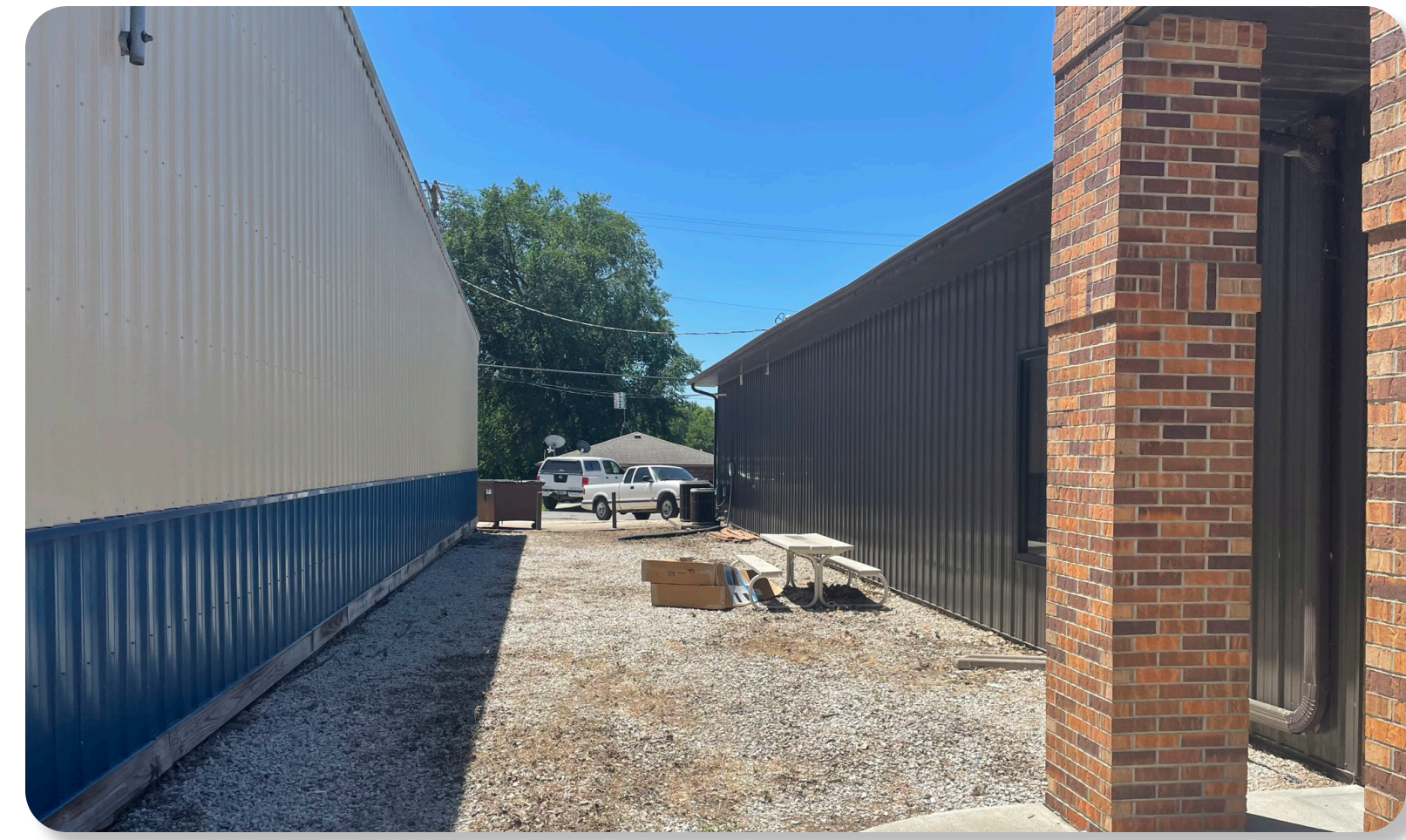
Existing alleyway conditions

This alley is currently filled with gravel and does not have frequent use; this project proposes a parklet with brick pavers, plantings, and seating. Users can sit at the picnic benches and bistro tables to enjoy a quieter, off-street social setting, or pass through the park to access additional parking. String lights overhead encourage evening use and add to the intimate quality of the space.