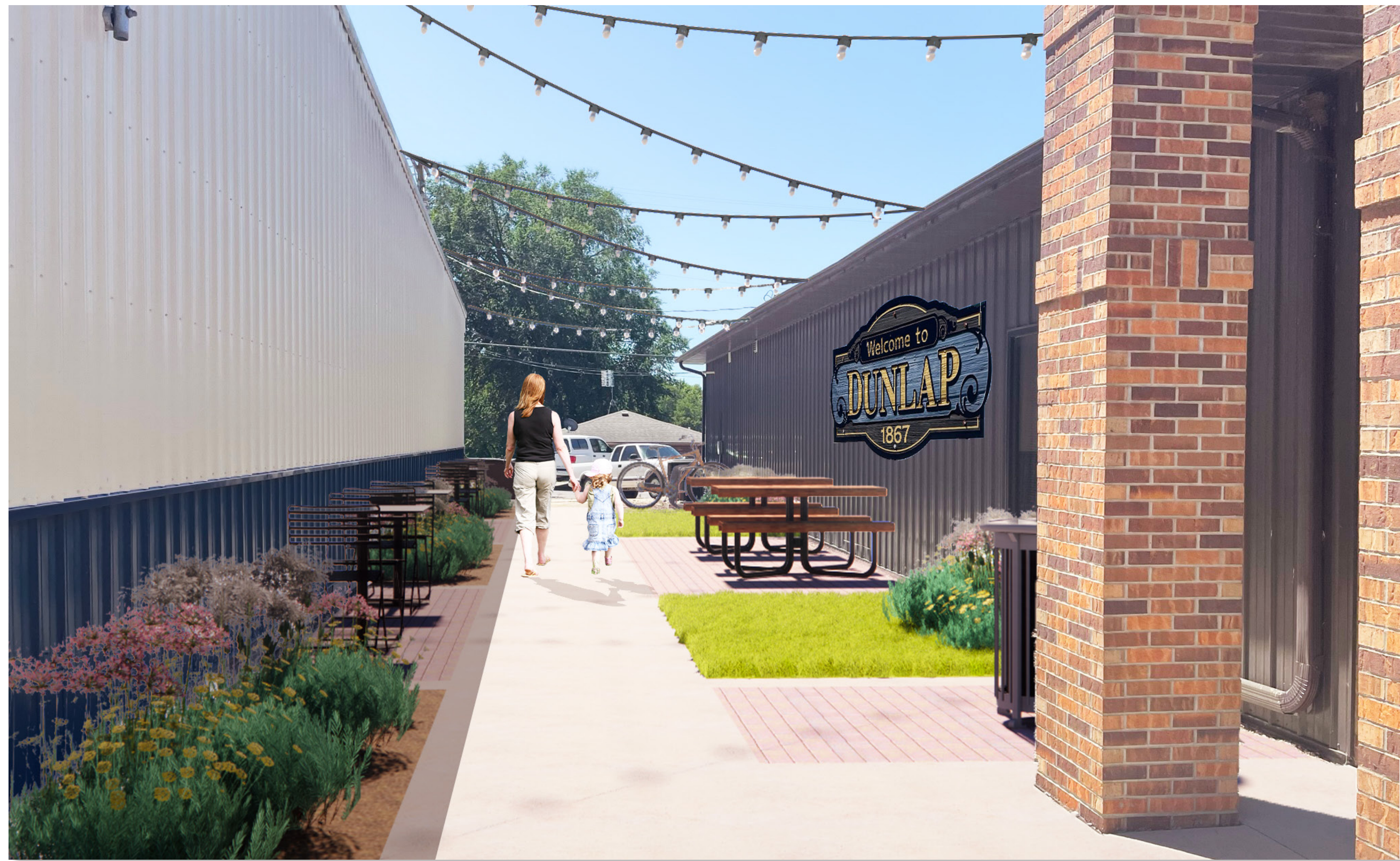
Rendered view of alley restoration, to include pavers, bistro seating, picnic tables, and lighting, and the relocated existing entry sign located at "1"