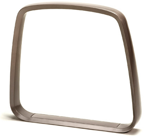
Ride Bike Rack, Landscape Forms

In a previous streetscape project, the city selected a traditional acorn-style streetlight for the west end of Iowa Avenue; the proposed design intends to extend this lighting through the remainder of Iowa Avenue. The design team selected the Scarborough bench and litter bin in a classic black finish to complement the lighting and signage fixtures.