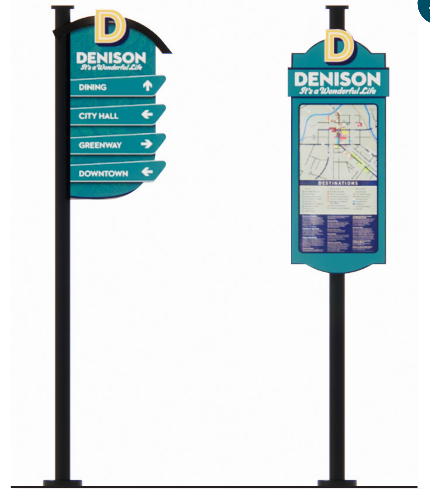
Sign graphic provided by the City of Denison.