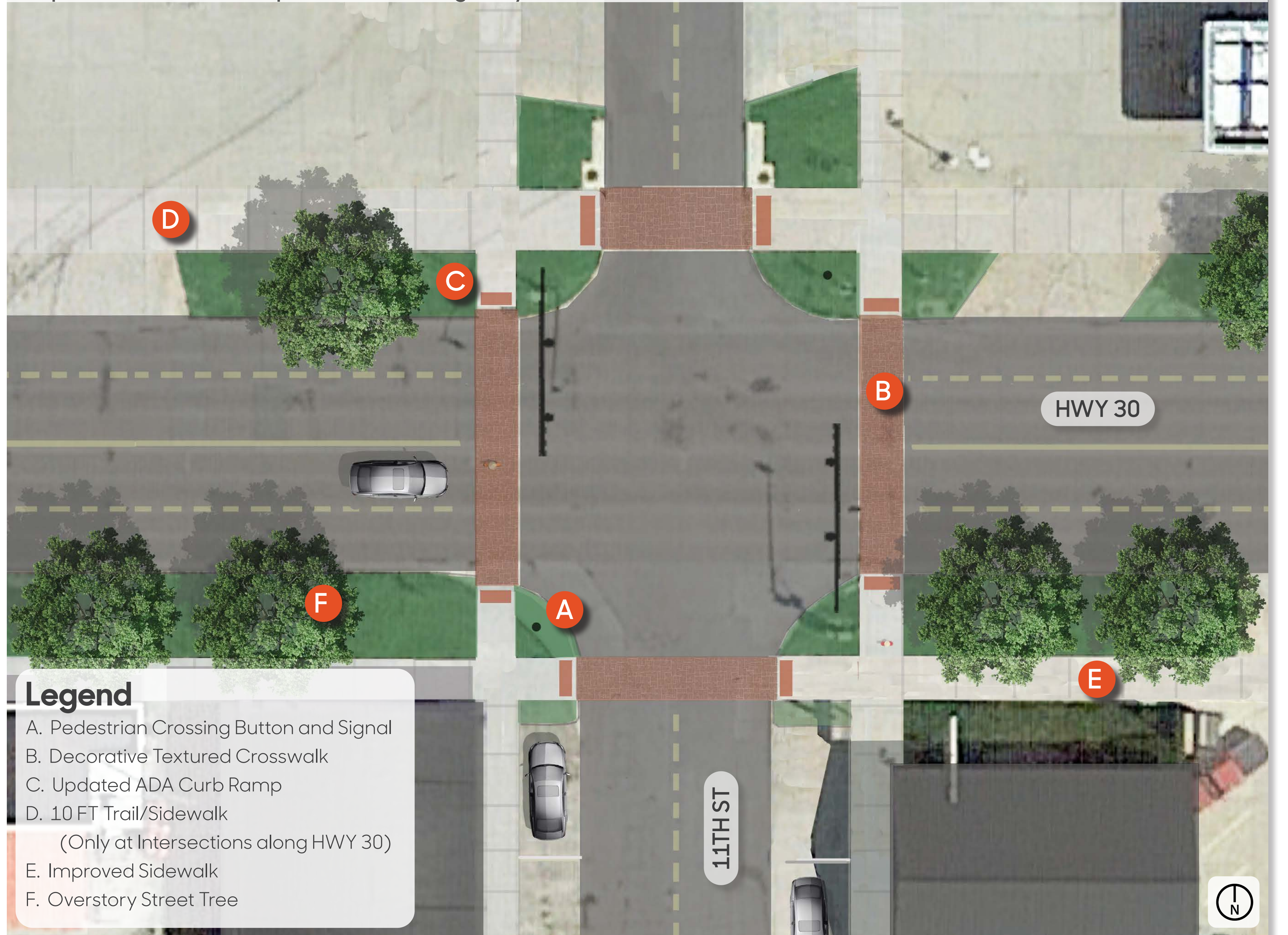
Proposed Intersection Improvements at Highway 30 and S 11th Street

improvements be implemented when the City of Denison needs to repair intersections. As necessary, replace surrounding sidewalk to eliminate any uneven, cracked, or spalling concrete panels. This will reduce any potential for tripping hazards as pedestrians approach the street. All sidewalks should be a minimum of 5' wide to allow for two-way pedestrian traffic. Where sidewalks meet the back of curb, ADA-accessible curb ramps with associated detectable warning plate should be installed. It is also recommended that signalized pedestrian crossing buttons be installed. To differentiate the pedestrian crosswalk from the vehicular street, the intersection template proposes installing a decorative textured crosswalk that is a minimum of 6' wide.