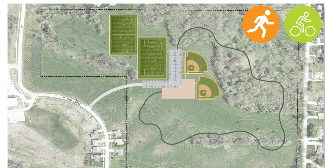
D - Northside Recreation Complex Expansion