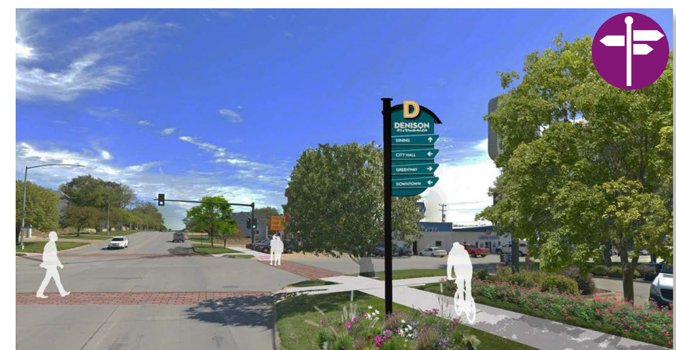
C - Community Way-finding