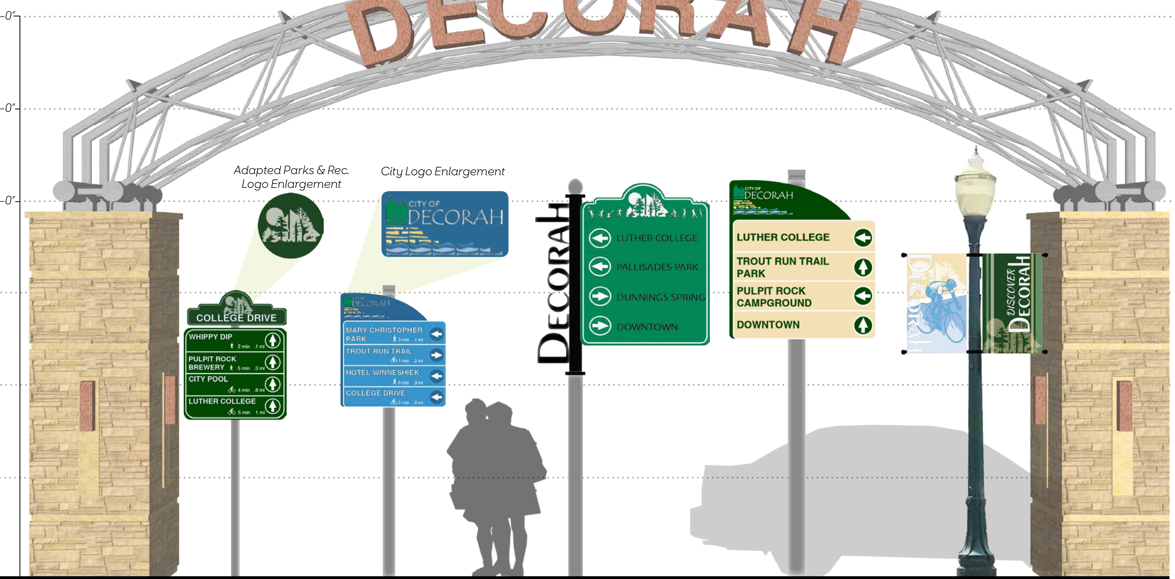
Gateway Sign Pedestrian Way-finding Sign Style 1 & 2 Vehicle Way-finding Sign Style 1 & 2 Existing Downtown Light Fixtures and Proposed Banner Styles