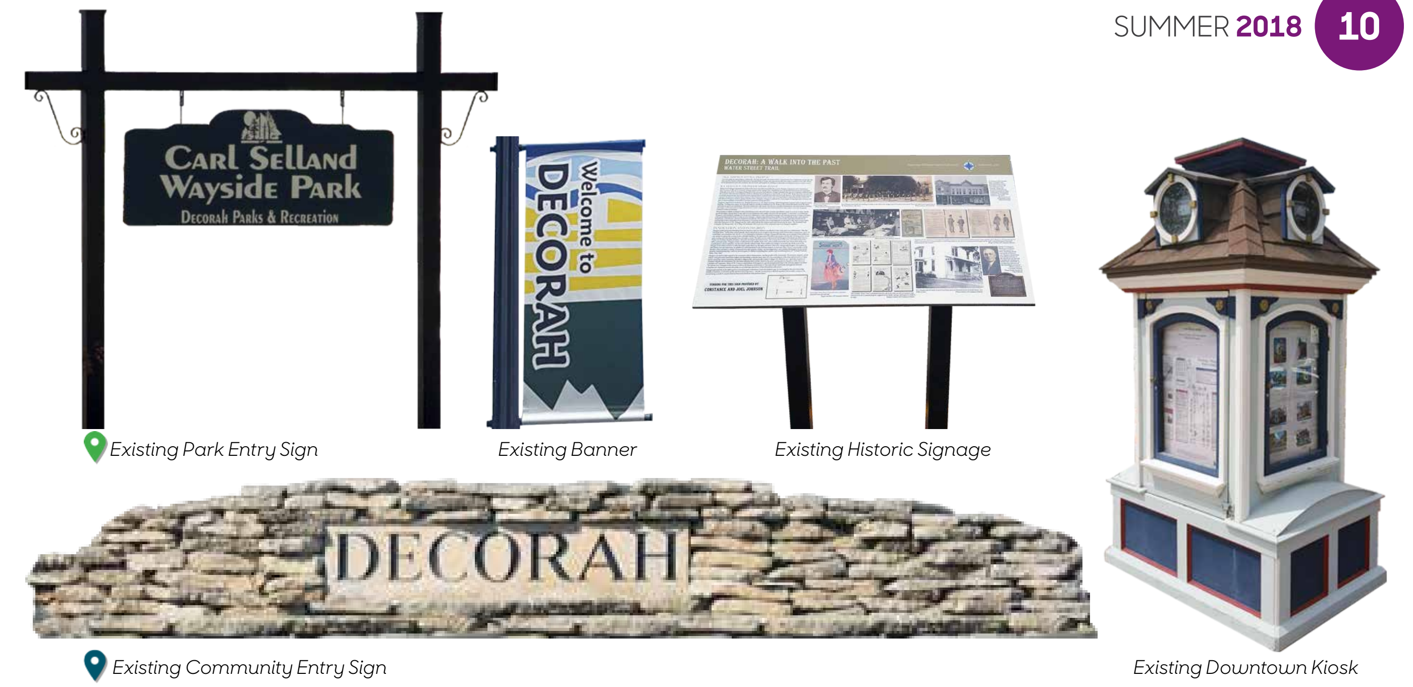
Existing Park Entry Sign Existing Banner Existing Historic Signage Existing Downtown Kiosk

A cohesive family of signage throughout Decorah enhances community and visitor access to recreation and business throughout town. Signage fabrication in conjunction with the high school welding program is an added educational outreach opportunity. Shown are several options for alternative branding inspired by existing Decorah signage and the various applications for their use.