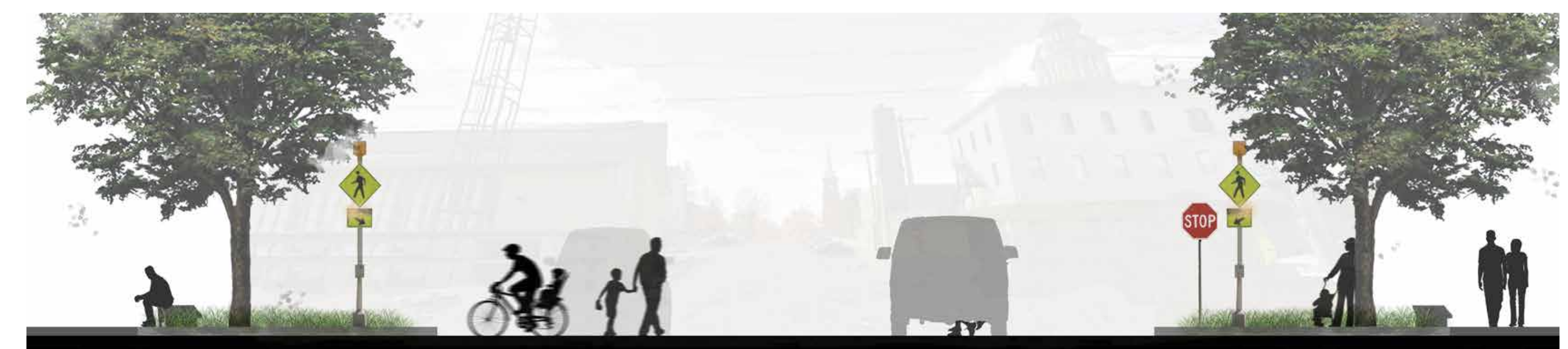
After: Section A - A' through Broadway Street, looking west.