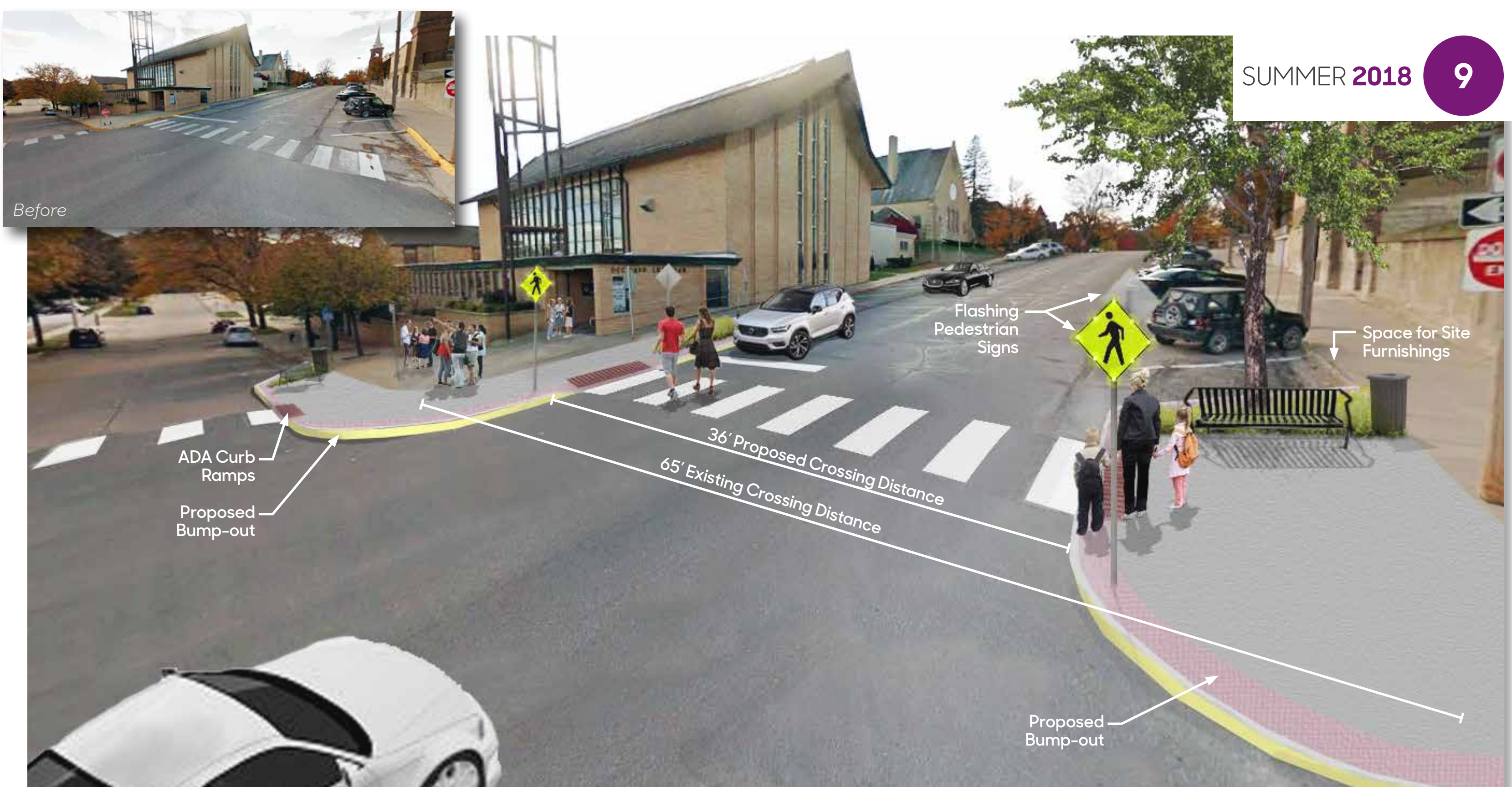
Perspective A looking southwest depicting bump-outs and safe crossing elements working together to increase pedestrian awareness at the intersection of Broadway and Winnebago Streets.