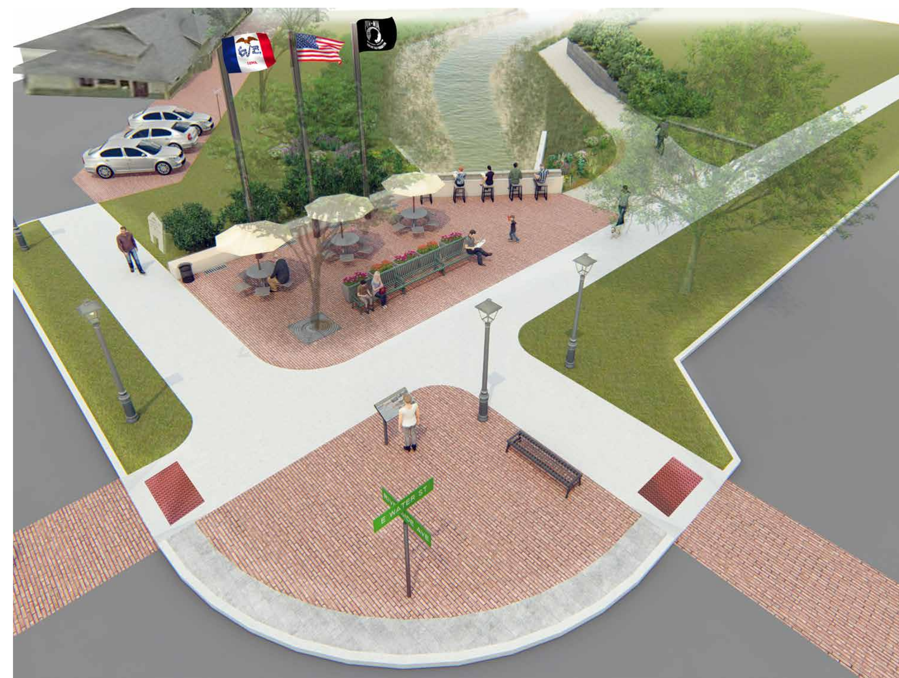
A: Perspective at Water Street and Riverside Avenue looking northeast showing a new plaza space and access to the East Water Street Trail.