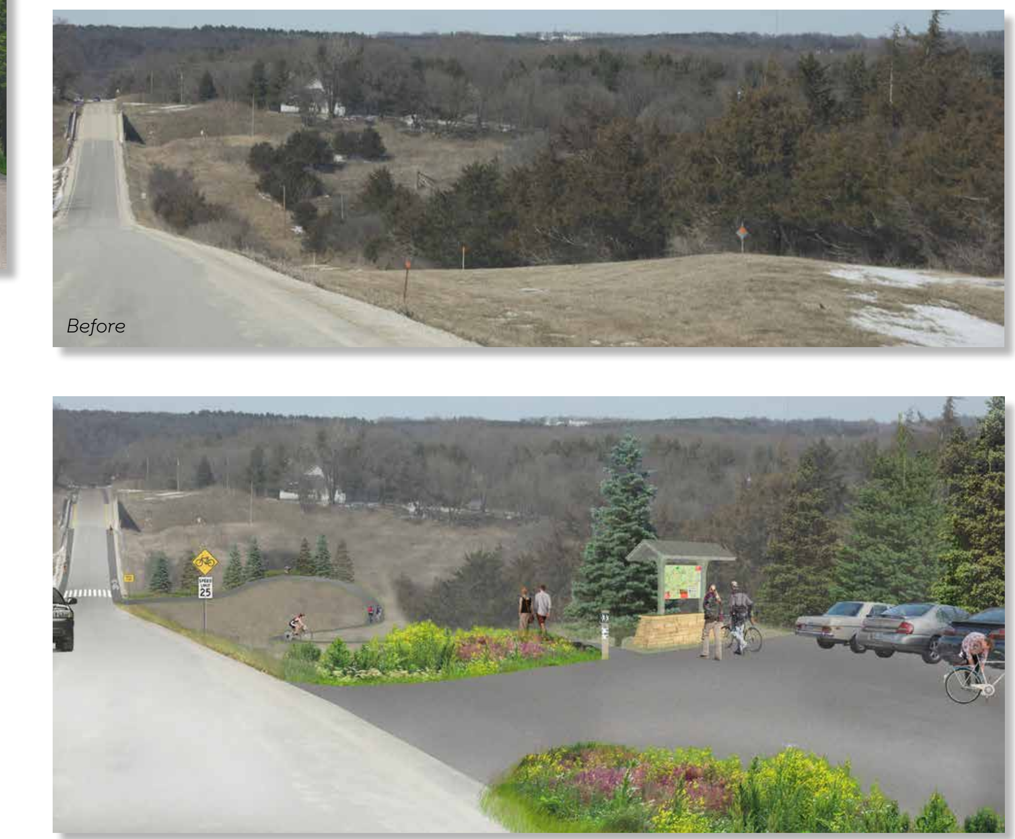
4 Perspective looking north down Pleasant Ave. from the St. Benedict Cemetery showing dedicated paved bike lanes, a crossing, and a new trail accessing a future designated city park.