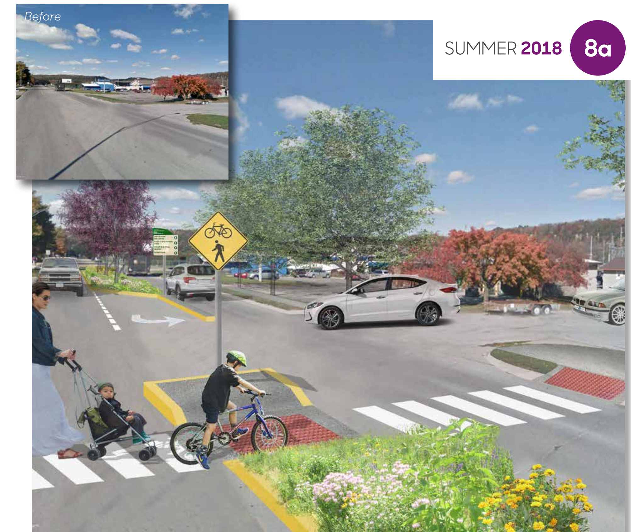
2 North facing perspective on Montgomery Street at the entrance of The Depot, showing the proposed trail crossing to the west of the street.