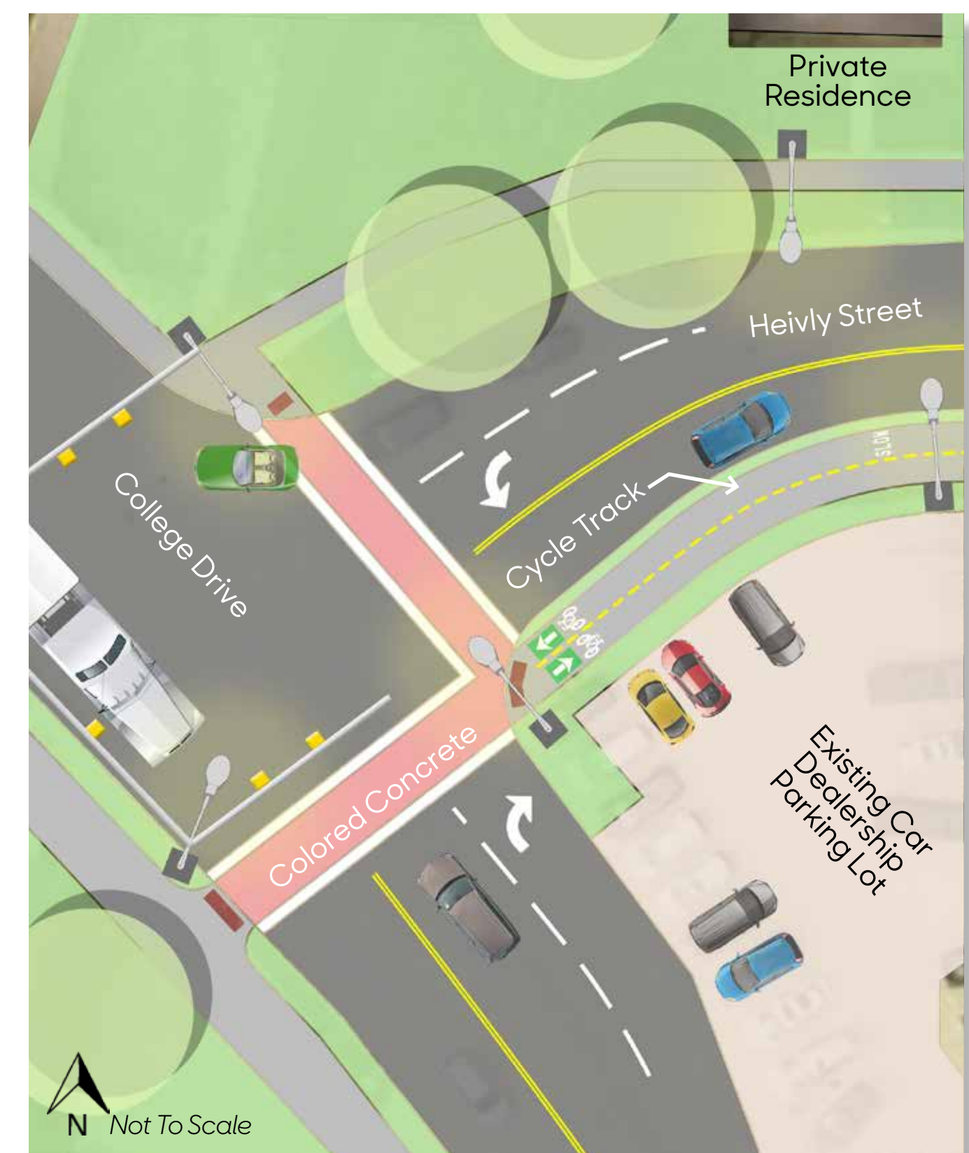
1 Plan view of College Drive and Heivly Street showing optional intersection improvements with a protected two-way bike lane along the south side of Heivly Street.