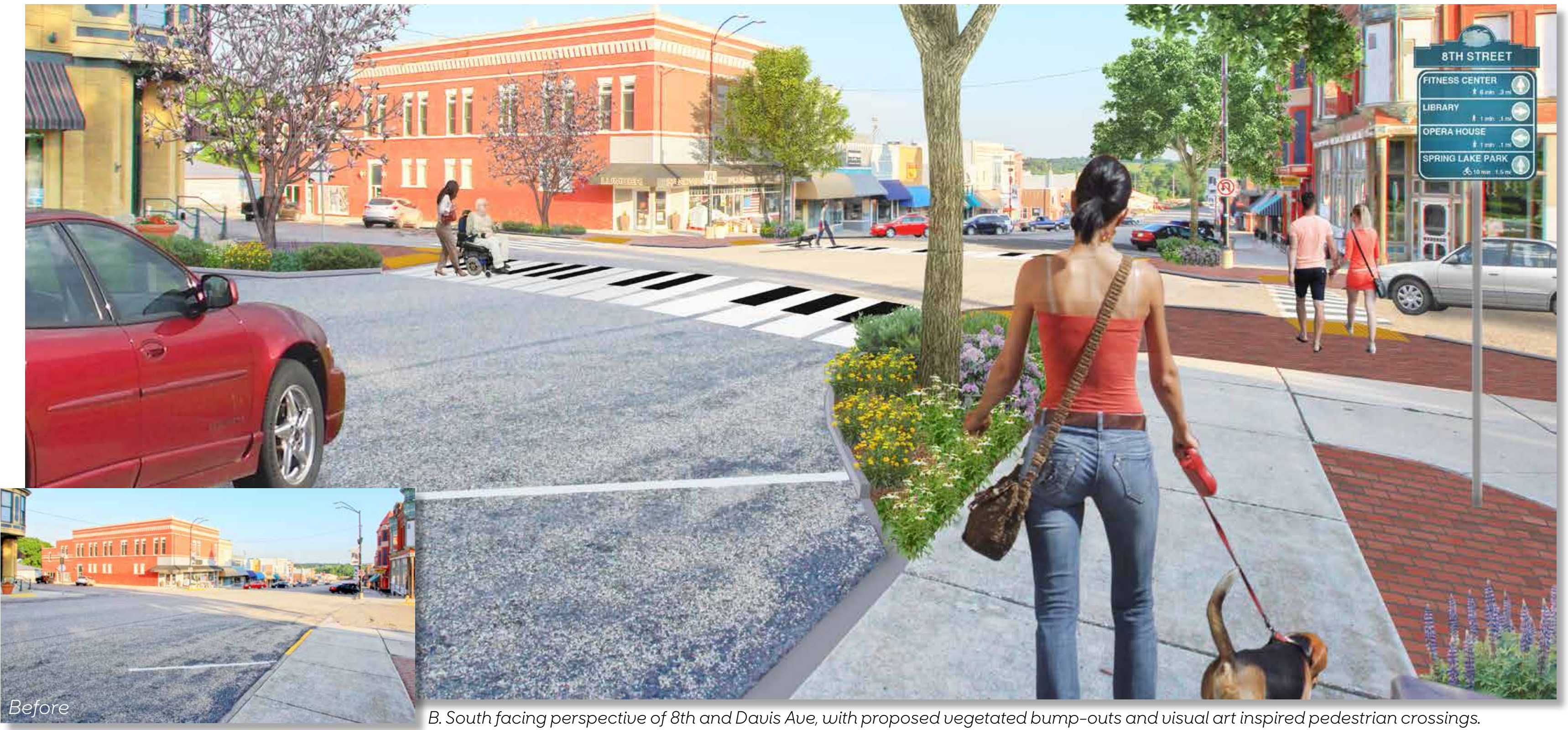
B. South facing perspective of 8th and Davis Ave, with proposed vegetated bump-outs and visual art inspired pedestrian crossings.