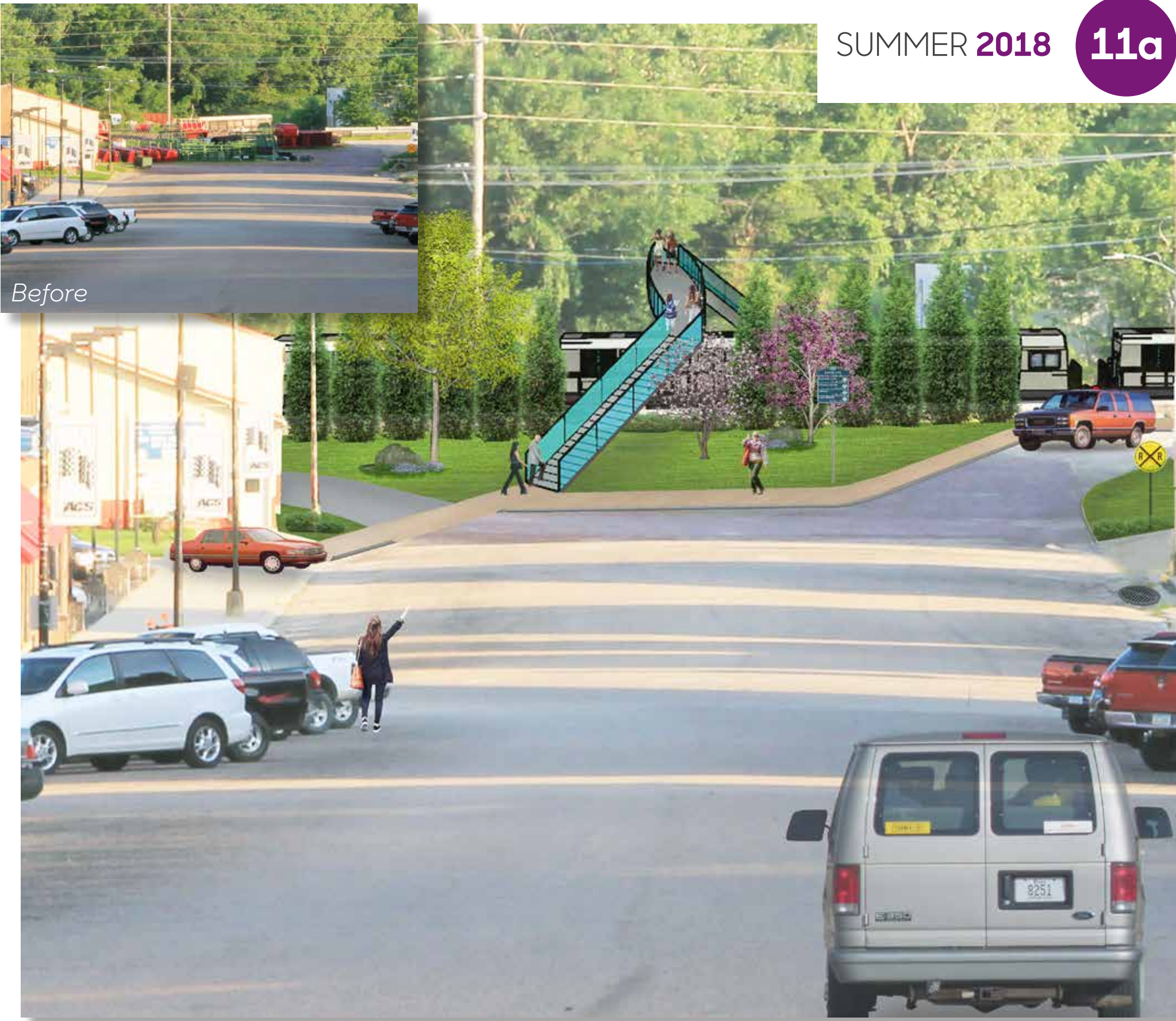
A. South facing perspective of Davis Ave, illustrating a potential pedestrian bridge over the railroad that would extend into the new dog park and river access area.

Downtown is the core identity of Corning, currently there is no vegetation along the streetscape and plenty of concrete, which can contribute to an unfriendly pedestrian environment. Discussions with the steering committee and Corning residents revealed a desire to address this issue, as well as pedestrian safety and accessibility. The proposed design adds vegetated bump-outs that decrease pedestrian crossing distances, intercept stormwater runoff from rain events, and enhance the existing beauty of downtown Corning.