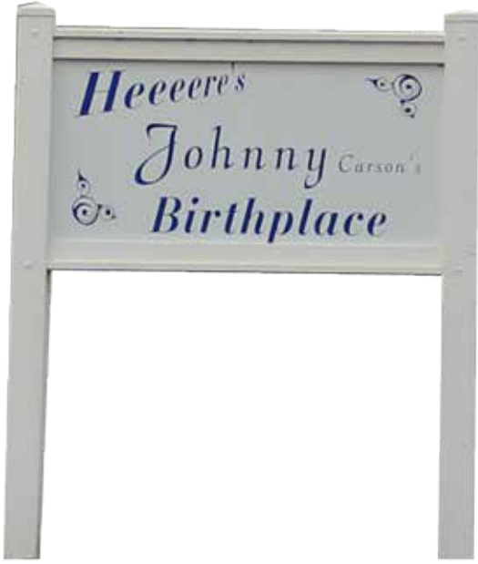
Existing Park Entry Sign