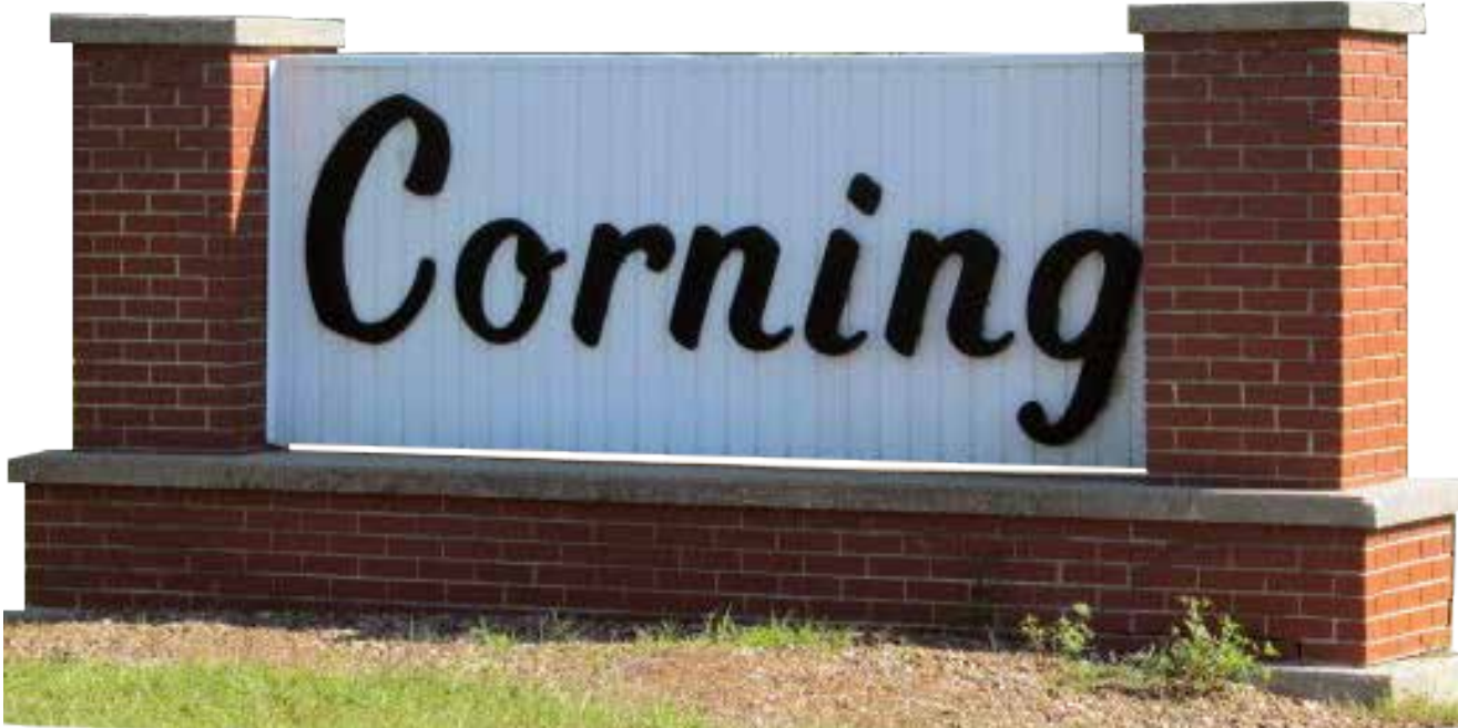
Existing Community Entry Sign