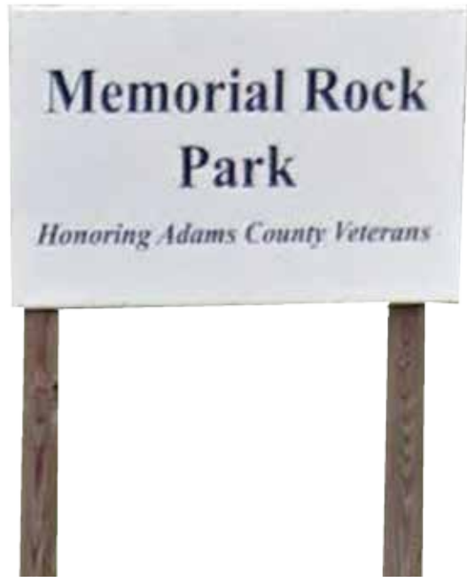
Existing Park Entry Sign

The most effective signage is that which displays information in a clear and consistent manner. Creating a consistent family of signage throughout the community will help to enhance Corning's identity. Here are several options for alternative branding inspired by community amenities , such as the lakes and Opera House, as well as the various applications for their use.