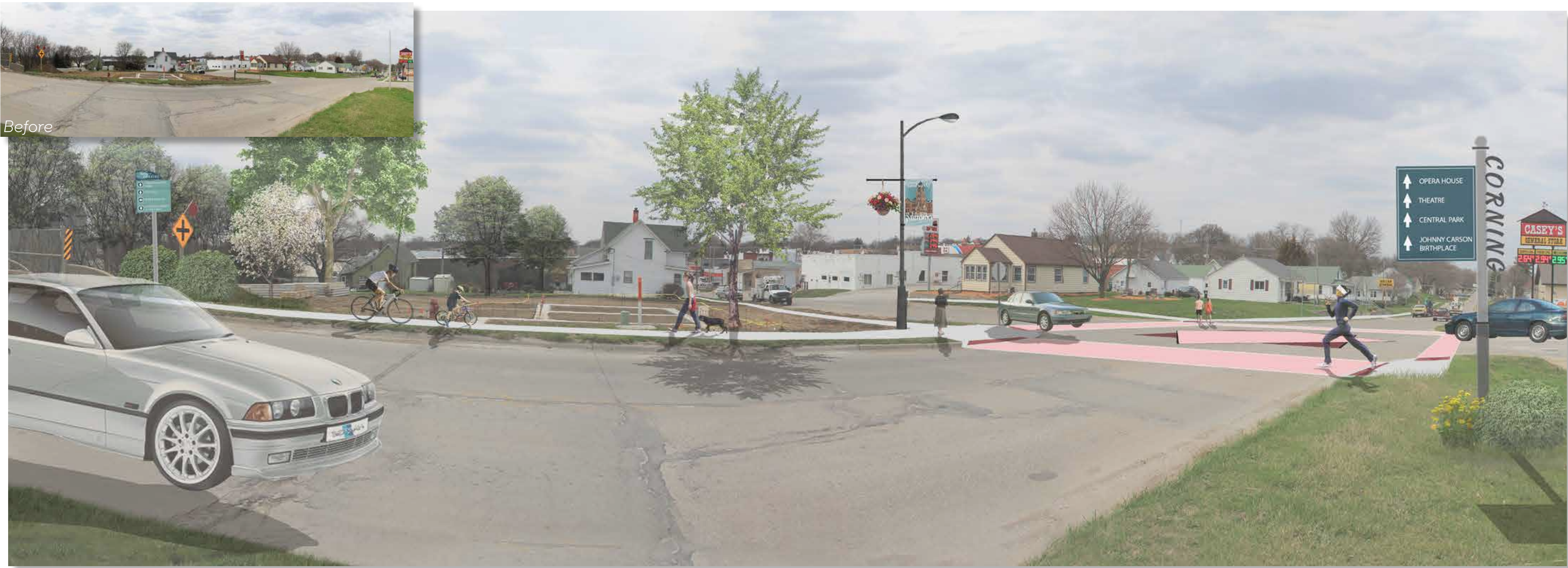
A. Perspective showing sidewalk safety improvements on Qunicy St, at the intersection of 6th St.

As sidewalks are updated over time, curb ramps should be included for ADA accessibility. However, with Corning's hilly terrain ADA accessibility will not always be achievable. The proposed sidewalk along Hull Street is too steep to be an accessible route. Both sidewalk and trail improvements offer a holistic look at community-wide accessibility that can be strategically phased in over time.