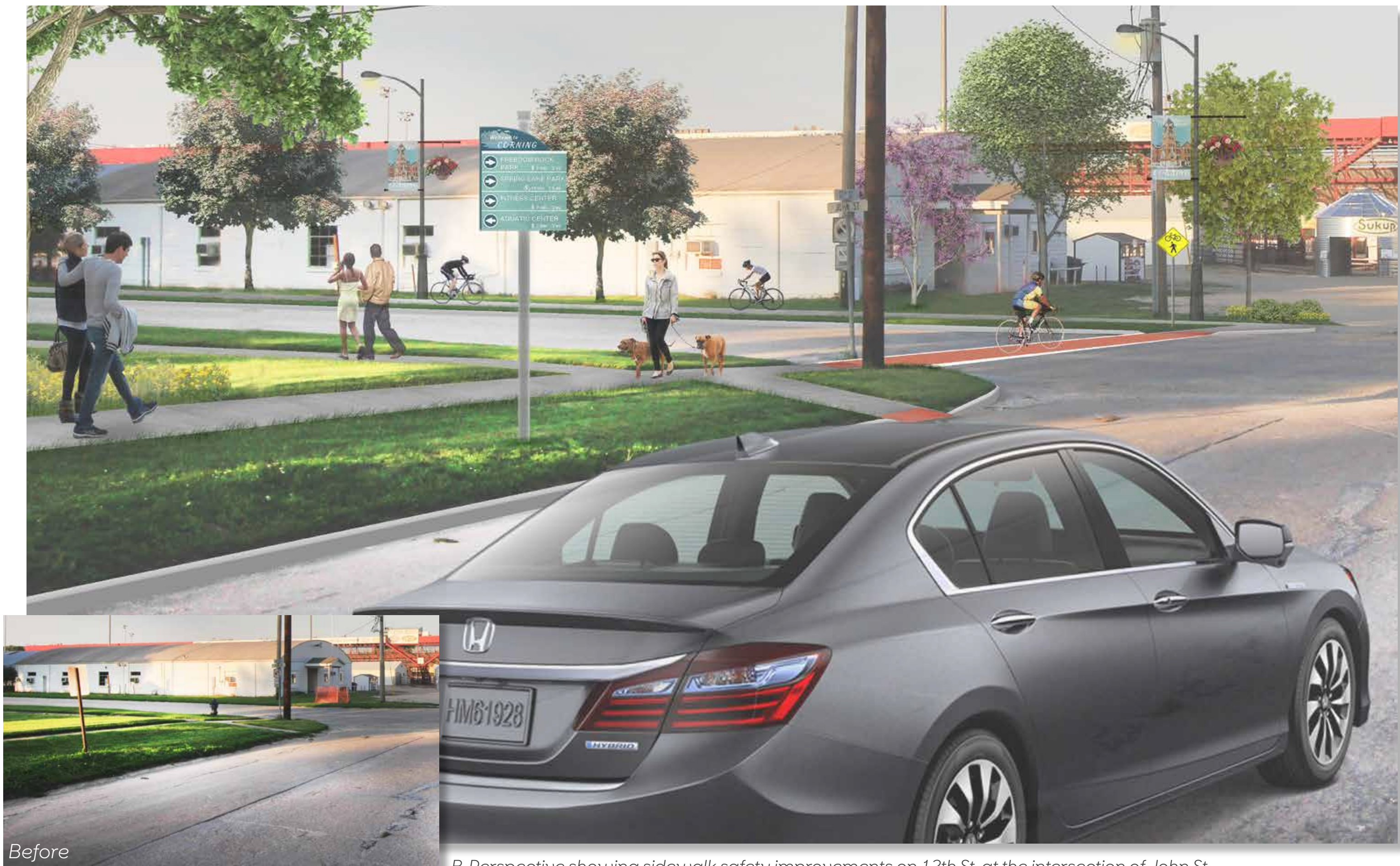
B. Perspective showing sidewalk safety improvements on 12th St, at the intersection of John St.