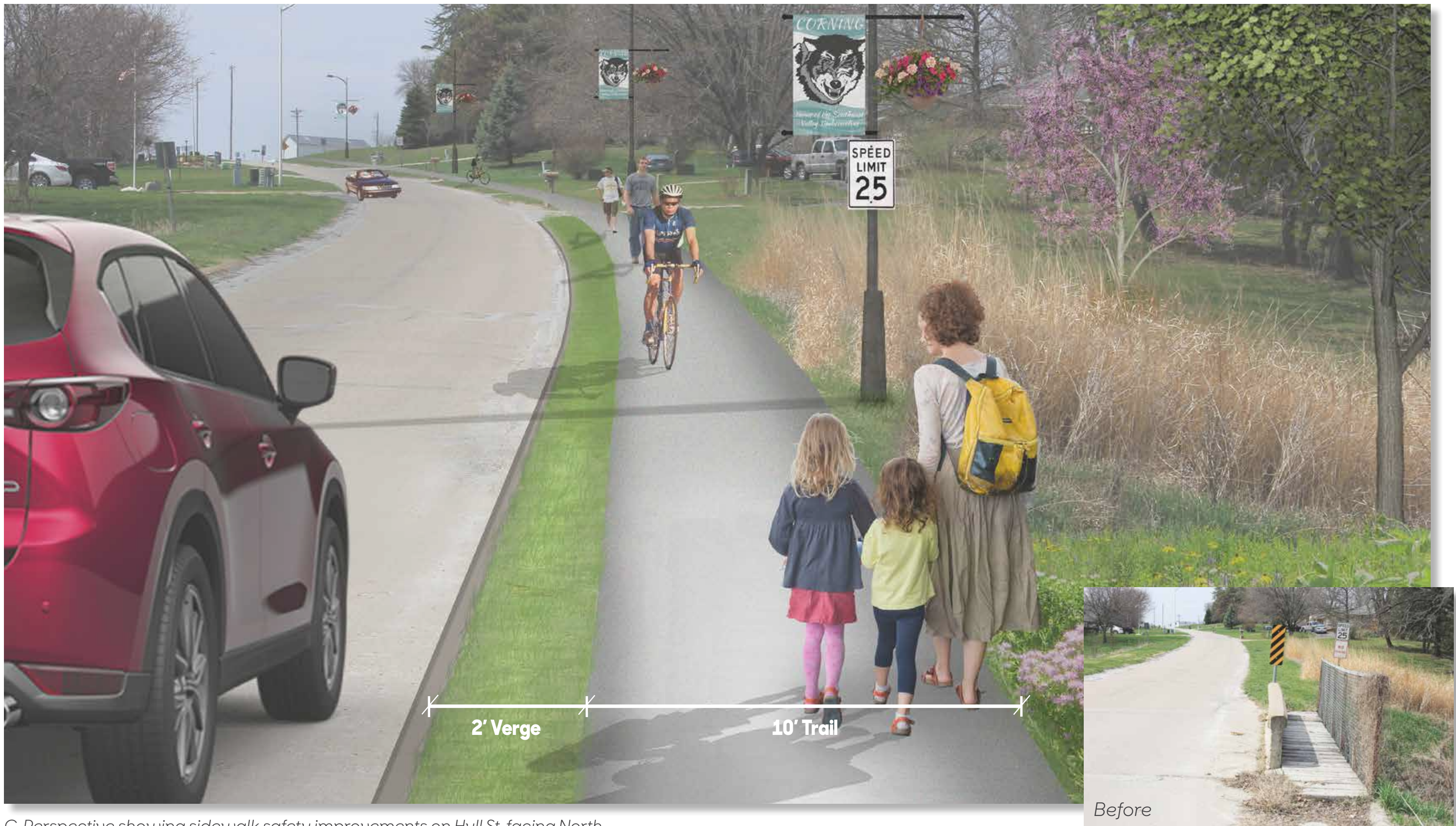
C. Perspective showing sidewalk safety improvements on Hull St, facing North.