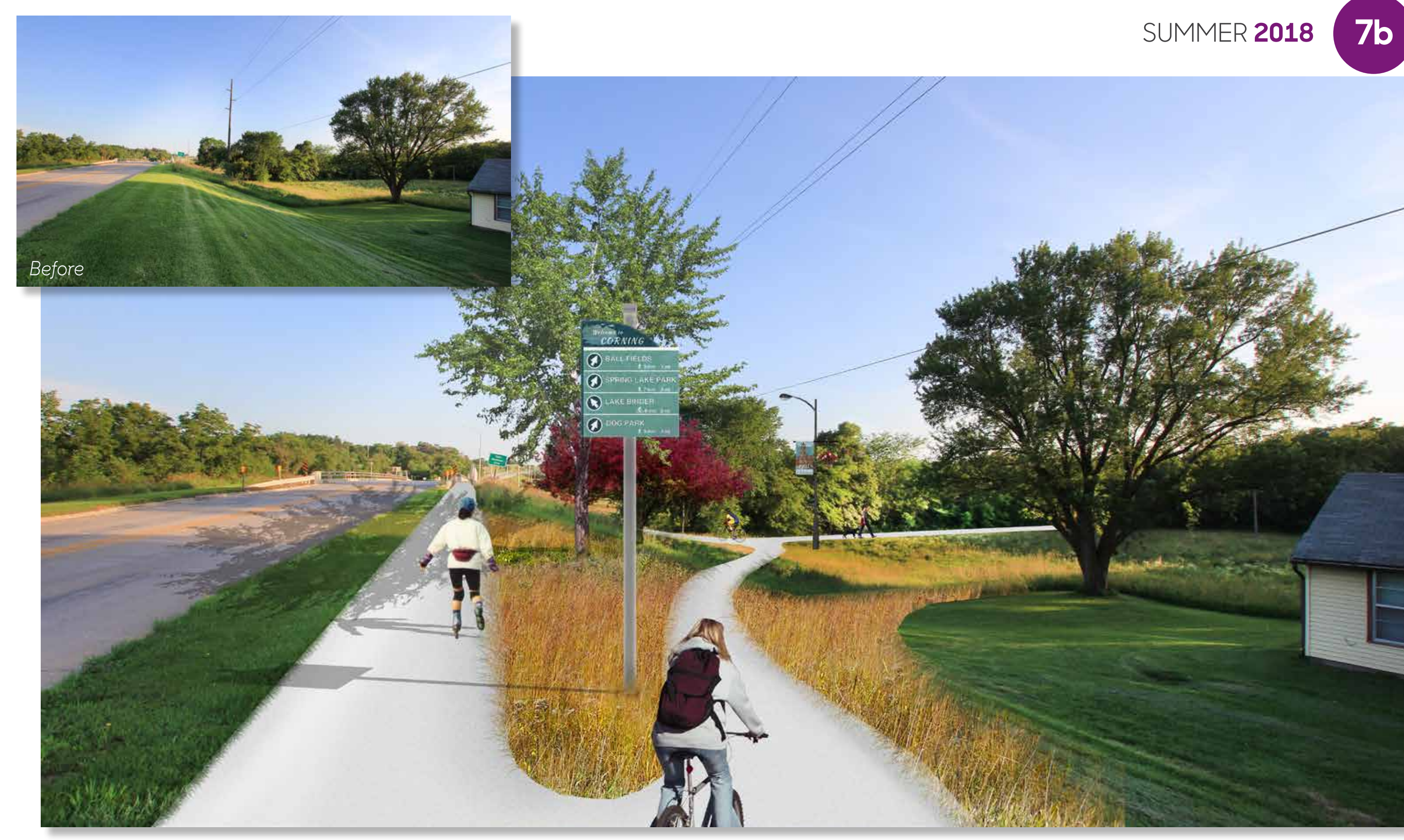
A. Perspective looking south along Highway 148 north of the river showing how the trail splits off, providing access west to the dog park and east under the bridge to Lake Binder.