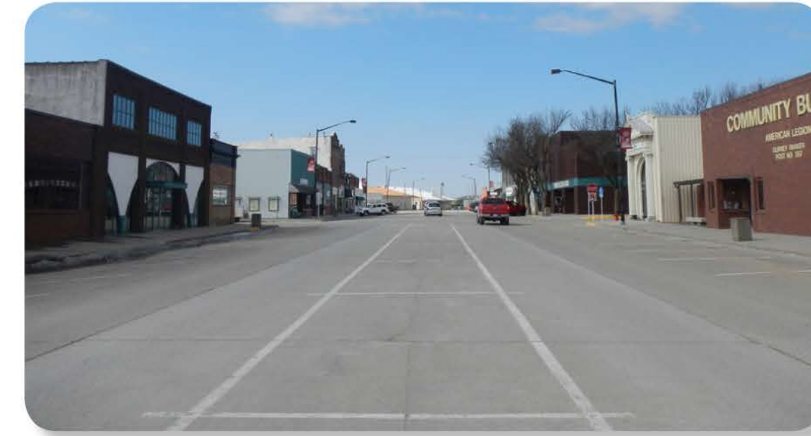
Downtown Streetscape Enhancement Opportunity