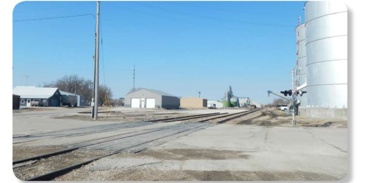
Desired Intersection (Hwy Street and Railroad) Updates (Way-Finding Signage, Pavement Improvement etc.)