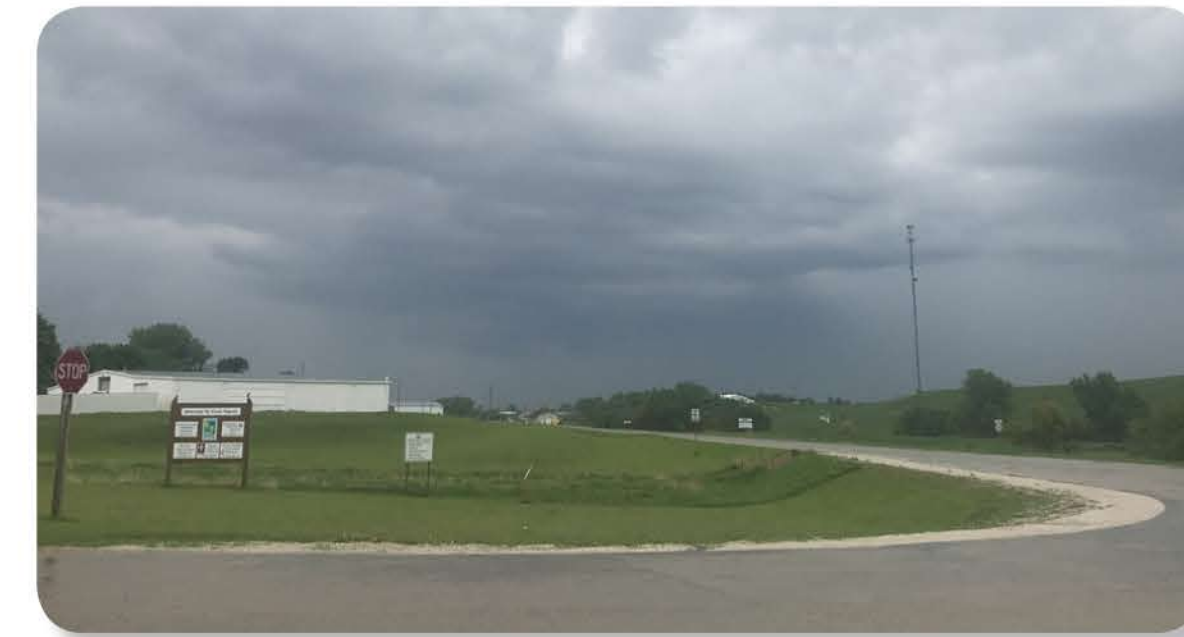
Hwy Street Arrival Experience Enhancement (Hwy Street and Hwy 141 Intersection)

The community concept plan is based on input from both the visioning committee and residents of Coon Rapids, and brings together ideas, goals, and visions for improvements.