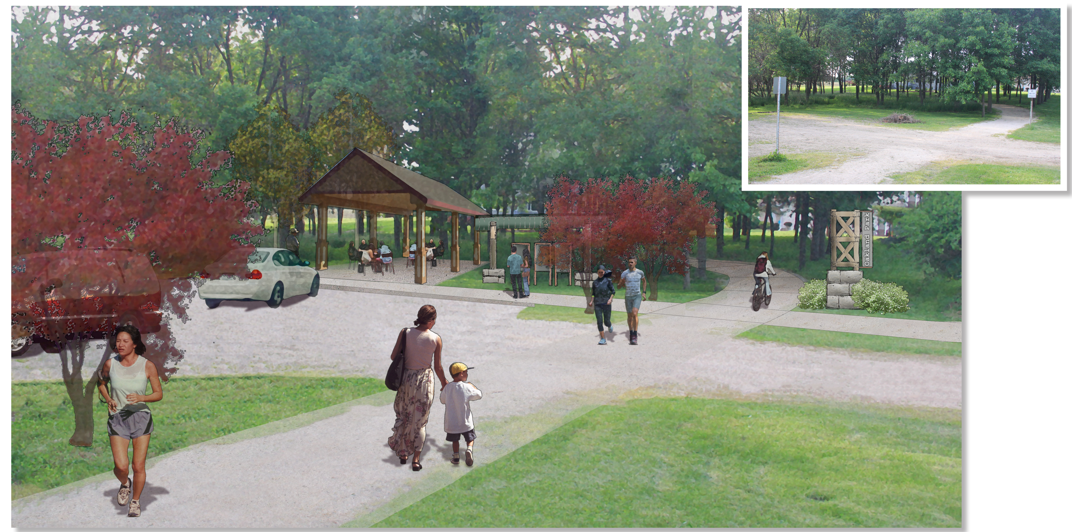
Perspective image showing proposed conditions of the Oakland Park Trailhead.