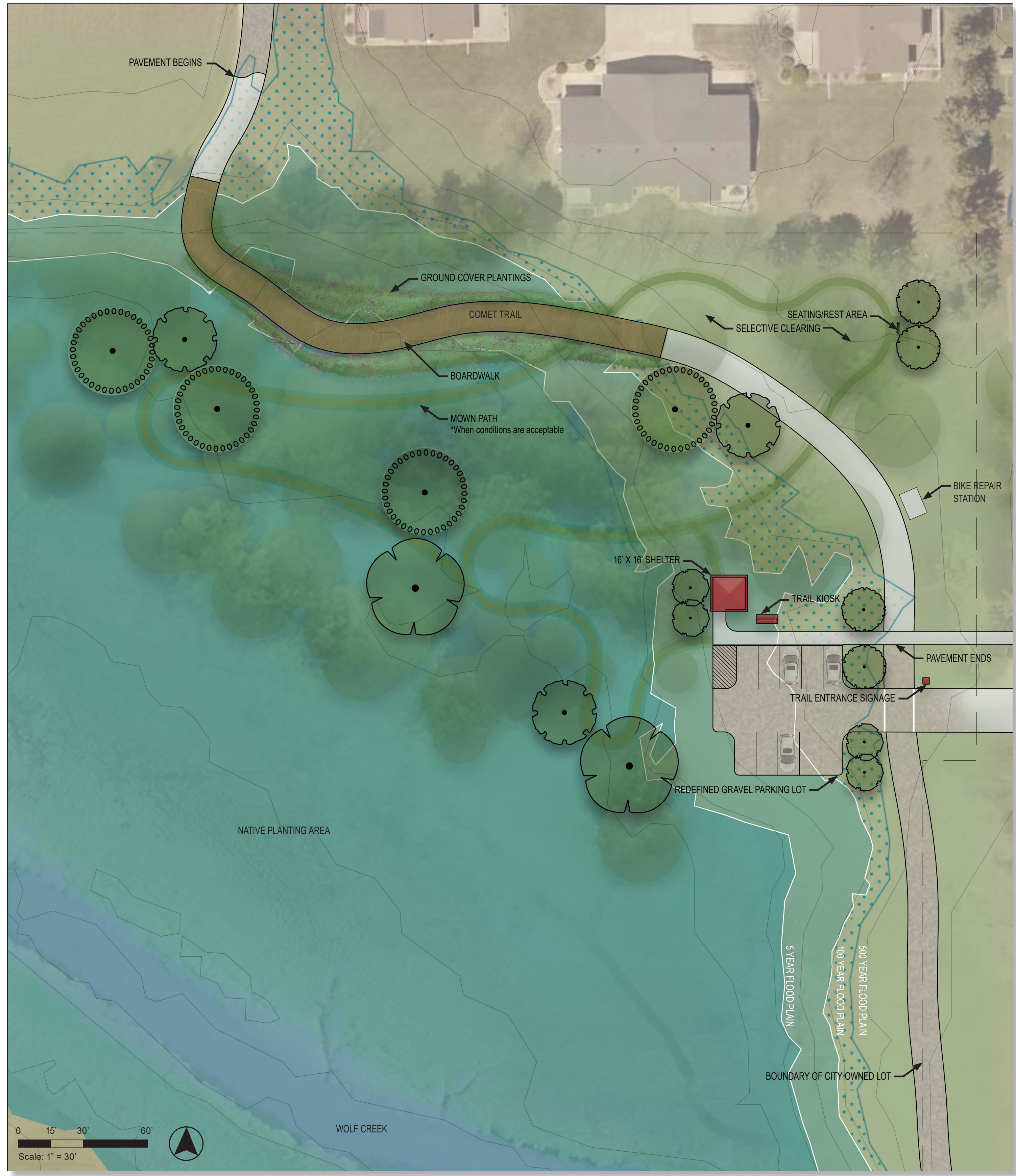
Proposed plan view of Oakland Park trailhead.

Other amenities include: a mown inter-loop trail, a defined parking lot, a park shelter, a trail map kiosk, a bike repair station, and park signage.