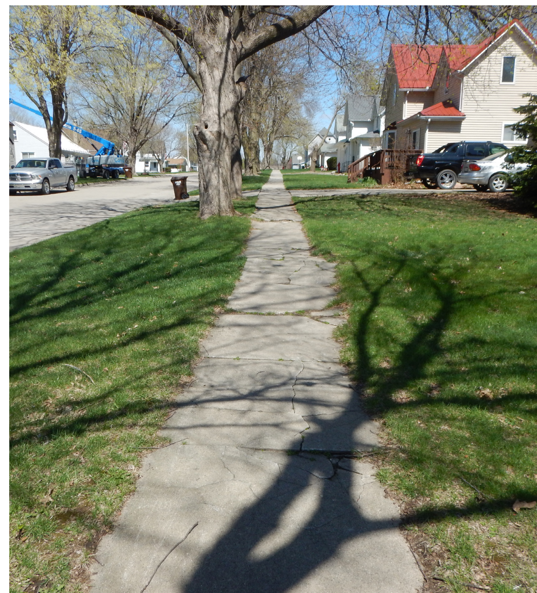
Uneven and difficult-to-pass sidewalks have been labeled as a barrier to Conrad's transportation system.

Items of concern related to the transportation system include the need for accessible sidewalks and a sidewalk along S Main Street. The community has also expressed interest in finding a solution to the washout and ponding that happens on the Comet Trail.