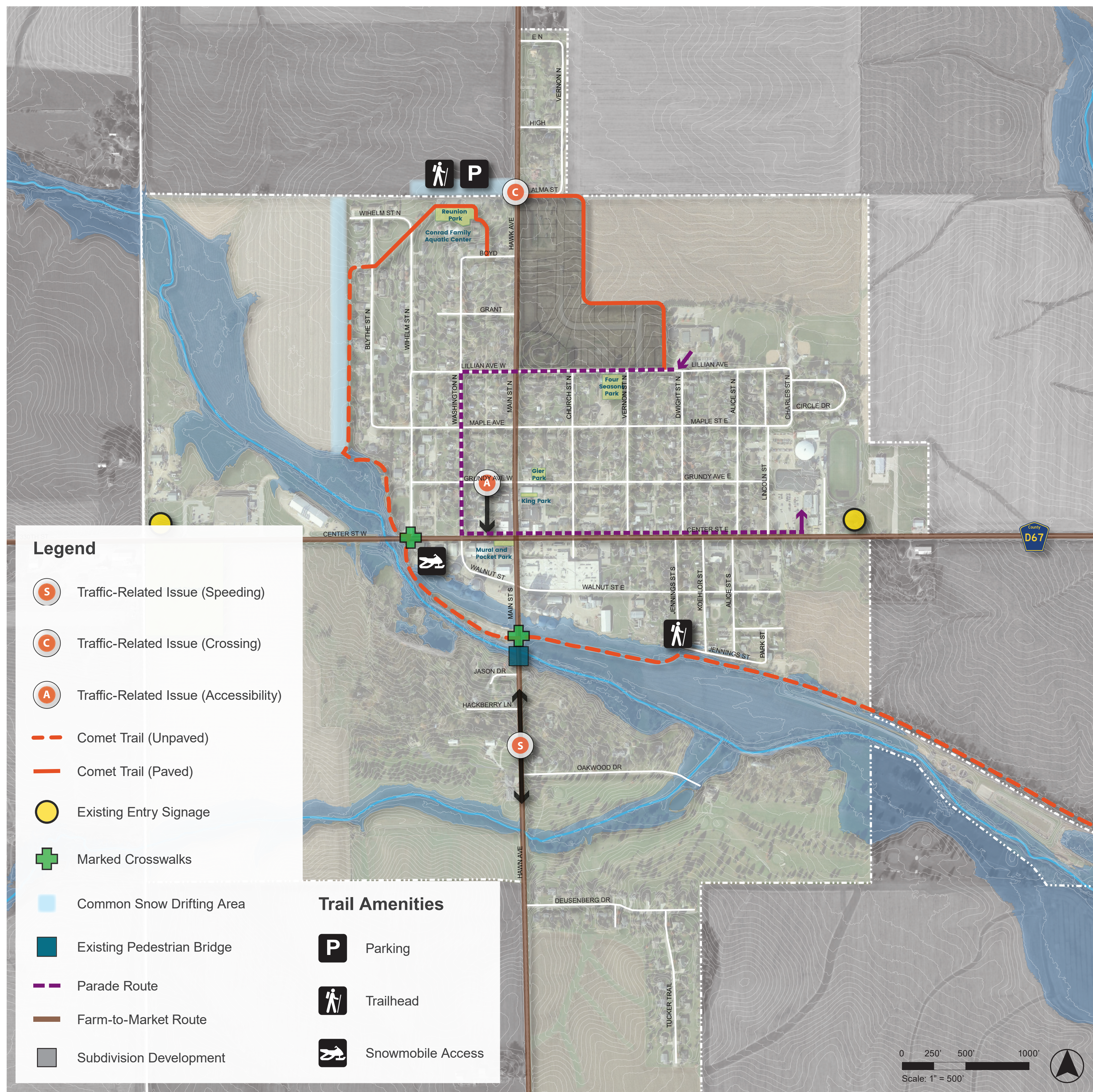
Map of Conrad highlighting and analyzing existing transportation infrastructure.