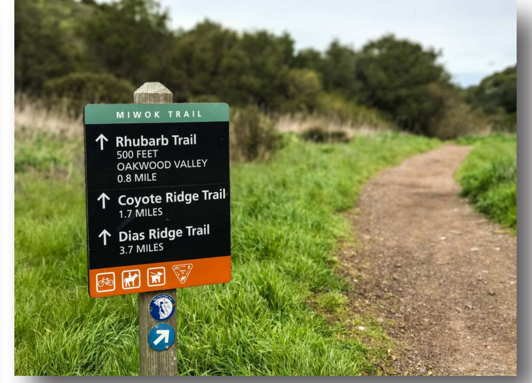
A Trail at Coyote Ridge Loop