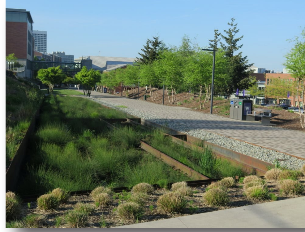
The Prairie Line Trail in Tacoma, WA