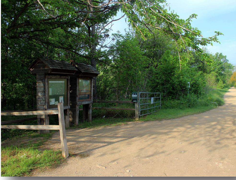
The Zilker Park Trailhead