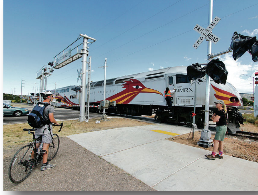
Rail Trail Crossing