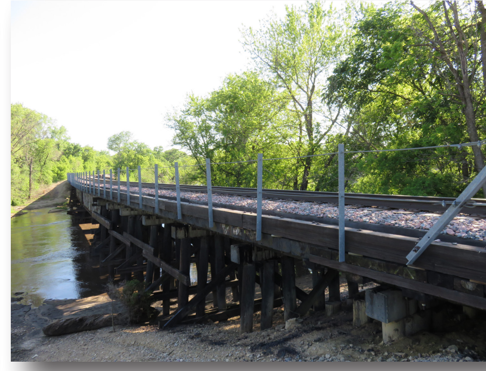
Historic Train Trestle Bridge