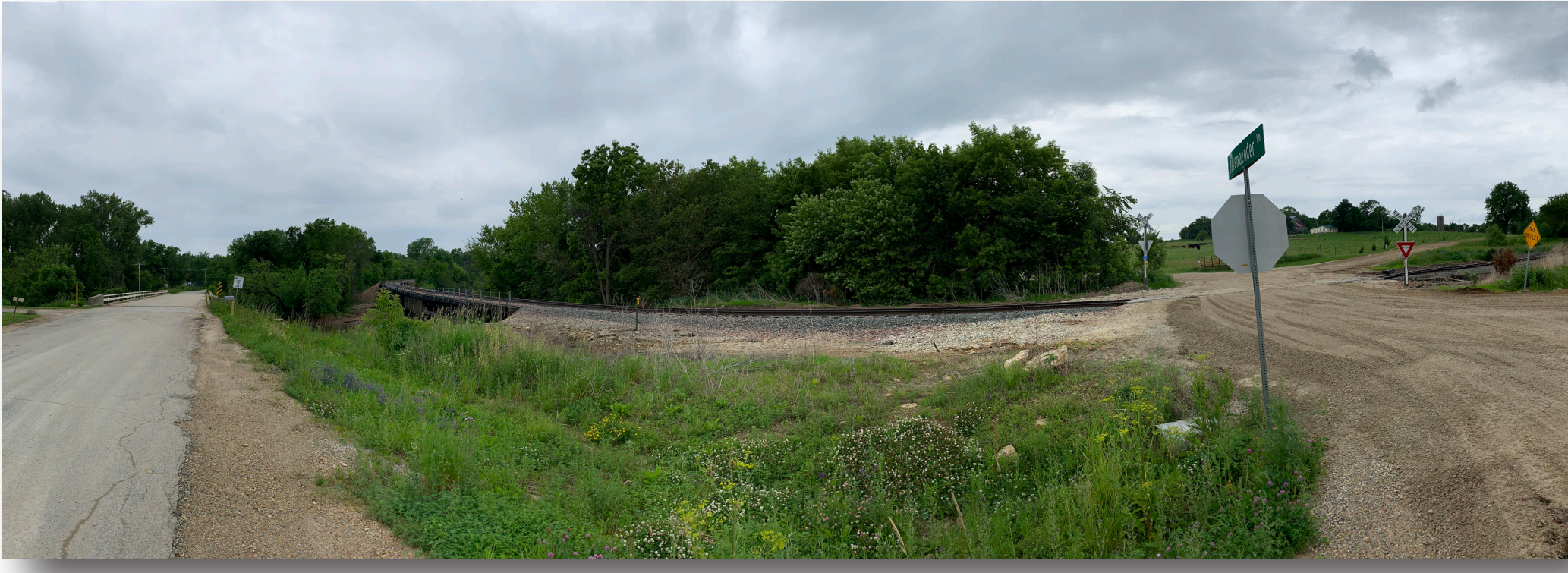
Corner of 3rd St. N and Betenbender Lane