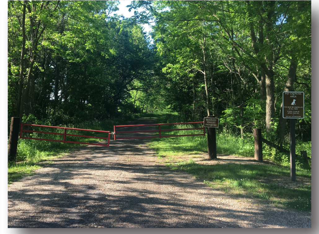
Buffalo Creek Park Trailhead

"I just really want the bike trail. I think that would help a lot to get people down here more, especially if we do it near the camping grounds. That'll hopefully bring in more people."