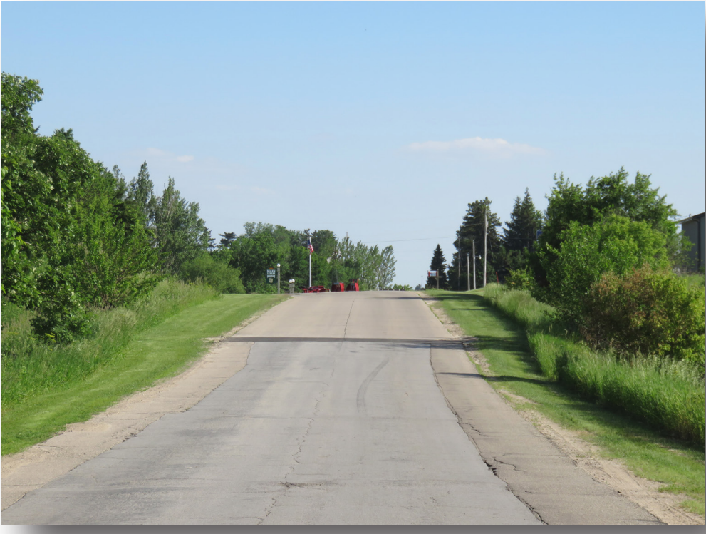
Third Street to Coggon Market: No Sidewalks