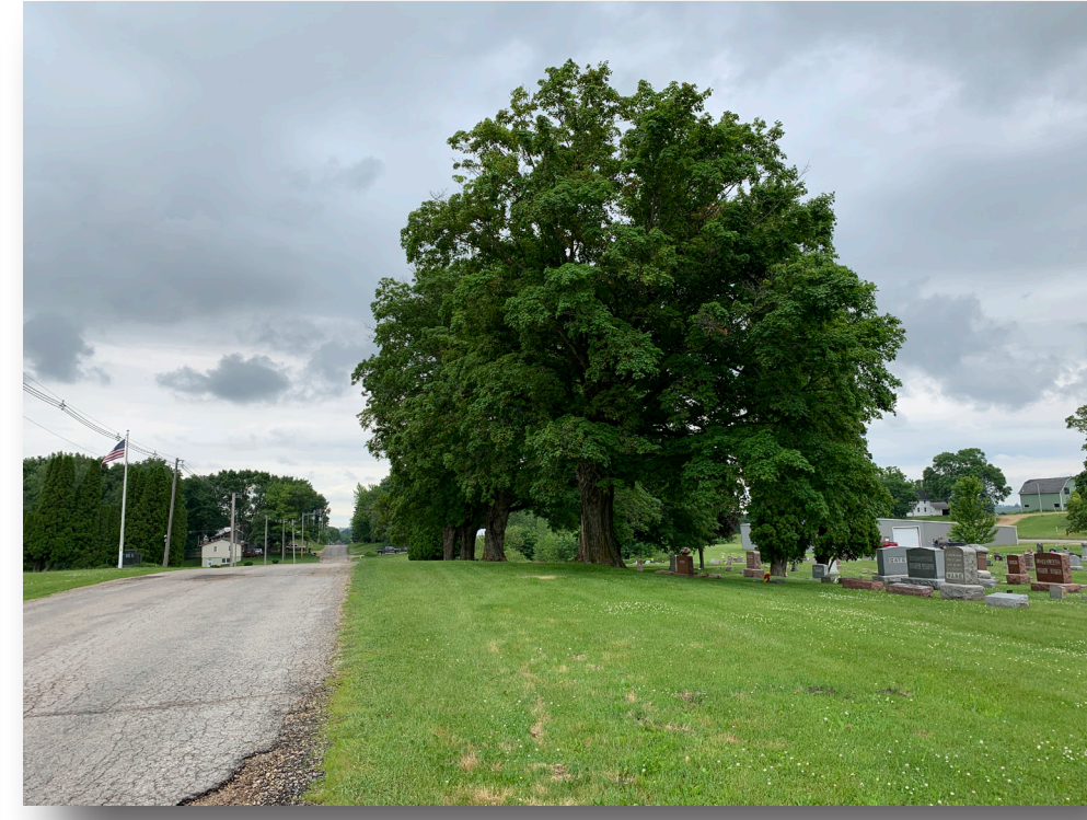
Coggon Cemetery: Few Benches/Paths