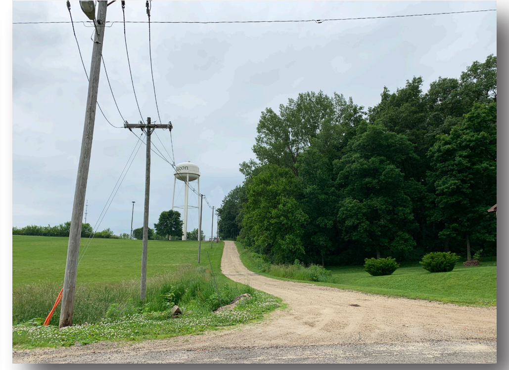
A Dead End Road to Water Tower

“There’s several times..when my wife and I are walking, we would rather walk in the street because the sidewalks are very rough...”