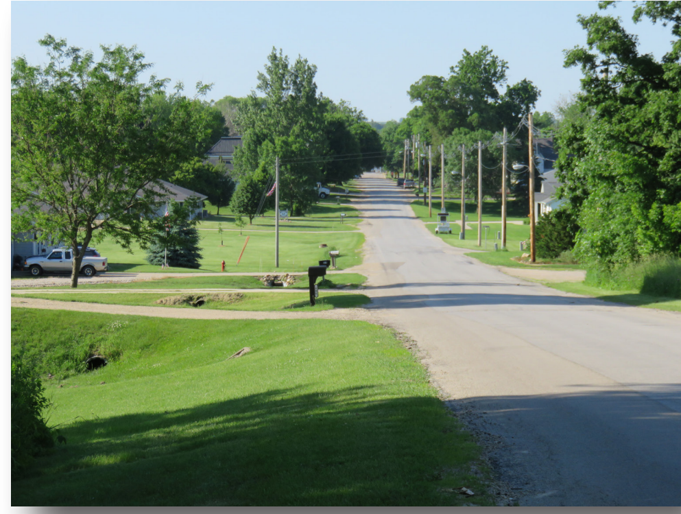
Third Street S: No Sidewalks