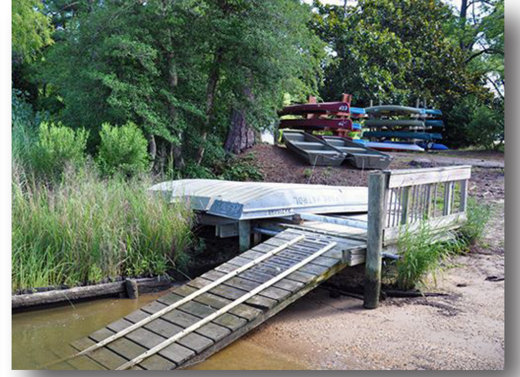
Launching Dock at Chickahominy Riverfront Park