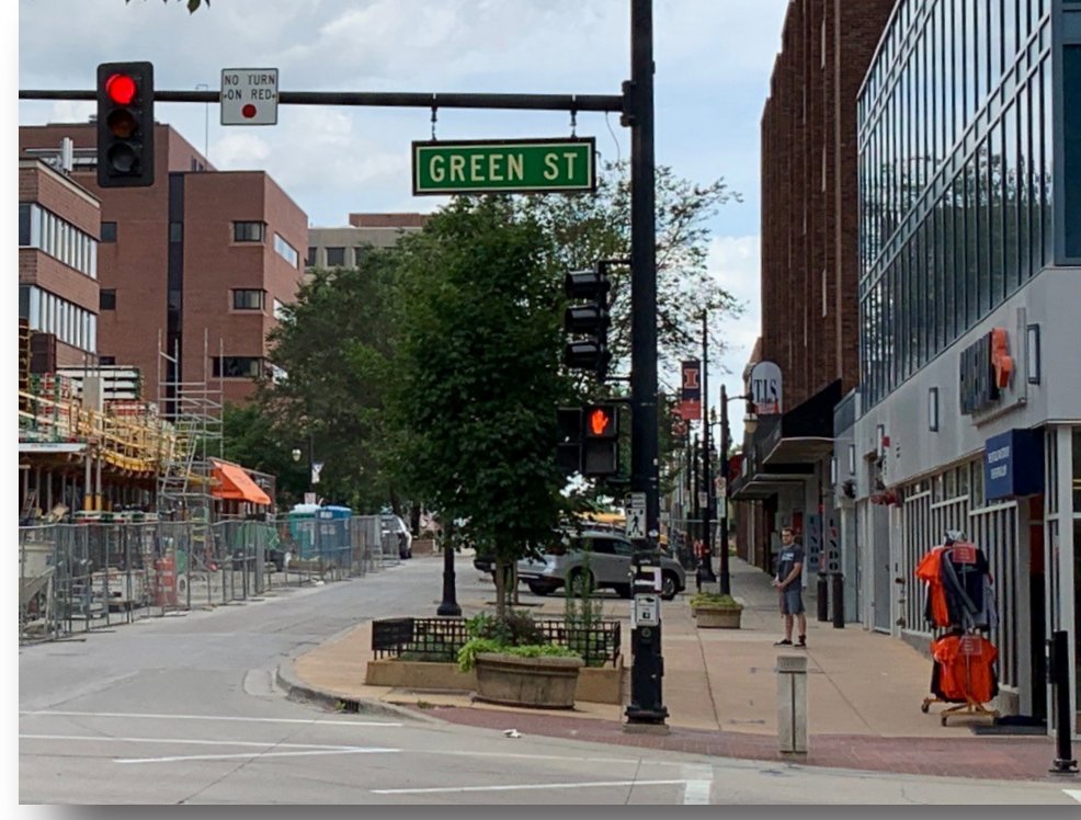
Urbana Champaign, IL: Intersection Improvements