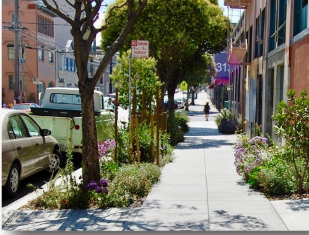
San Francisco Sidewalk Gardens (Pedestrian Improvements)