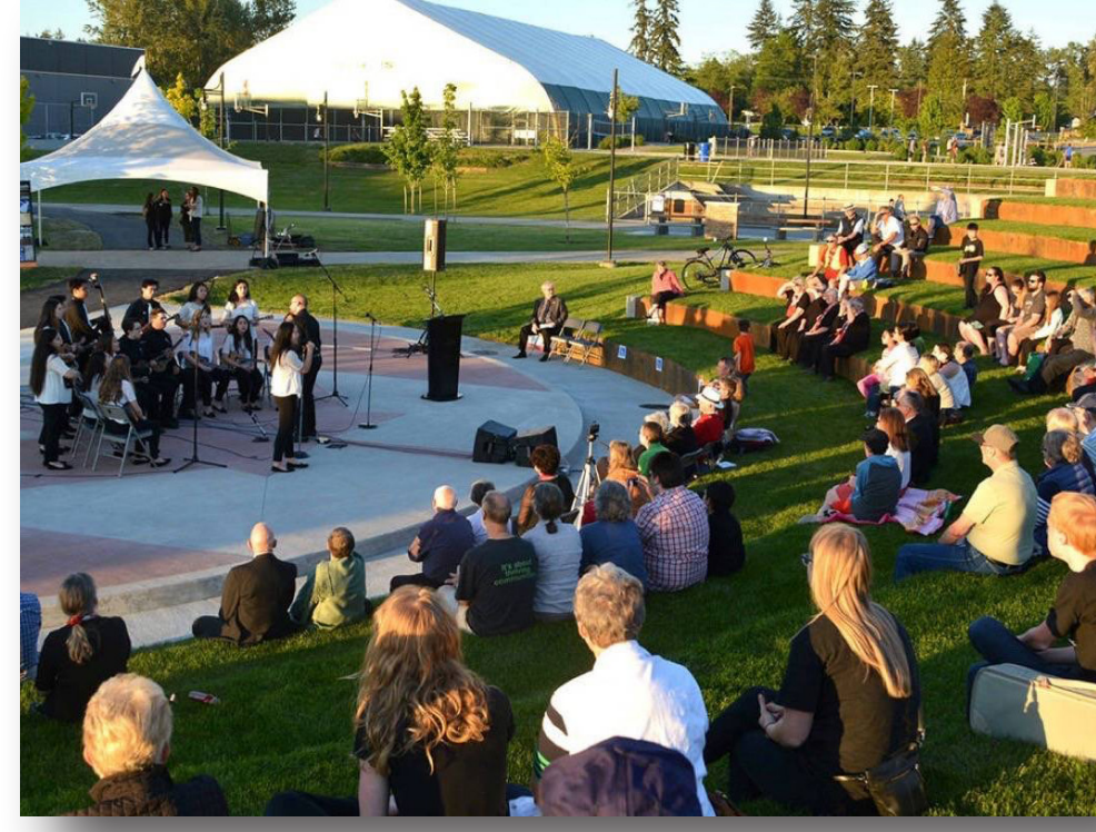
Willoughby Amphitheatre: Community Concert