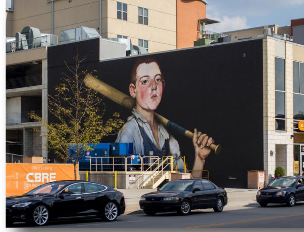
Downtown Cincinnati Mural (Facade artwork)