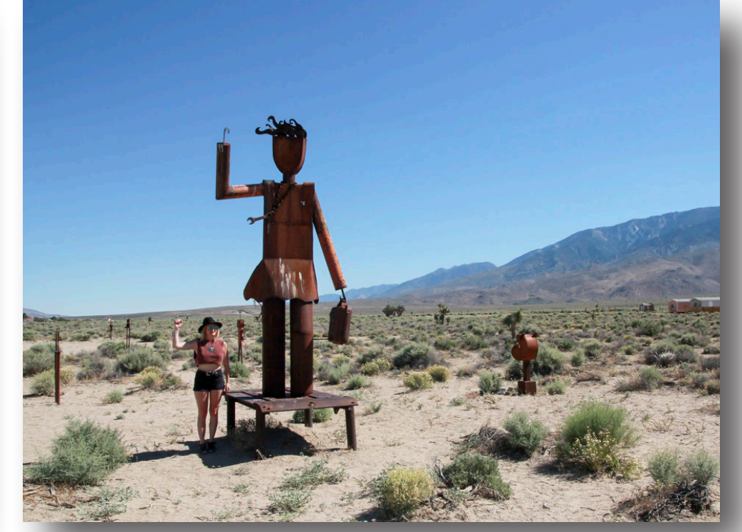
Sculptures of Highway 395