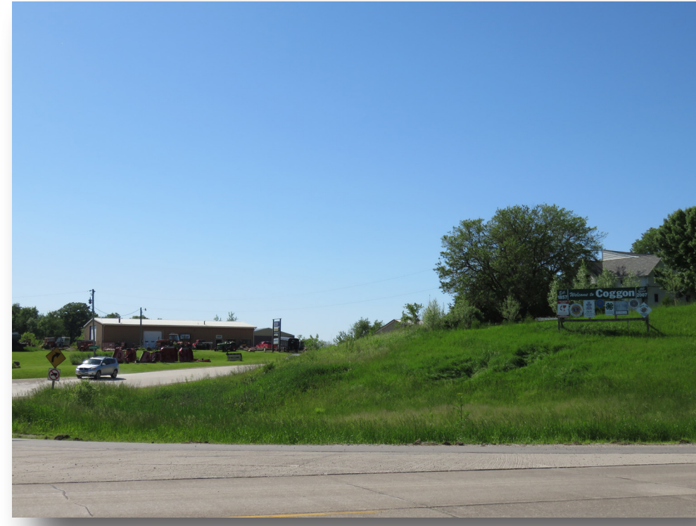
Coggon South Entrance: Current Signage is Inconspicuous