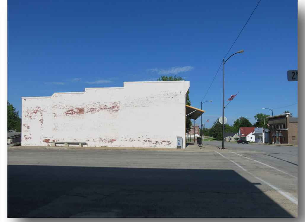
City Library: Facade Maintenance Req.

“For walking, I would like to be able to have a safe way to walk to and from places because there aren’t sidewalks on every street, and so I tend to use the middle of the road, which isn’t a good decision on my part.”