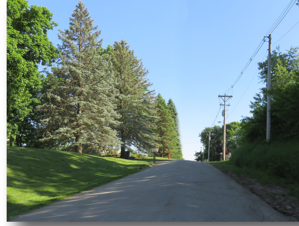
Second Street S: No Sidewalks