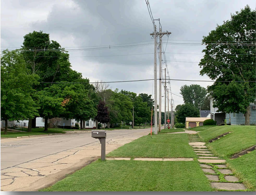
Second Street S: Inconsistent and Impaired Sidewalk