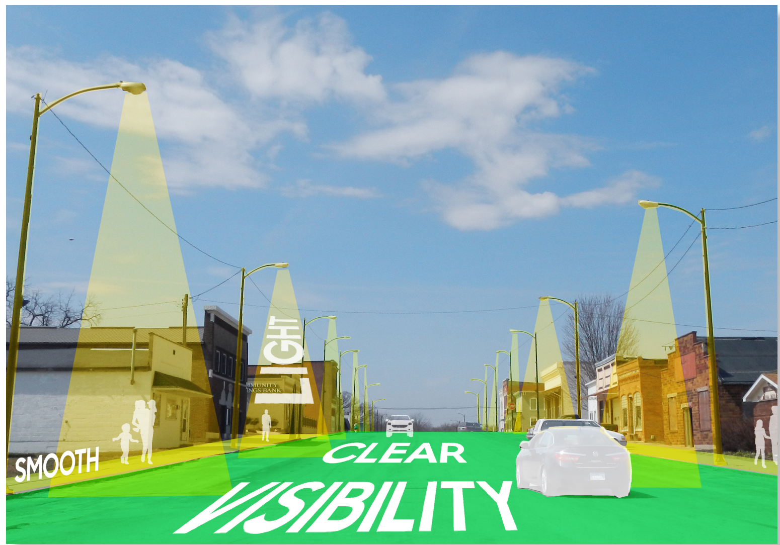
Main Street has good road visibility and lighting.