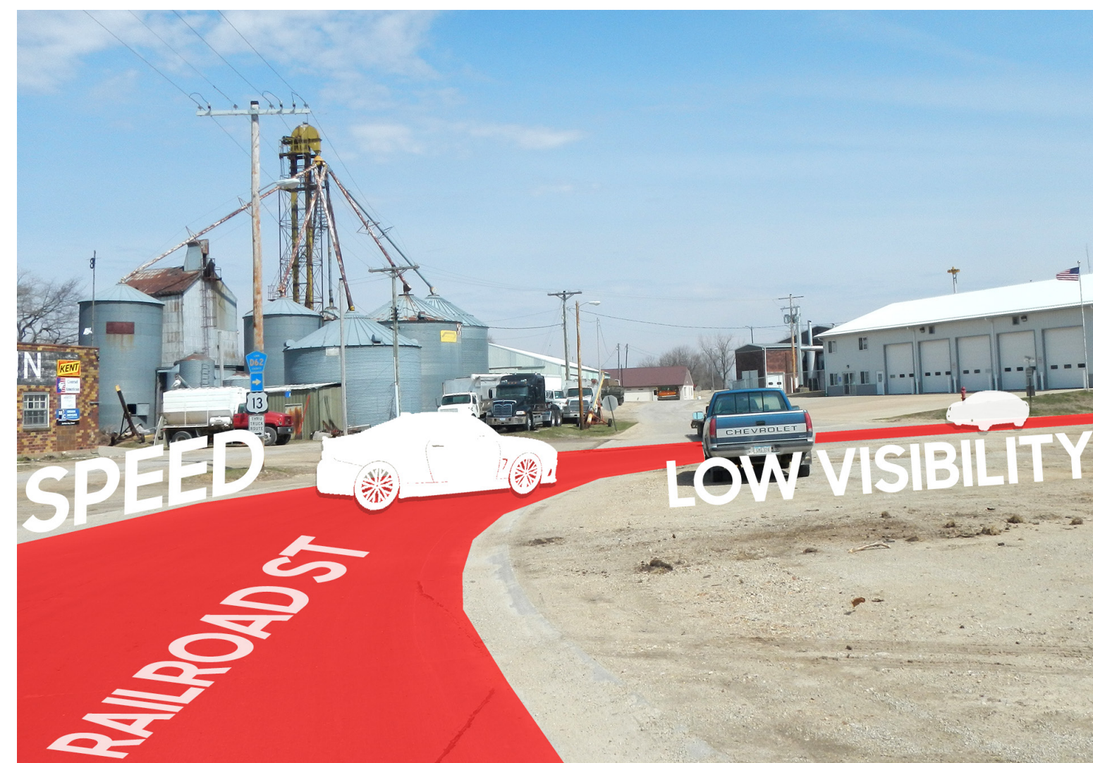
Visibility is compromised on Railroad street.