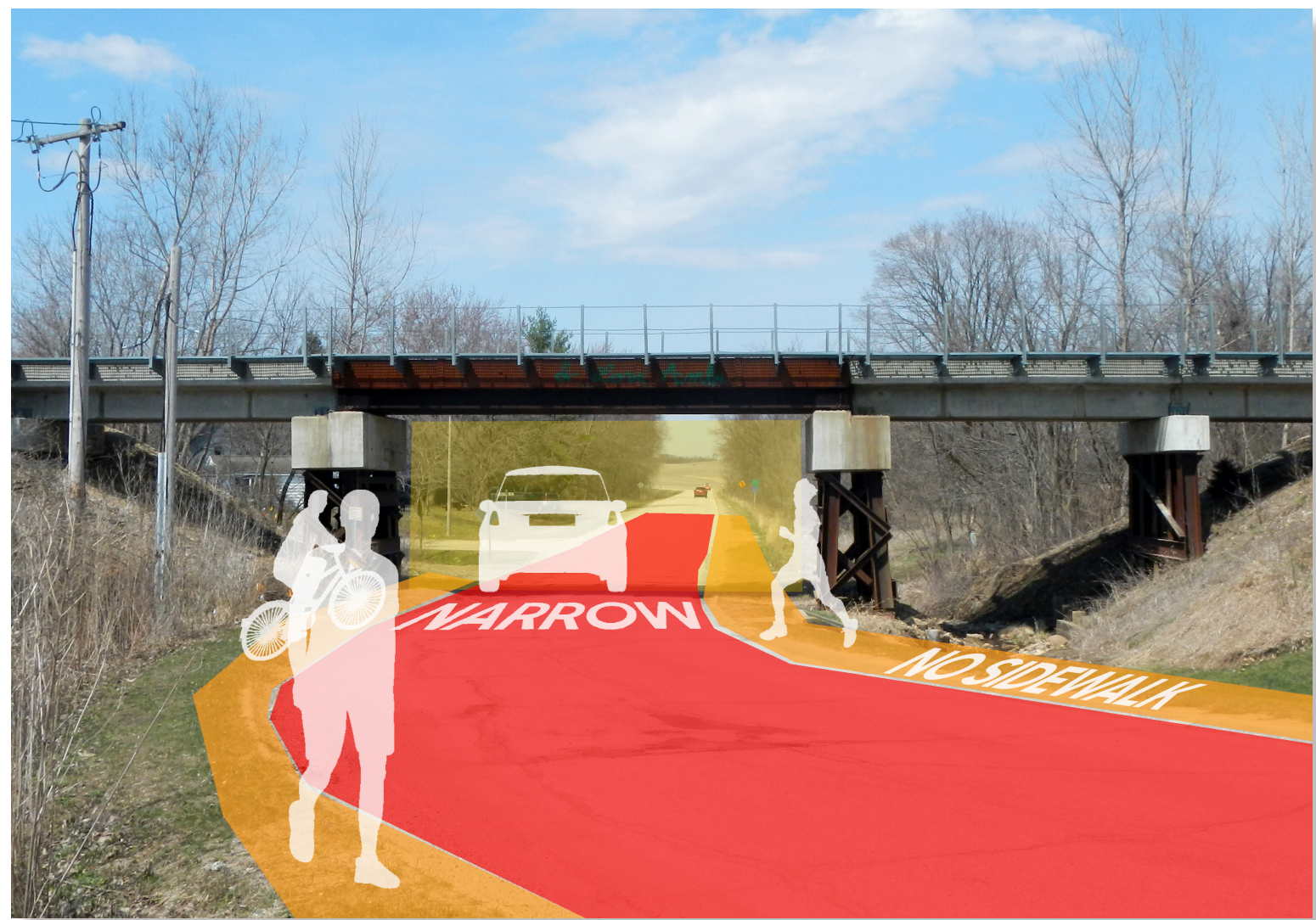
D62 underpass is considered narrow and has no sidewalks for pedestrians.