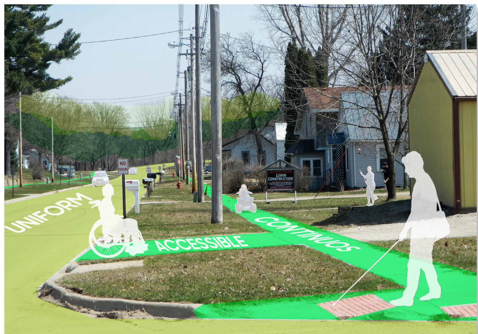
D62 has a uniform, well-maintained road and accessible sidewalks.