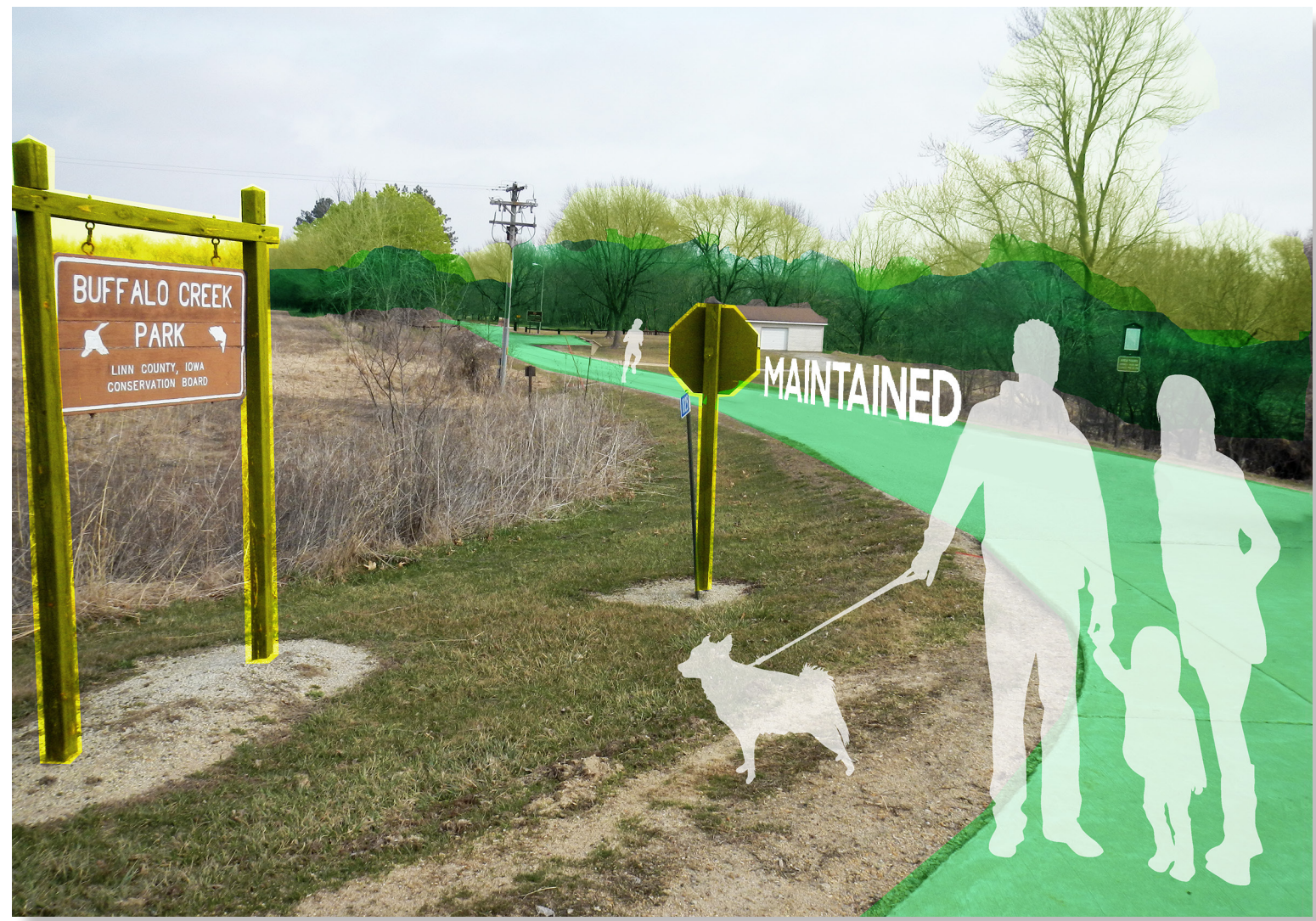
The community enjoys the trails and greenery at Buffalo Creek Park.