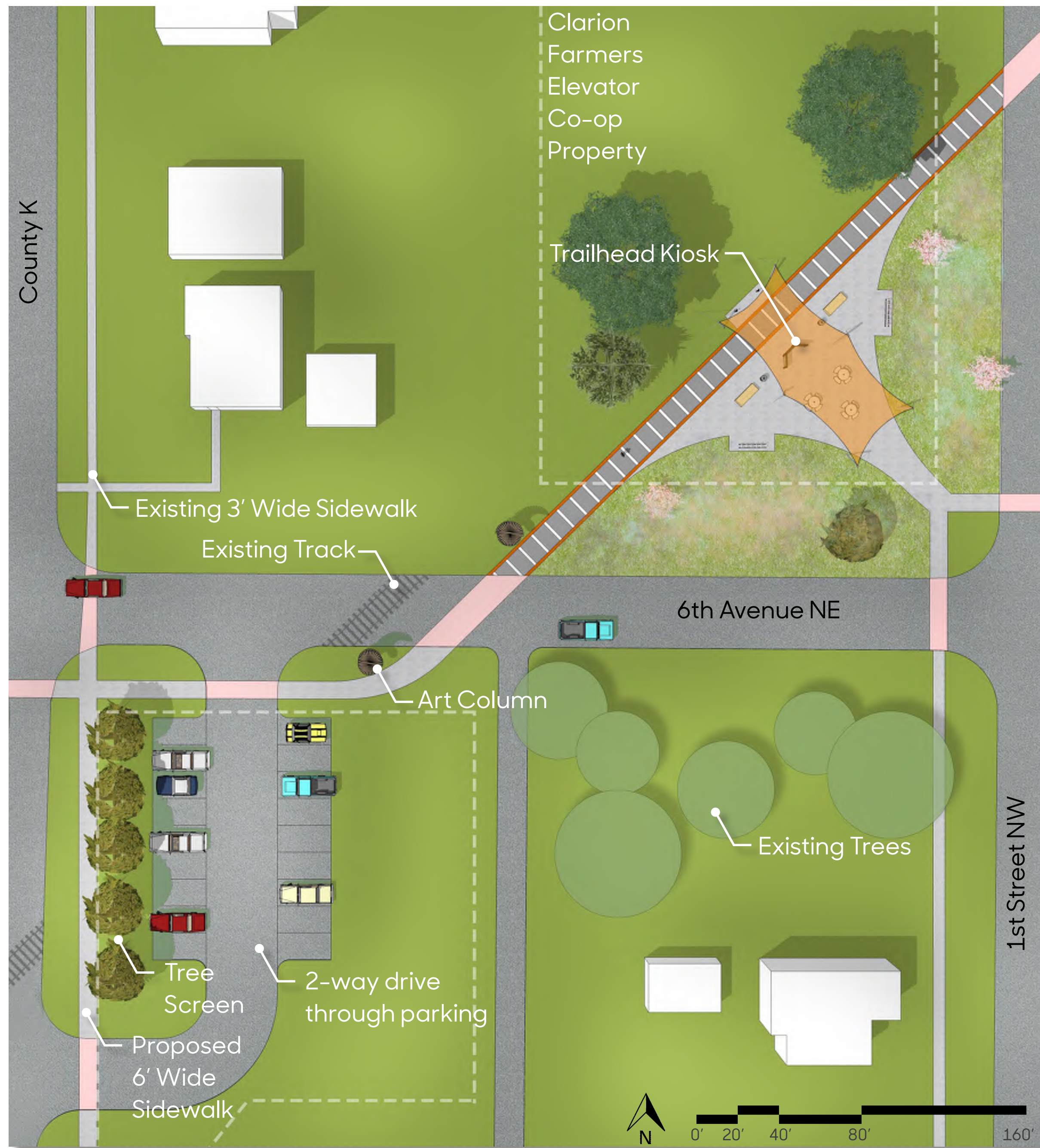
Trailhead detail plan.