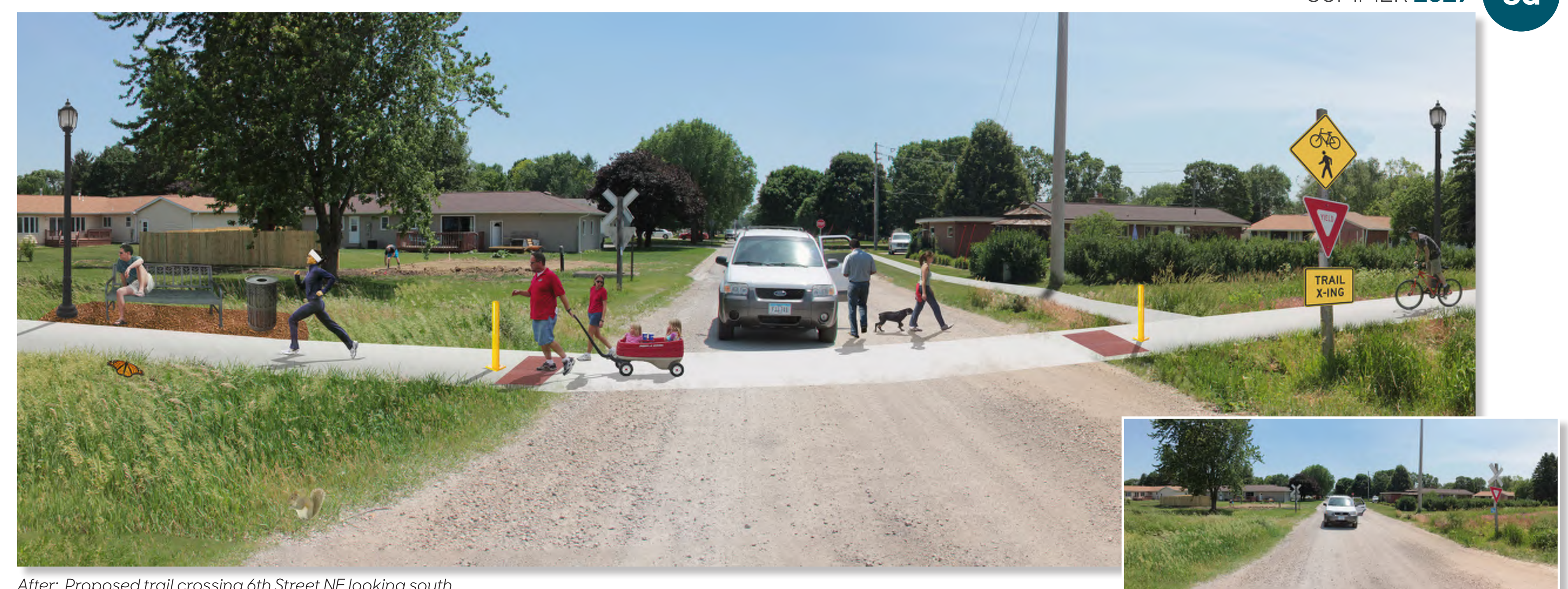
After: Proposed trail crossing 6th Street NE looking south.