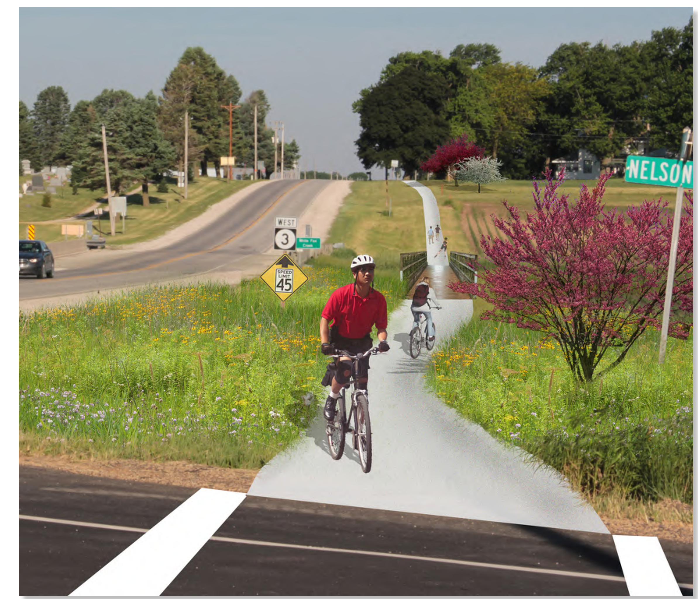
After: Proposed trail and bridge across White Fox Creek north of Highway 3 looking west.