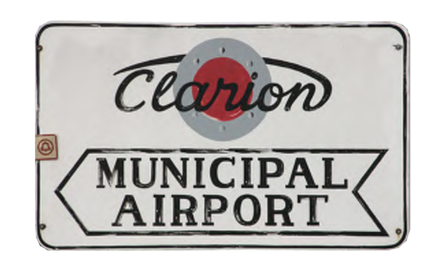
Existing Clarion airport sign.

Clarion has many existing signs with their logo throughout the community. A major priority for the community is to define their identity. Clarion defines their identity with consistent use of a family of site furniture and visually cohesive signage. On this page are several options for alternative branding and the various applications for their use.