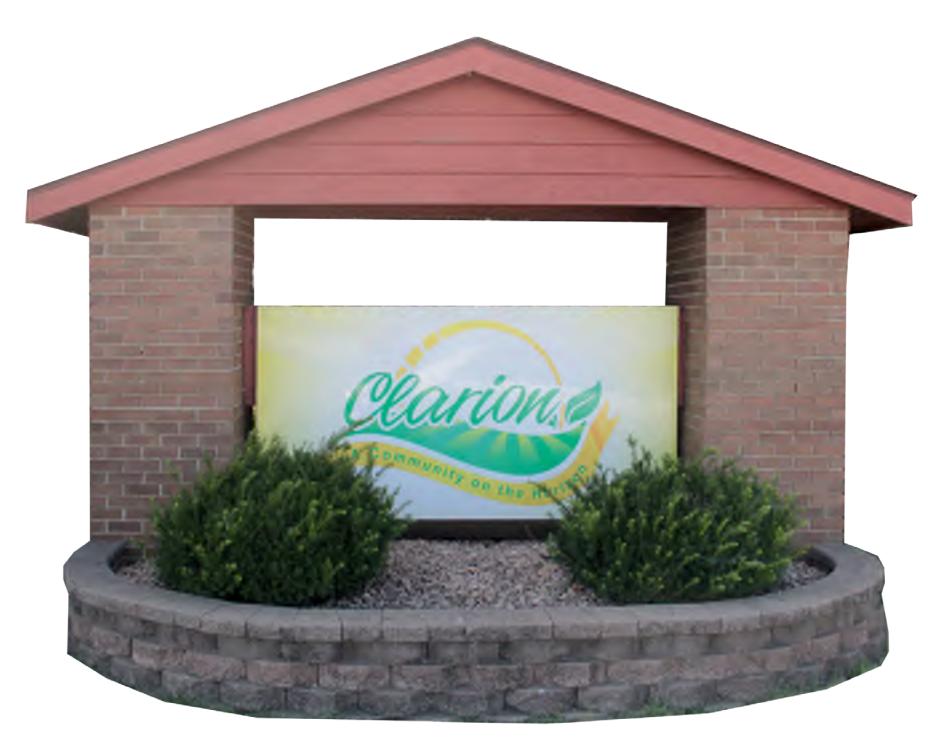
Existing Clarion entry sign.