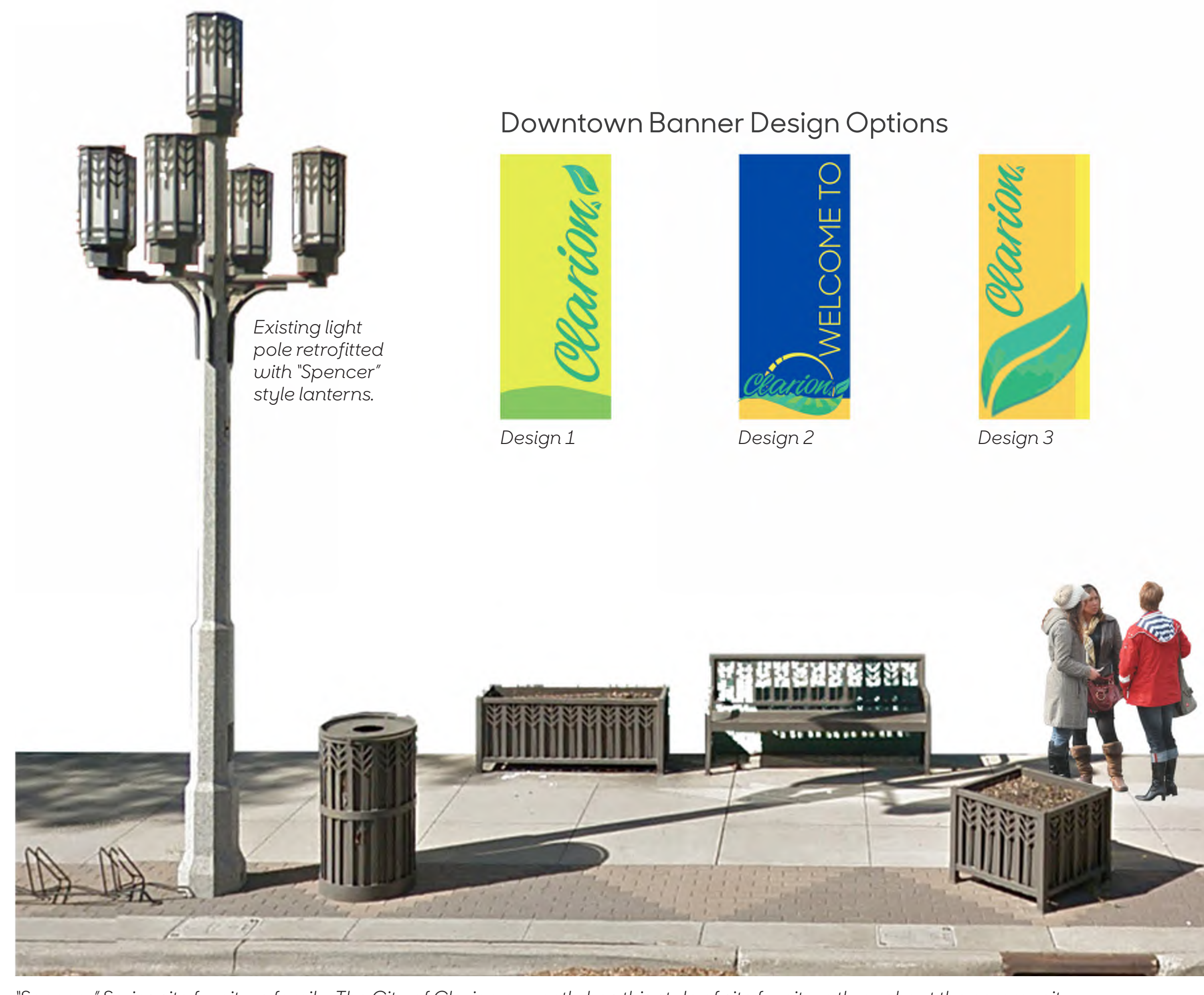
"Spencer" Series site furniture family. The City of Clarion currently has this style of site furniture throughout the community.