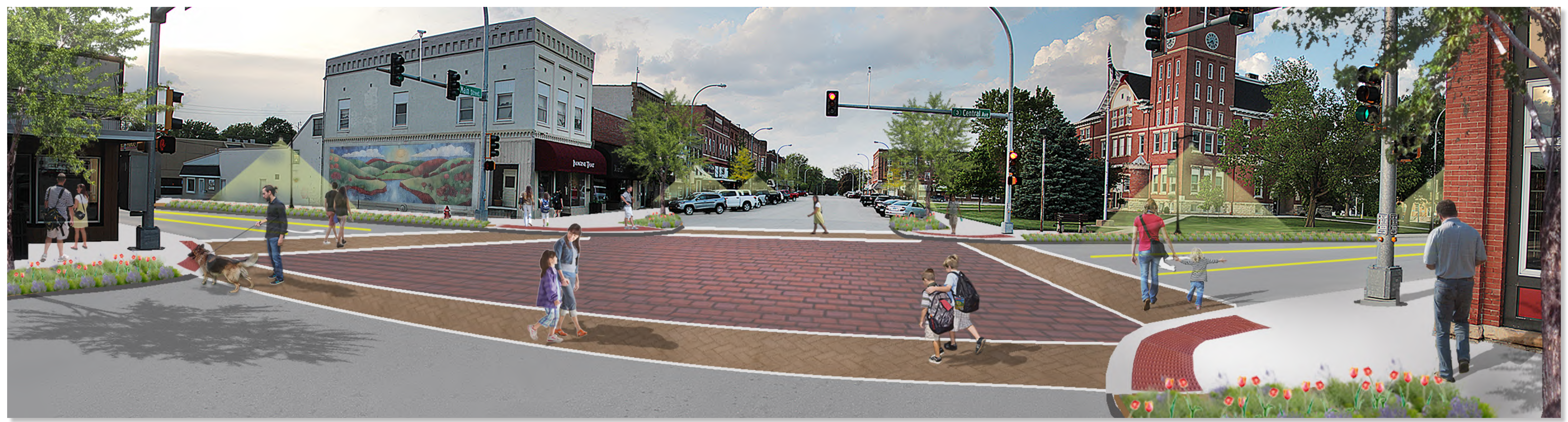
Proposed intersection with desired improvements.