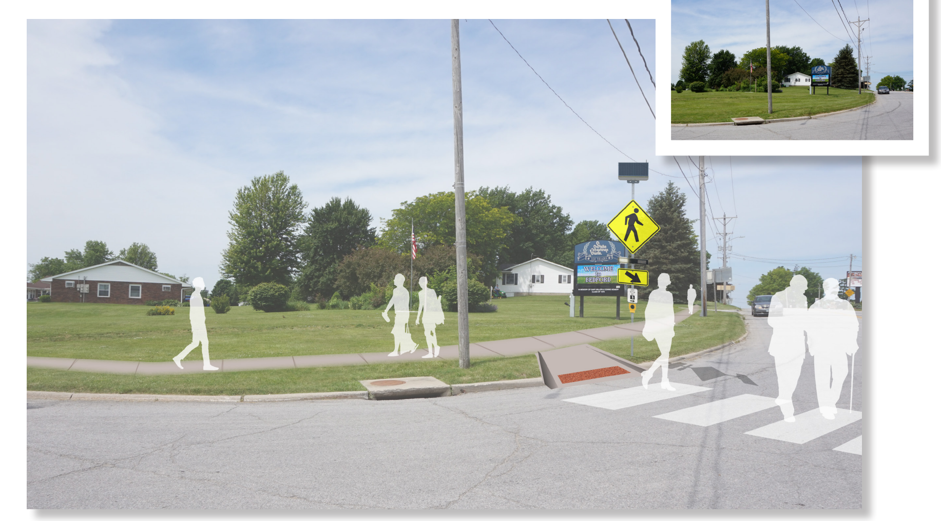
Improved connection to highway and Hy-Vee from Madison St.