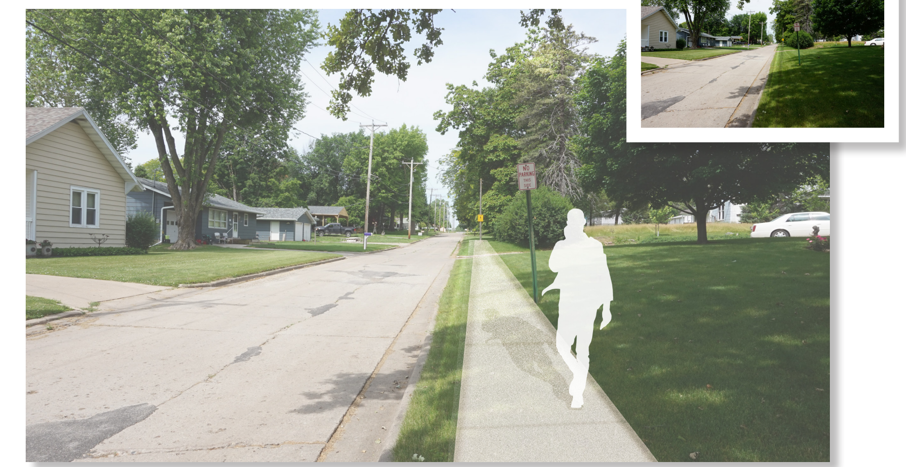
Continuous sidewalk on Grant St. to Bibbins Park