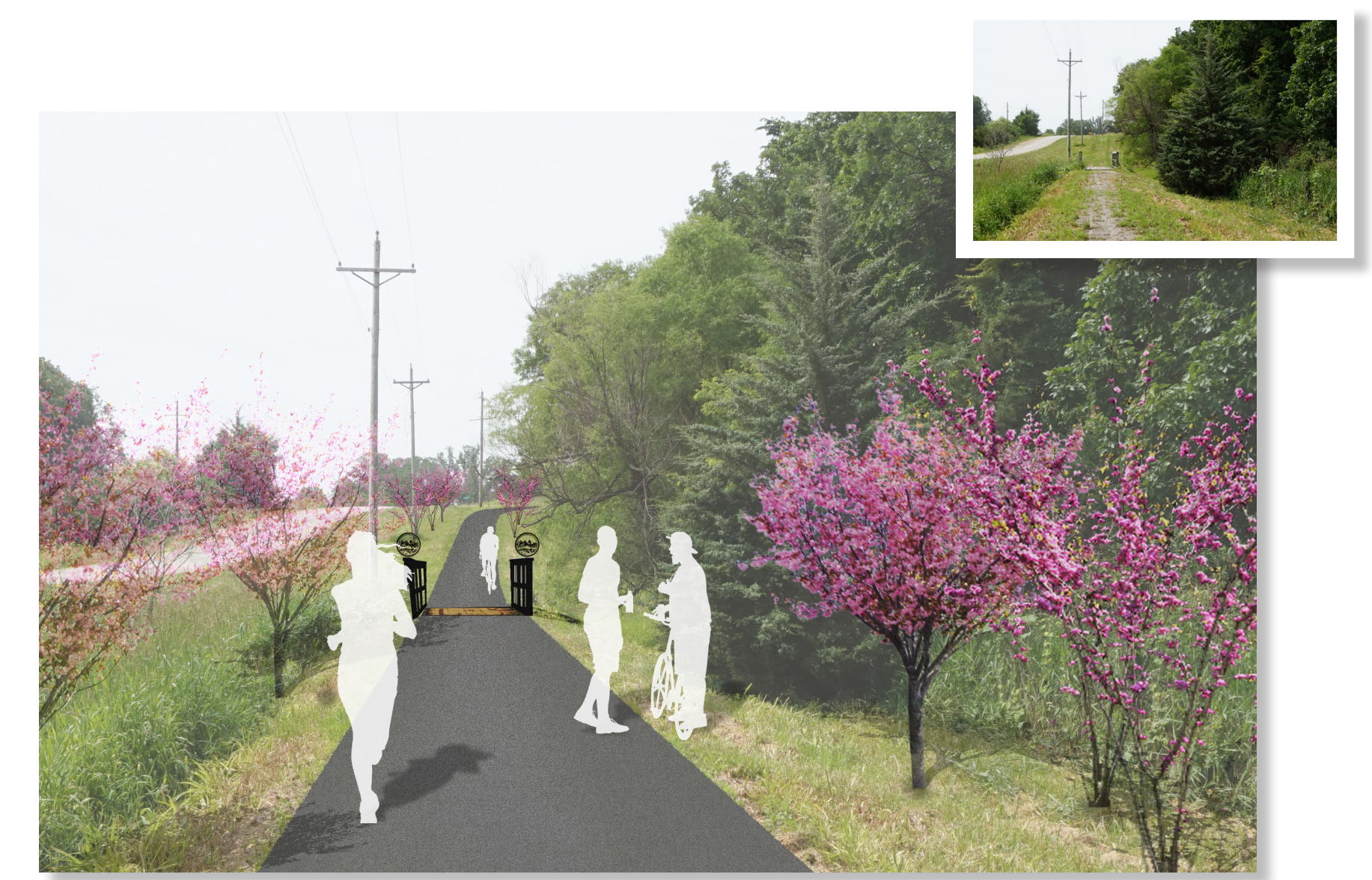
Trail and bridge improvements