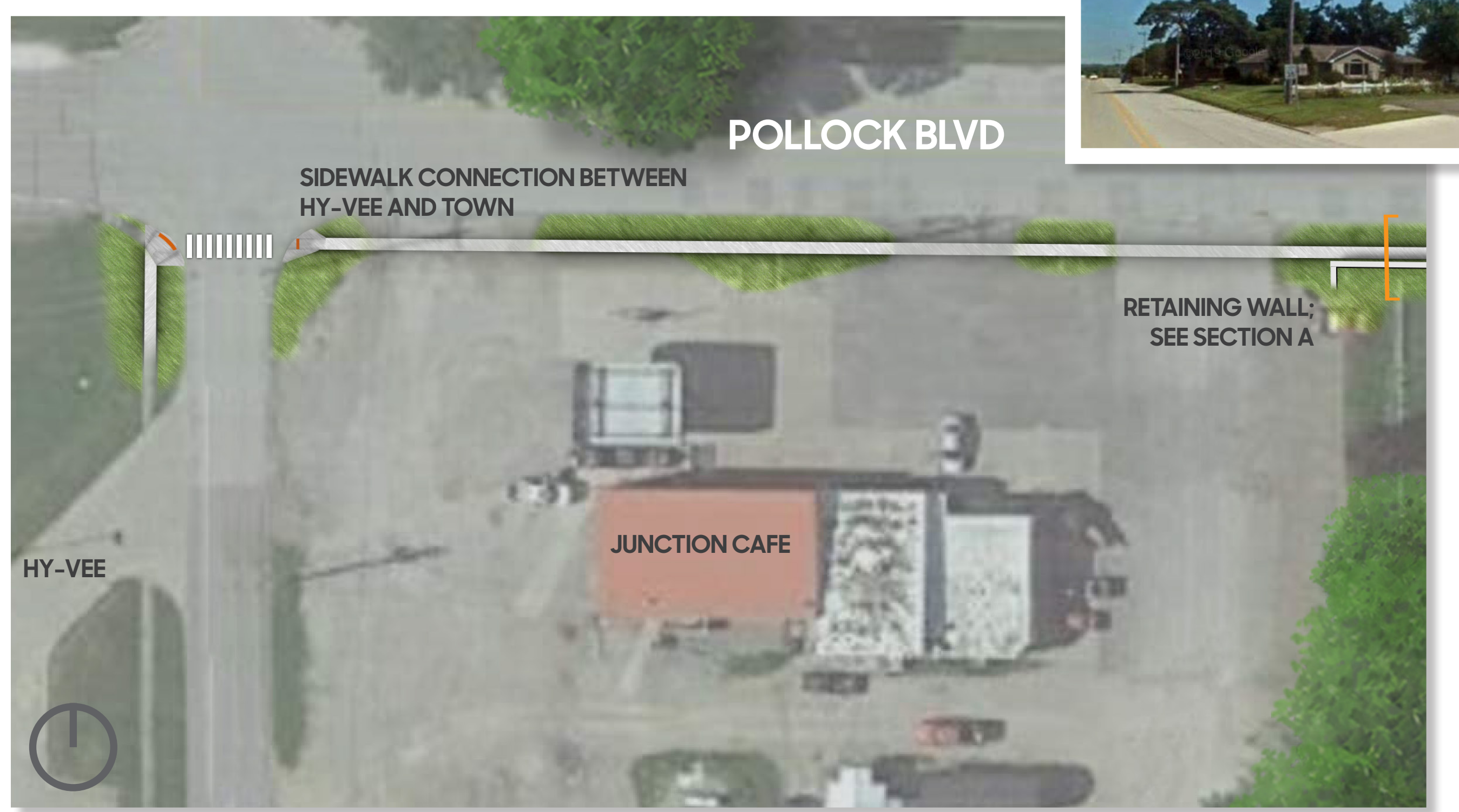
Highway 2 connection to Hy-Vee