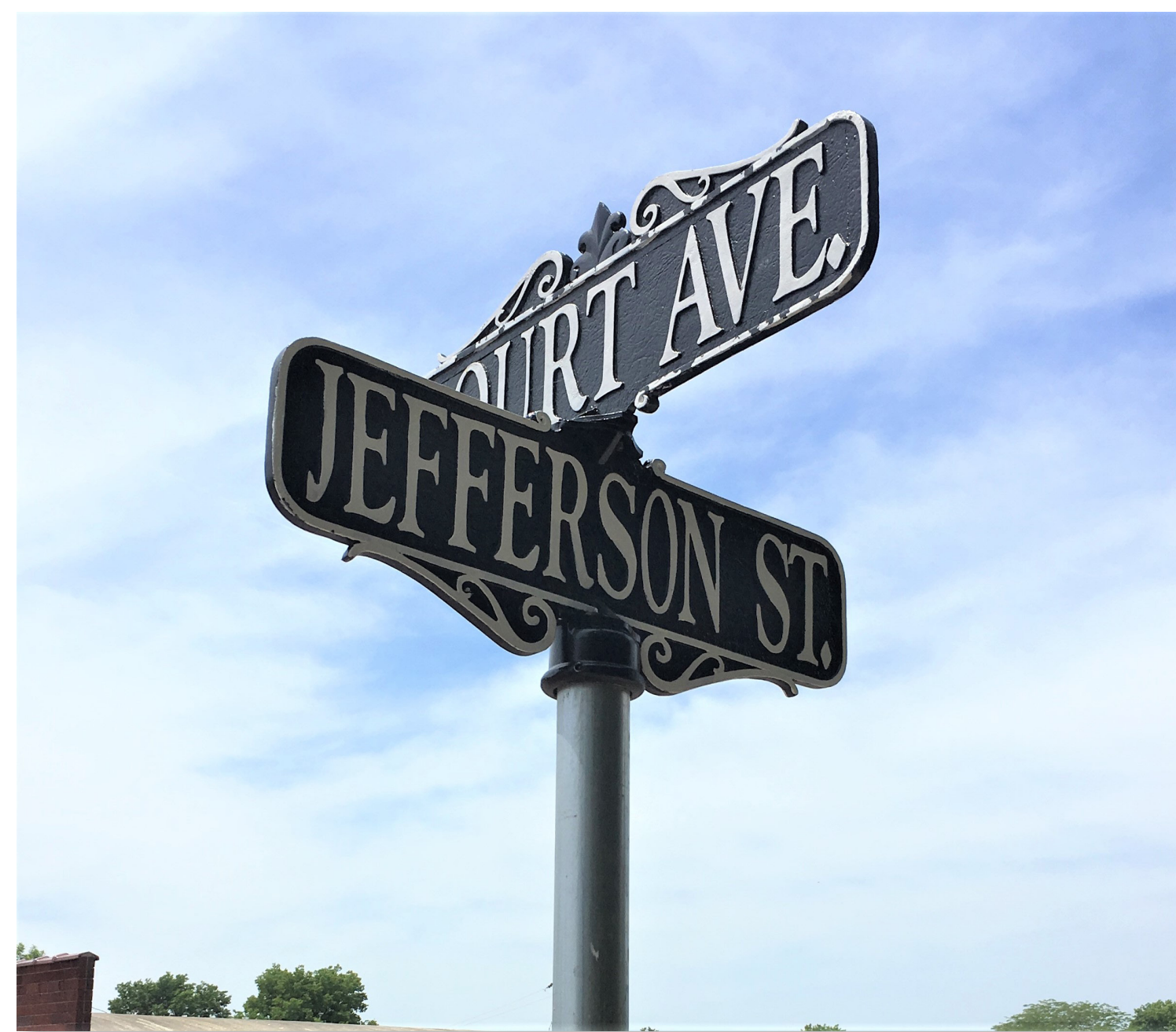
Existing street signs – inspiration for proposed signage