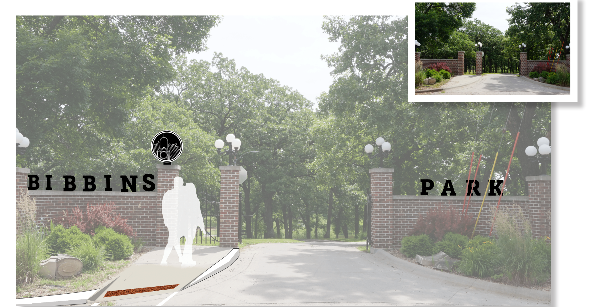
Bibbins Park Grant St. entrance