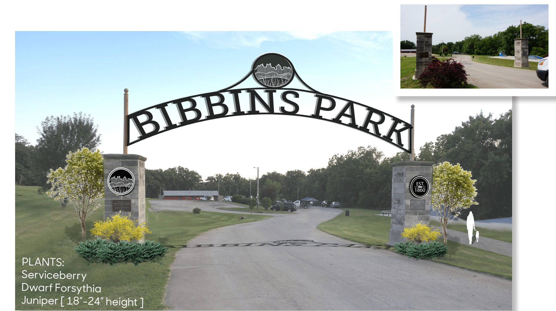
Bibbins Park highway entrance