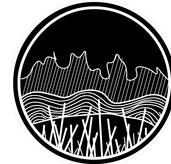
Sign panel options