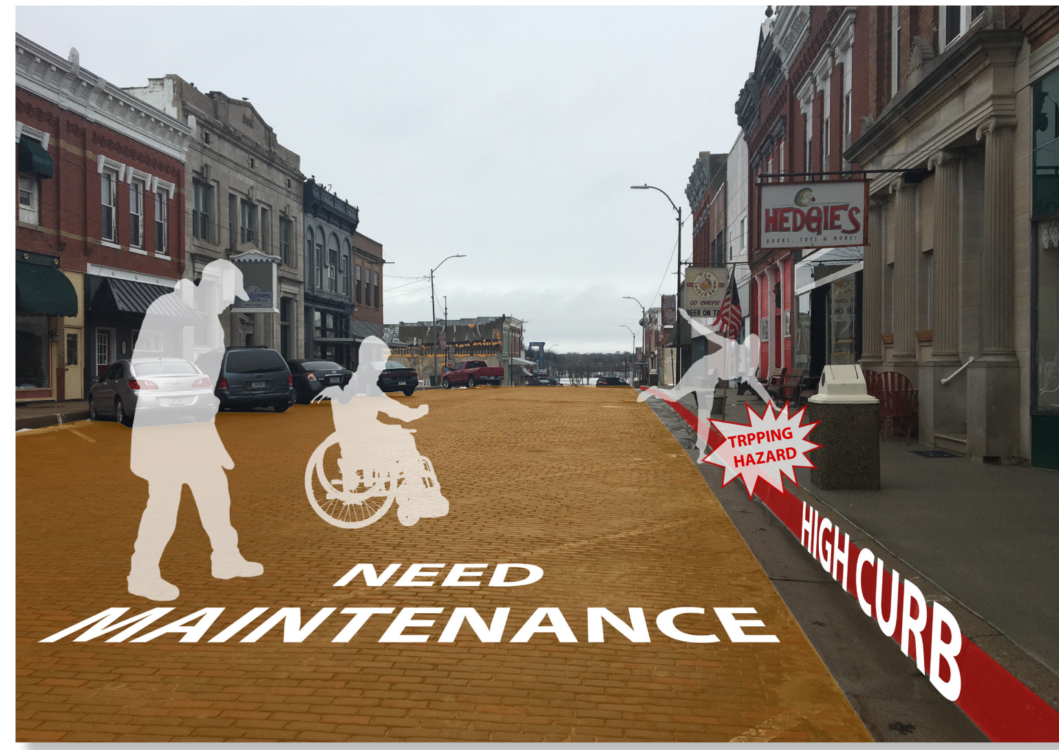
The high curbs on Main Street cause accessibility issues for multiple user groups.