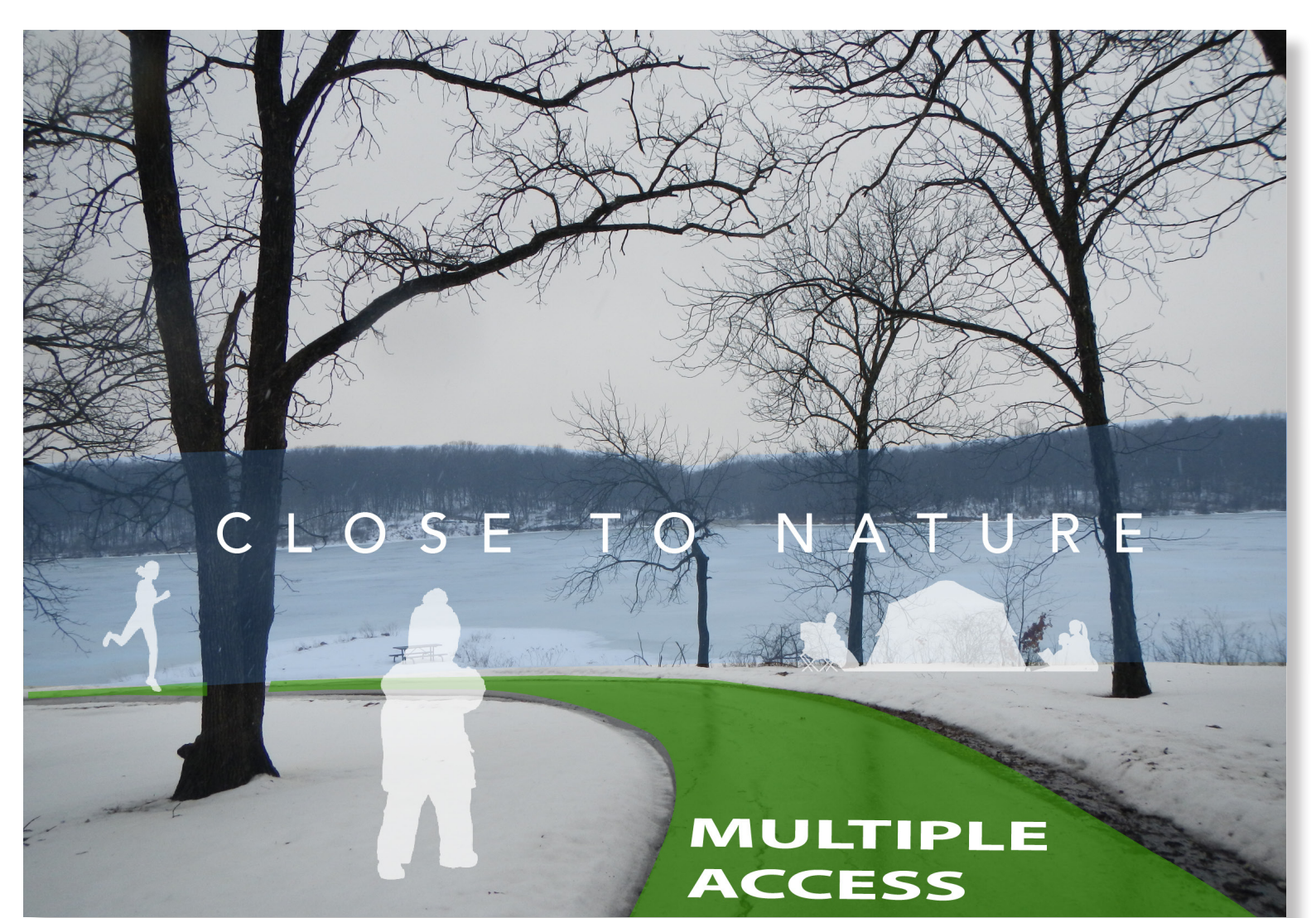
Lake of Three Fires is a great place to explore nature and is accessible by many paths.