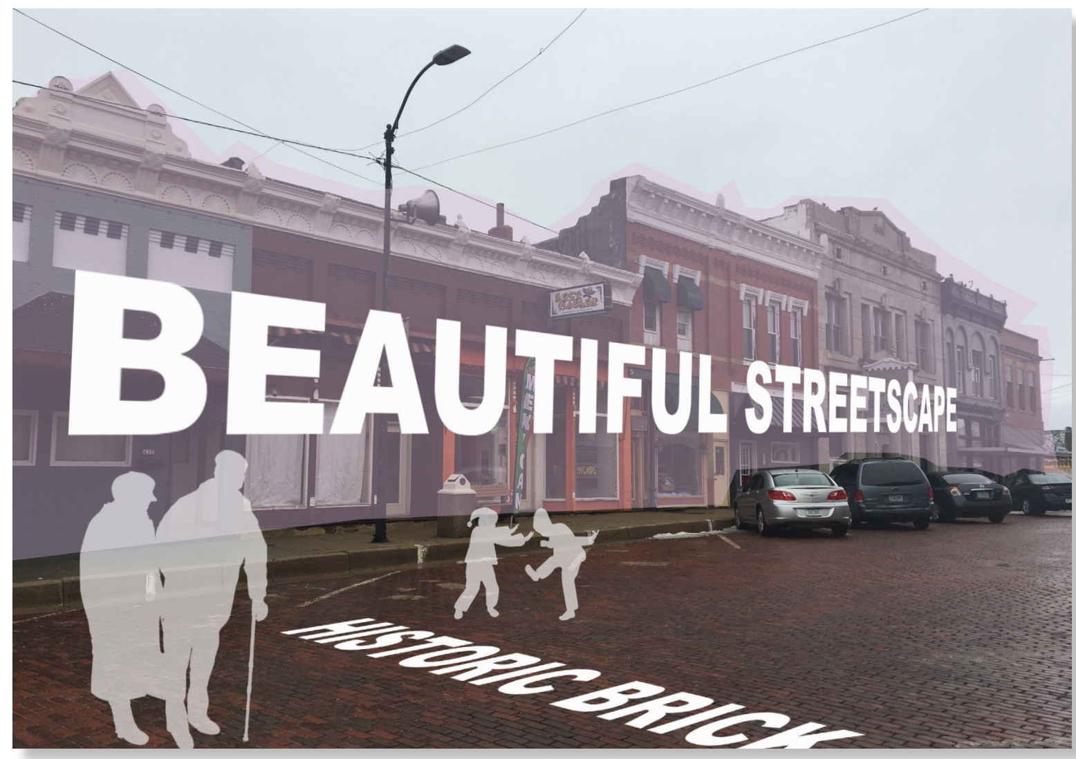
The brick streets in town have historic value and make for beautiful streetscapes as long as they are well maintained.