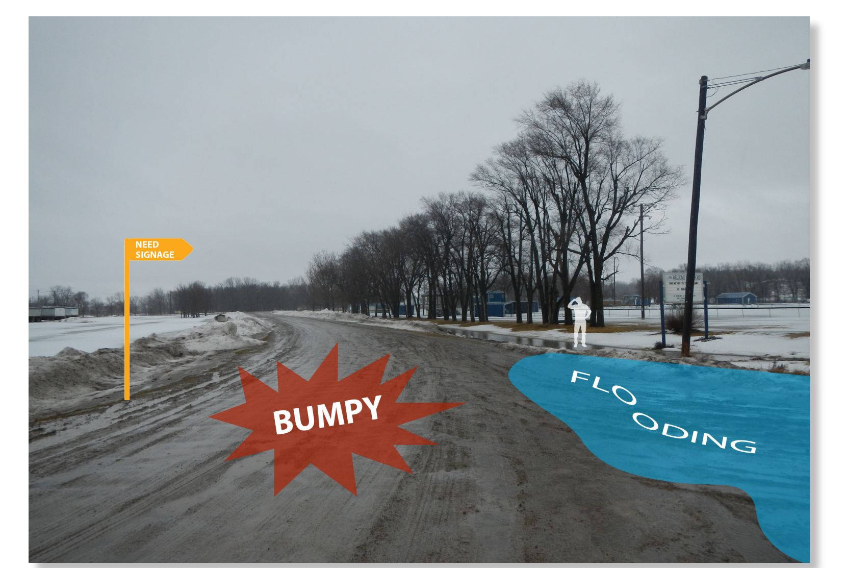
The roads around the baseball field are in poor condition, and often flood.