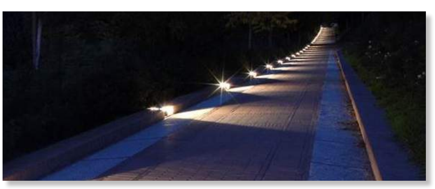
Trail pathway lights example