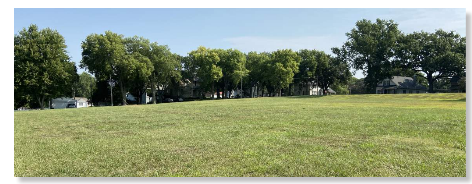
Existing view looking northeast

The play area will include an accessible playground and adult fitness equipment to encourage full utilization of the park. One feature of this park includes a "food forest"—an orchard of fruit–bearing trees that citizens can harvest and enjoy—as well as native planting areas with grasses and wildflowers that will slow stormwater runoff and attract both pollinators and wildlife to the heart of Avoca. This area has the potential to impact much of the community with its close proximity to downtown, which is within a five–minute walking radius of the site.