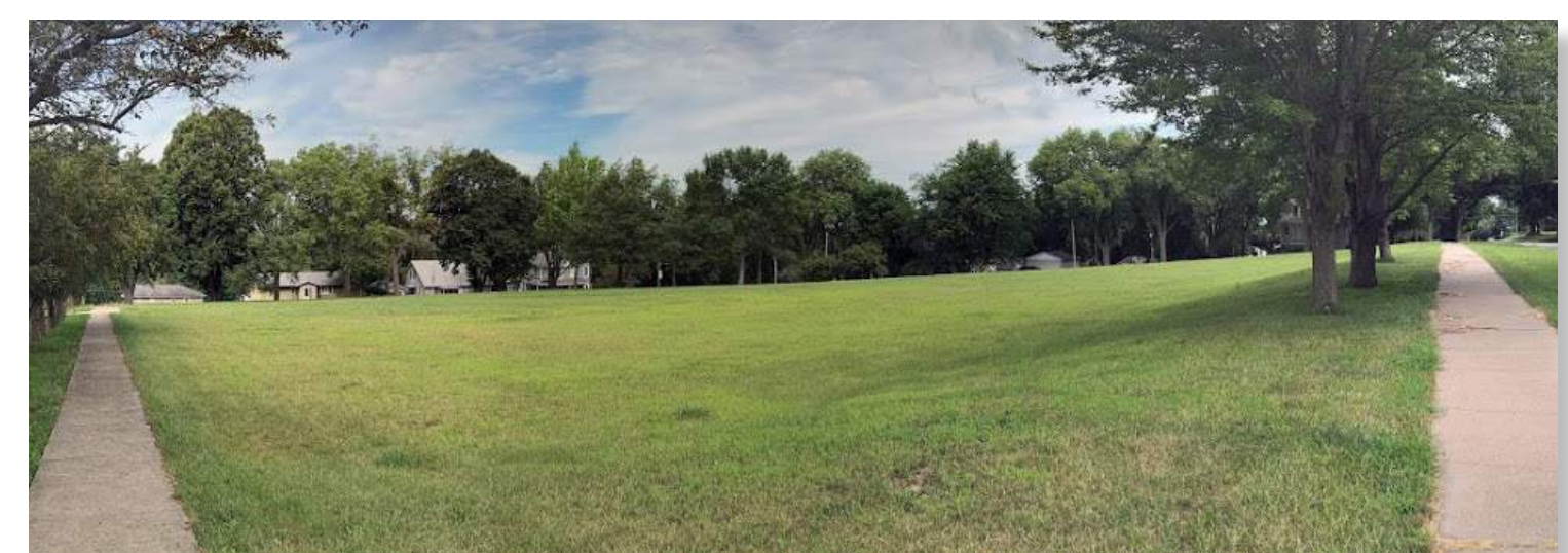
Existing view looking northwest from Chestnut and Taylor Streets