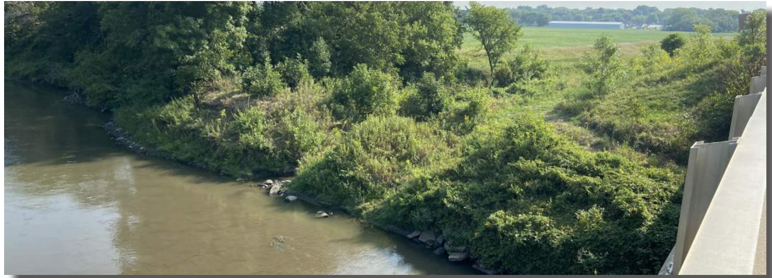
Existing view looking east from the G18 bridge

Solidifying this informal water access into an accessible amenity will help Avoca capitalize on its connection to the river. An additional launch point will encourage more residents to enjoy the natural landscape and give them the opportunity to support a healthier lifestyle. A greater focus on recreation along the Nishnabotna can create a draw for visitors and emphasize the identity of Avoca as hub for water access.