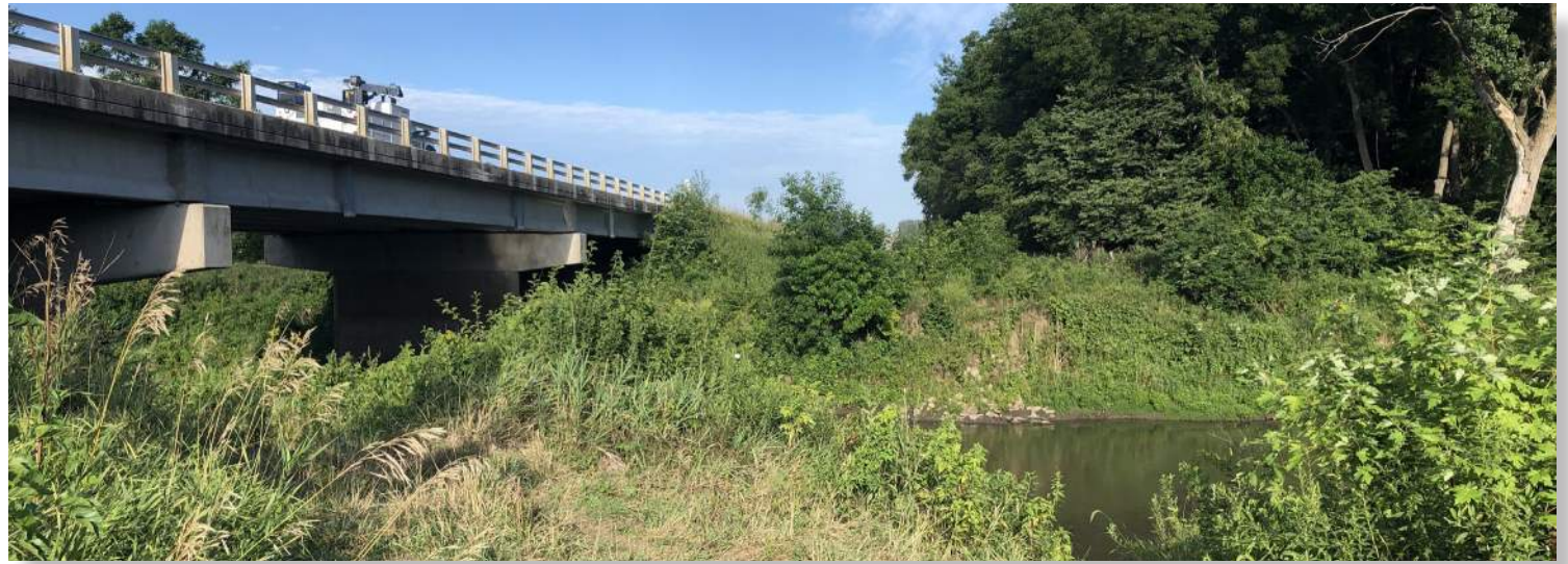
Existing view looking west from the northeast access path