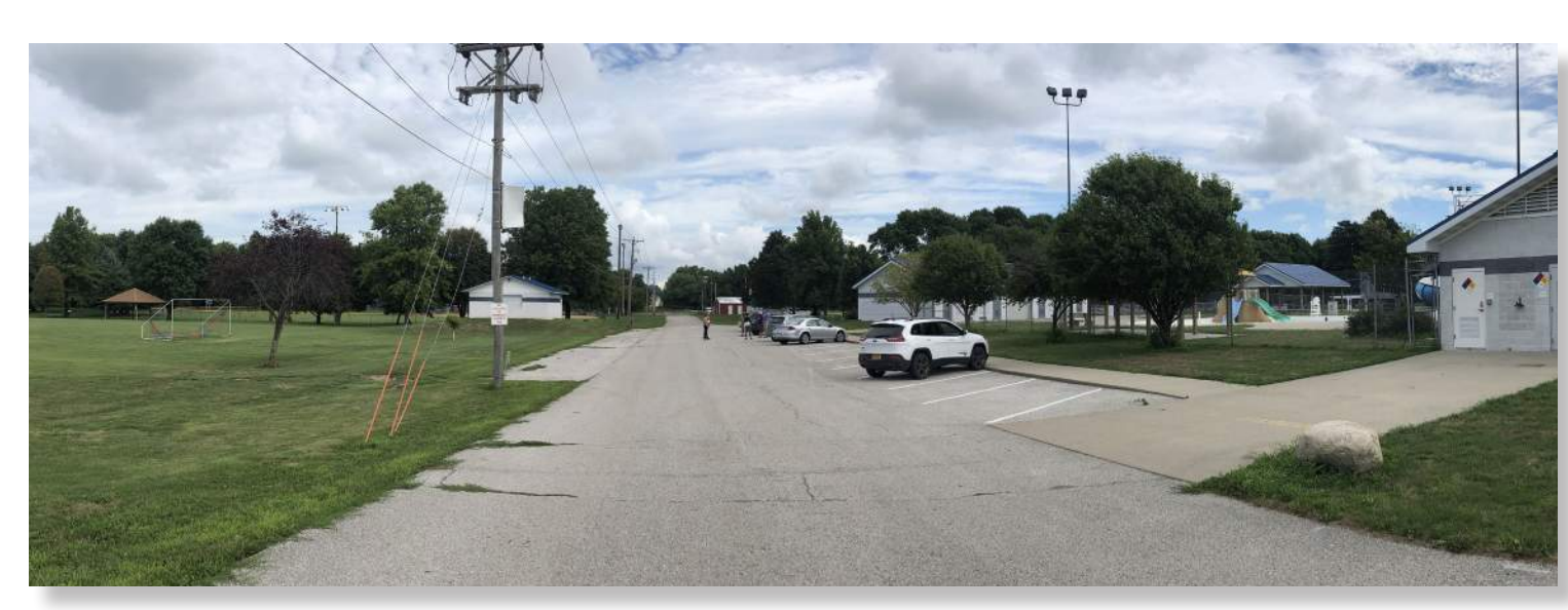
Existing view looking north from park entry drive