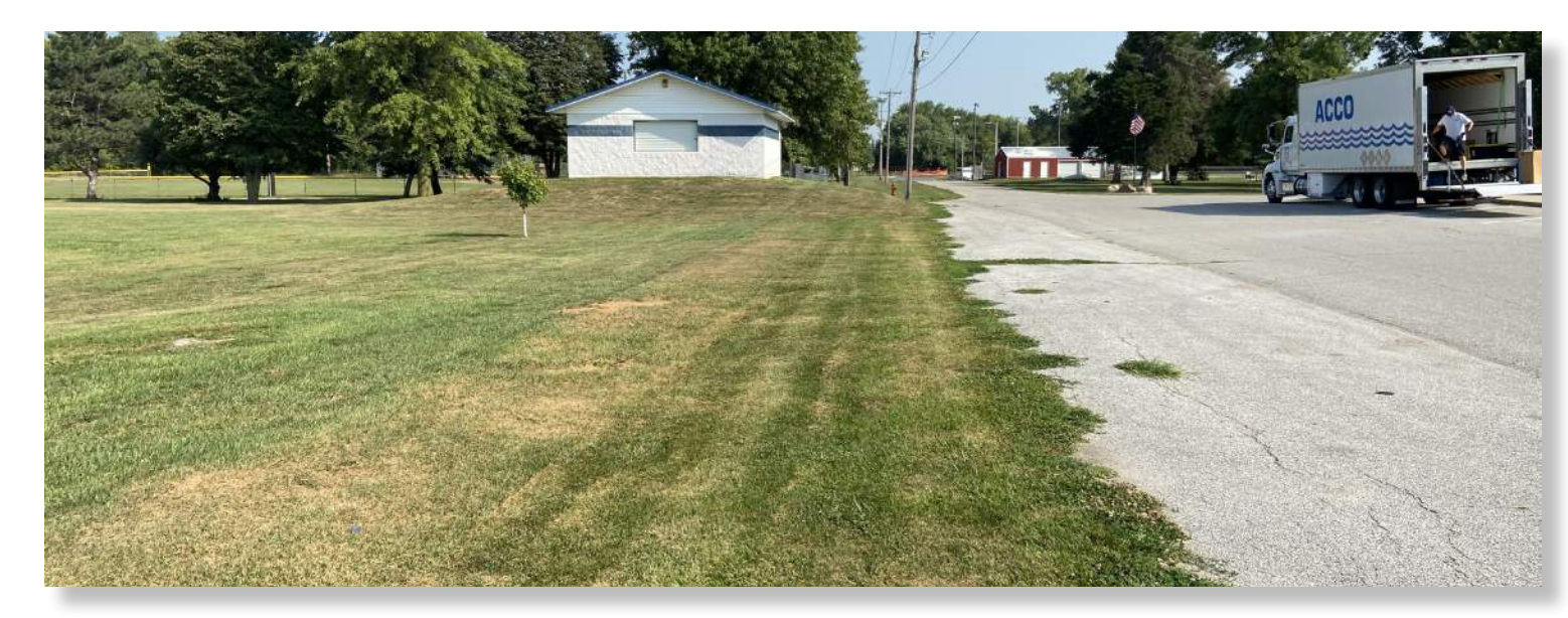
Existing view looking north towards concessions stand

With a grade-separated trail extending into the park, vehicle and pedestrian traffic have clear zones of use, improving both safety and comfort at the park entrance. The incorporation of shade trees and lighting increase pedestrian comfort throughout the day on the trail and the adjacent soccer field, and also serve as a traffic-calming device for vehicles entering the park.