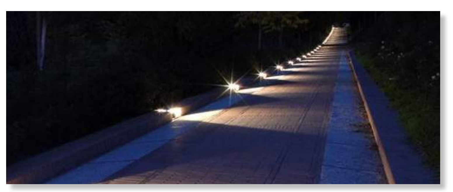
Trail pathway lights example