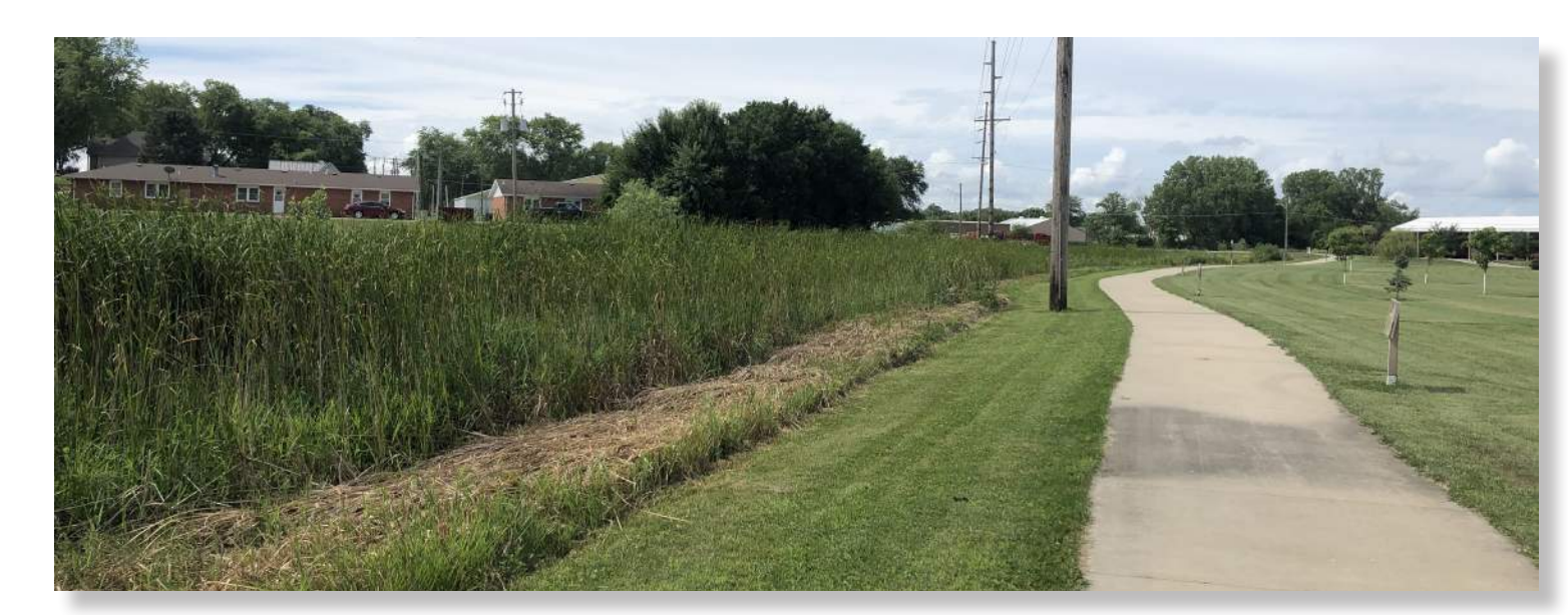
Existing view looking south \from trail at stormwater swale

The addition of shade trees and solar lighting along the length of Mez Buttermilk Flat Park's trail will make the park more hospitable, increasing shade during sunny days and extending the use of the trail into the twilight and evening hours. These improvements could spur more use of the park and encourage active lifestyles in the surrounding neighborhood and throughout the community of Avoca.