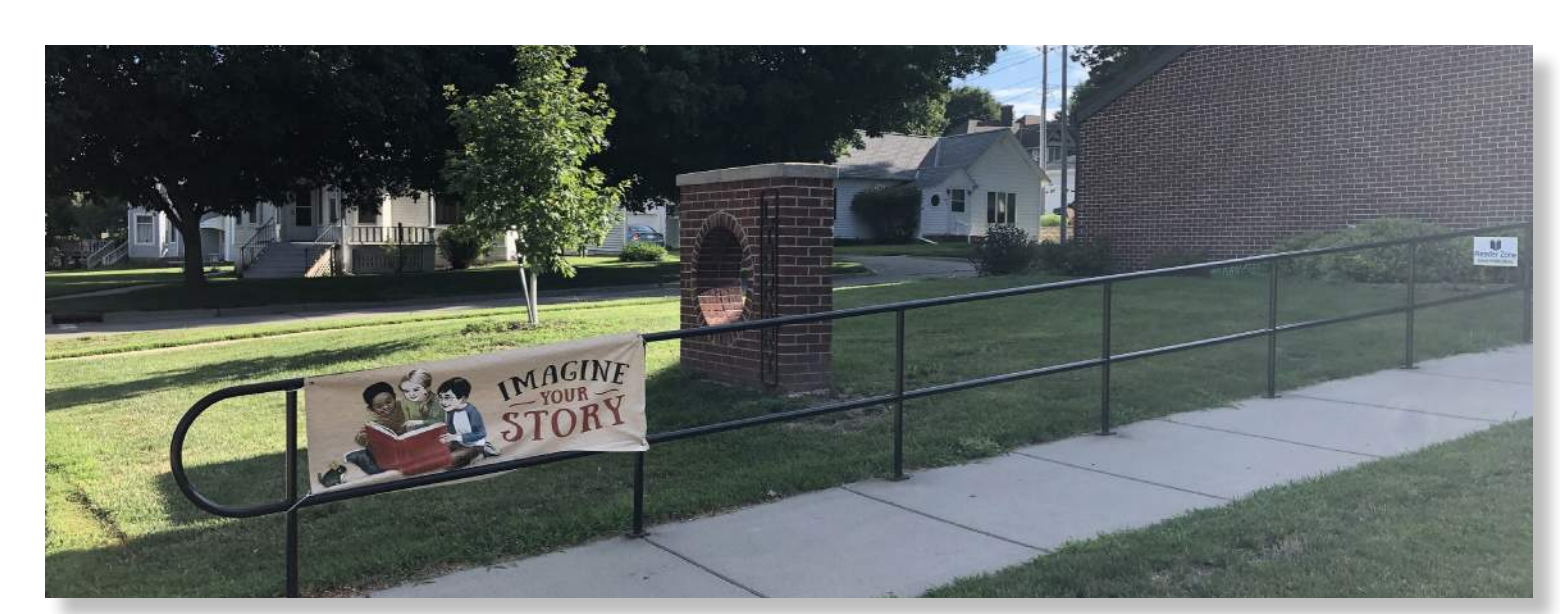
Existing view of the north lawn of the library

The existing masonry sign in front of the library can be integrated into the design and become an interactive element. Plantings along the west side of the seating wall can create a beautiful backdrop for photos taken by parents as they following the winding flagstone path through the sign. A shade structure can be implemented into the seating area to promote its usage during hot, sunny periods of the day. Creating an active and engaging space for children can encourage more traffic during the farmers market and other town-wide events, in addition to supporting education and greater utilization of the library.