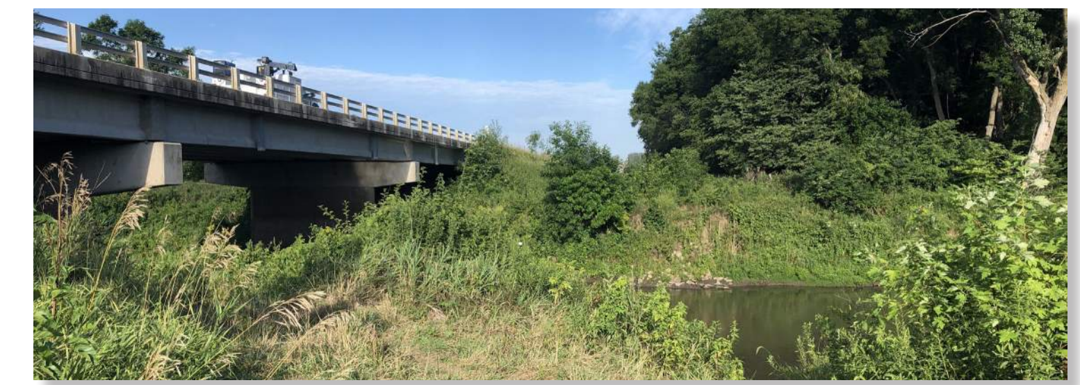
Existing view looking west from the northeast access path