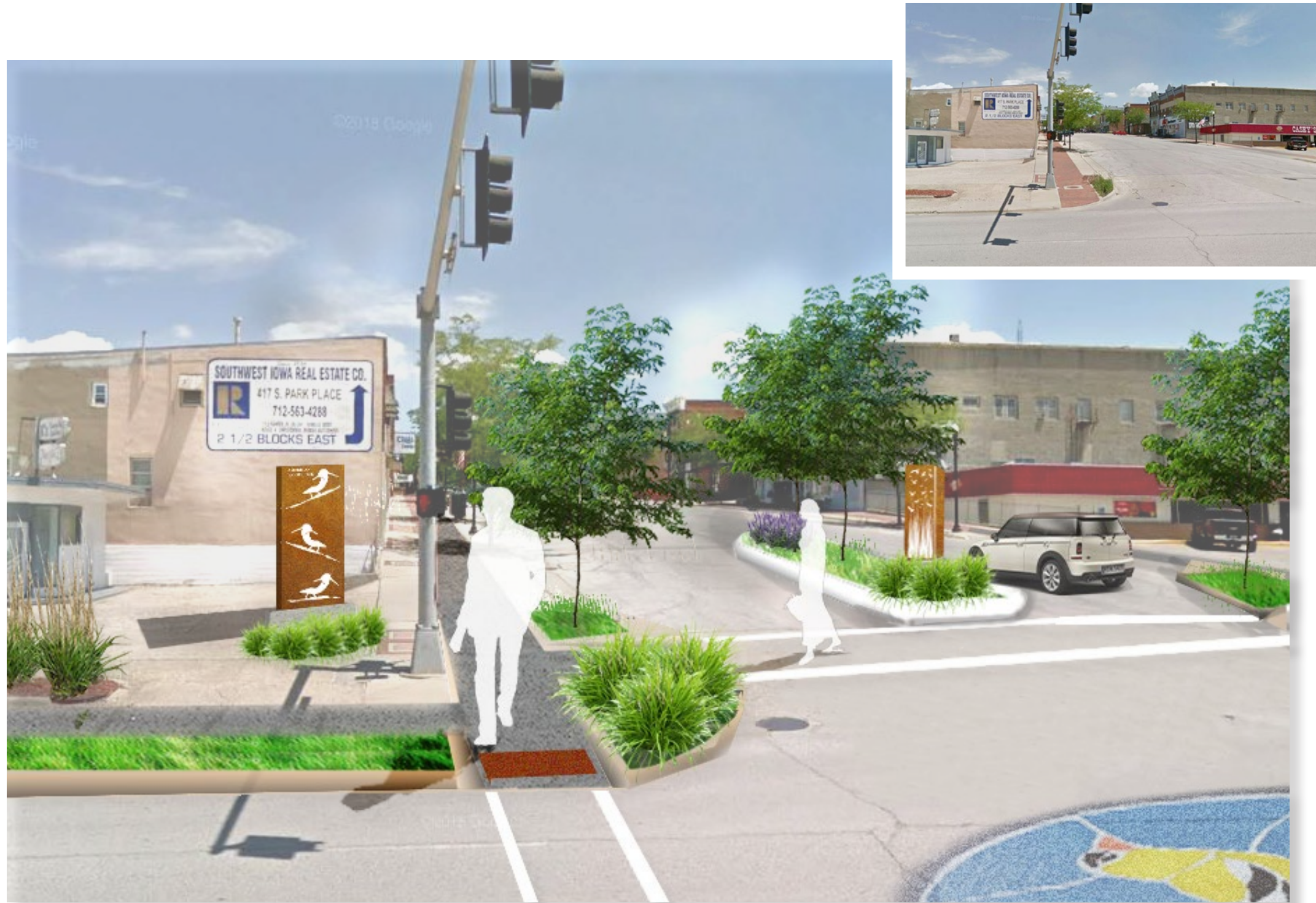
Proposed walks, monument signage, safe/accessible crossings: bumpouts + striping, plantings