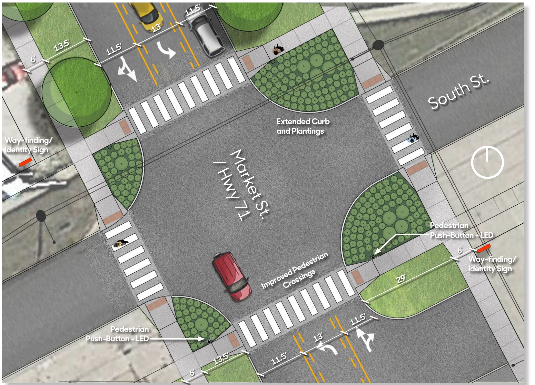
Plan Enlargement: safe crossings, enhanced landscape, 3 lane road, new sidewalks, signage