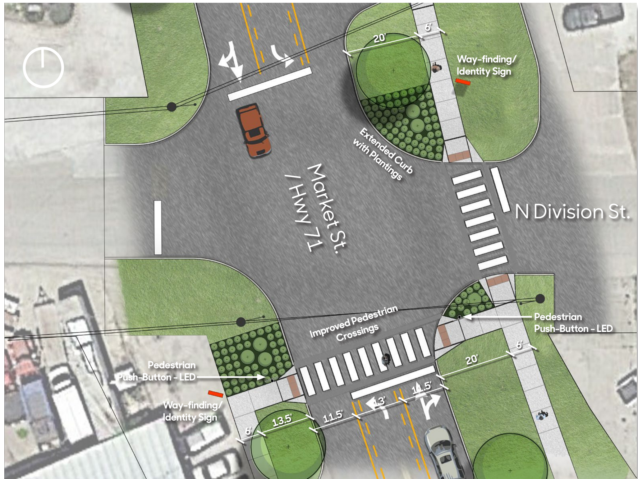
Plan Enlargement: safe crossings, enhanced landscape, 3 lane road, new sidewalks, signage