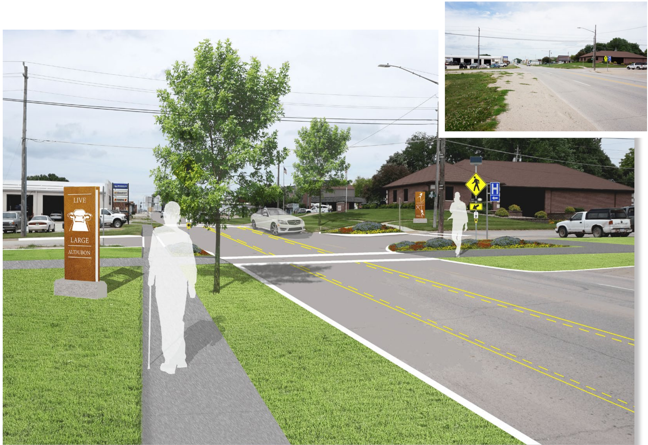
Proposed walks, signage, safe/accessible crossings: push-button LED signs and striping, plantings