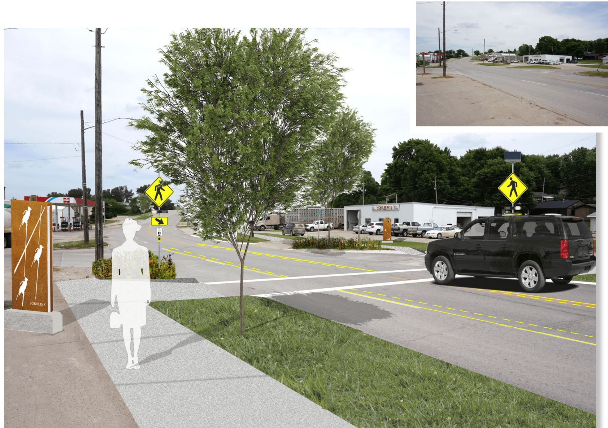
Proposed walks, signage, safe/accessible crossings: push-button LED signs + striping, plantings