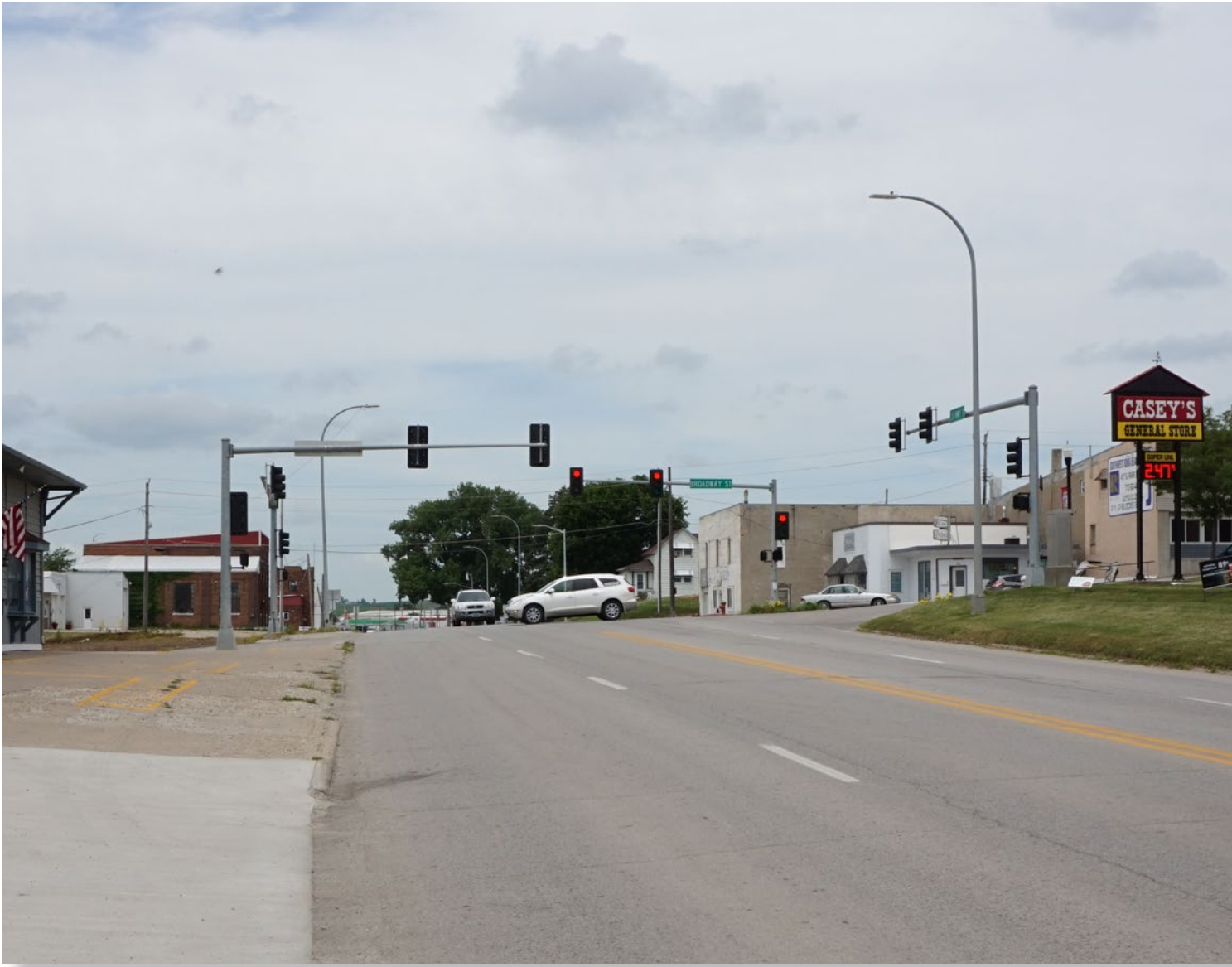
Intersection of Highway 71 and Broadway St