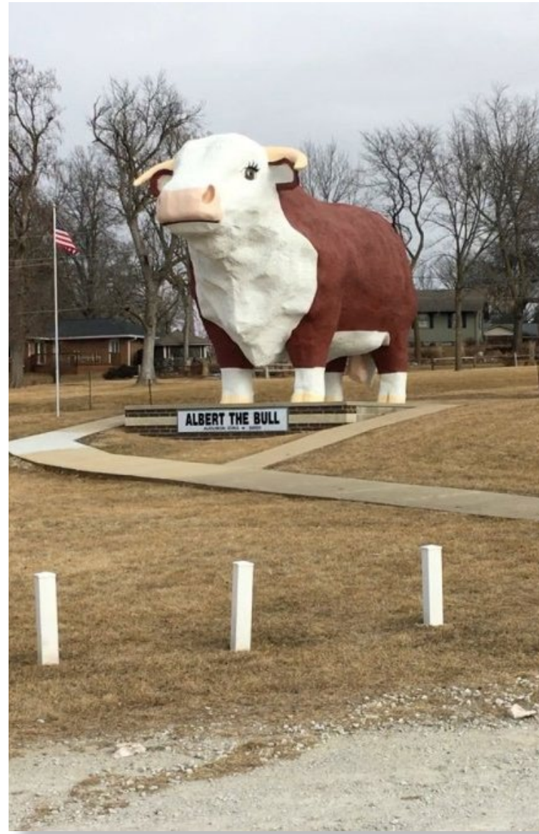
Albert the Bull Park