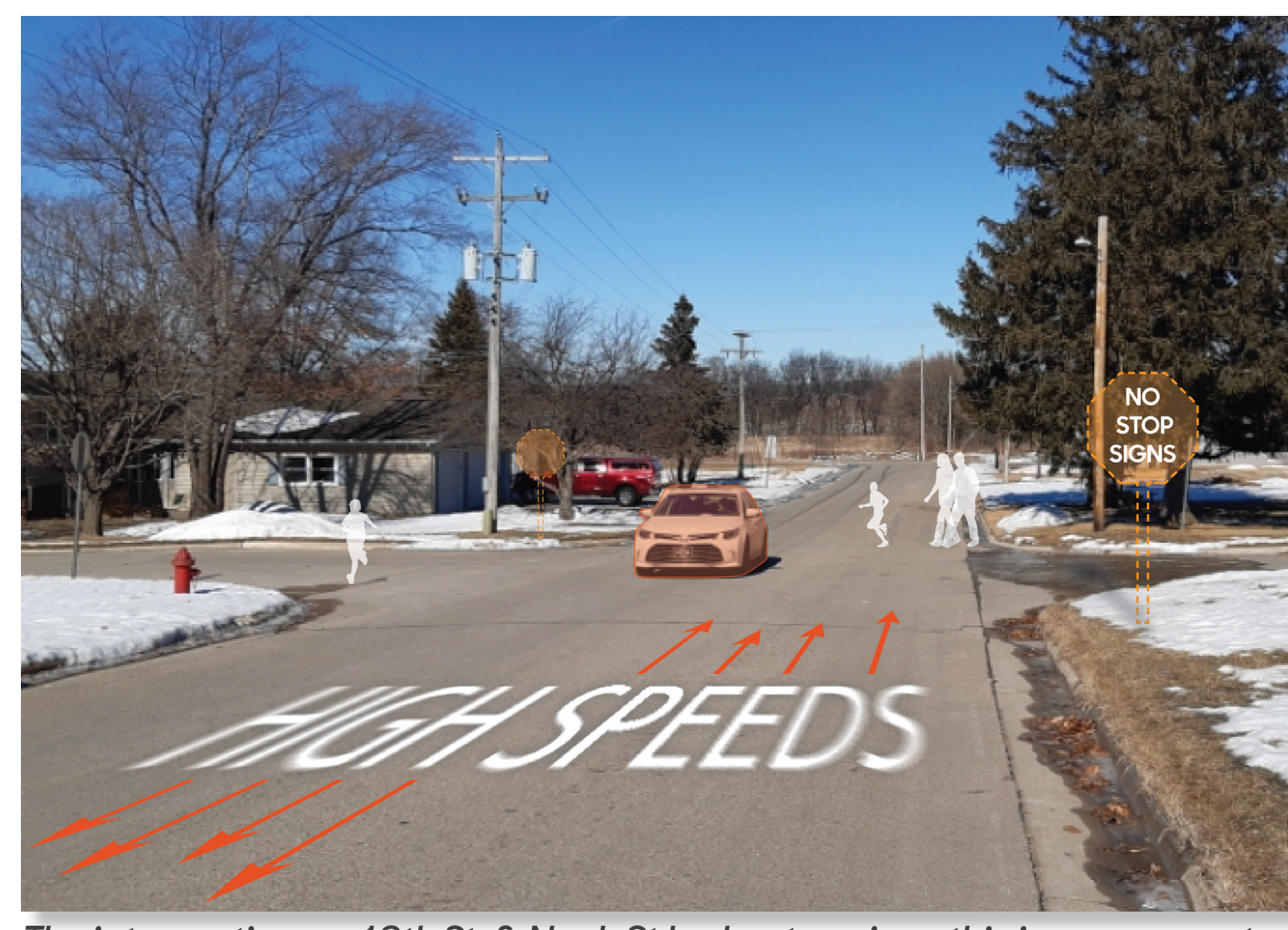
The intersection on 13th St. & Nash St lacks stop signs this improvement would alleviate the high-speed traffic on this corridor.