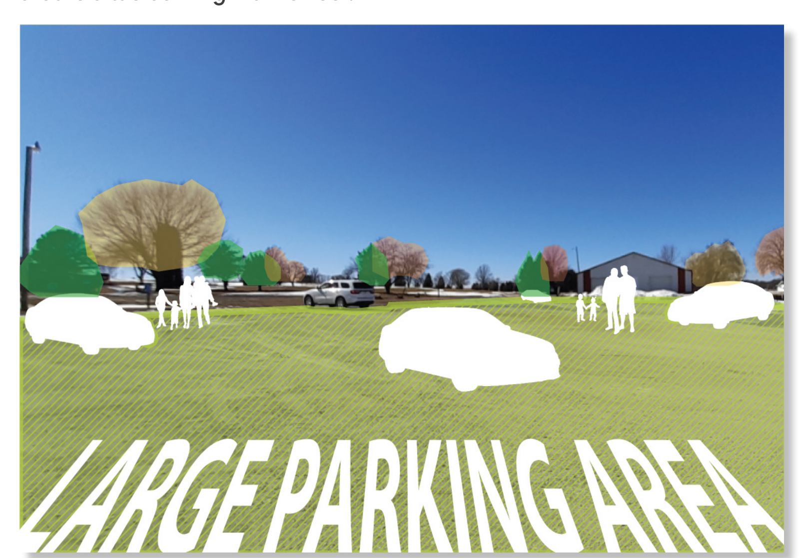
The recreation complex has convenient, ample parking.