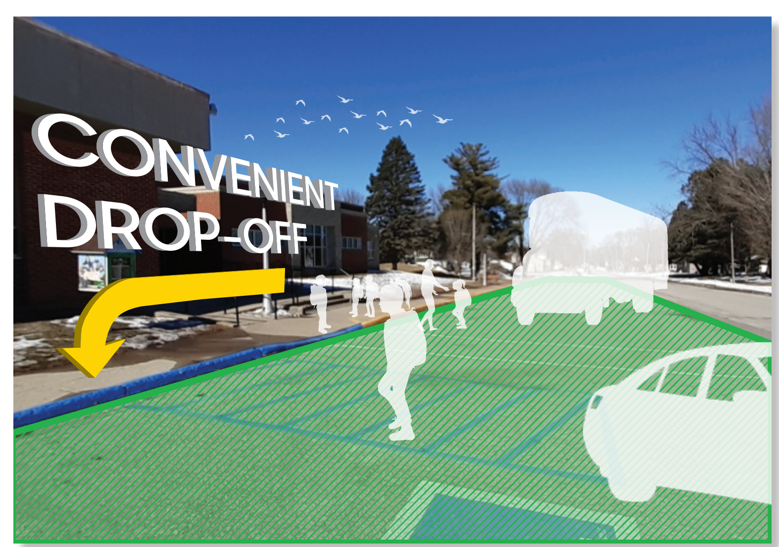
The school features a convenient drop-off zone.