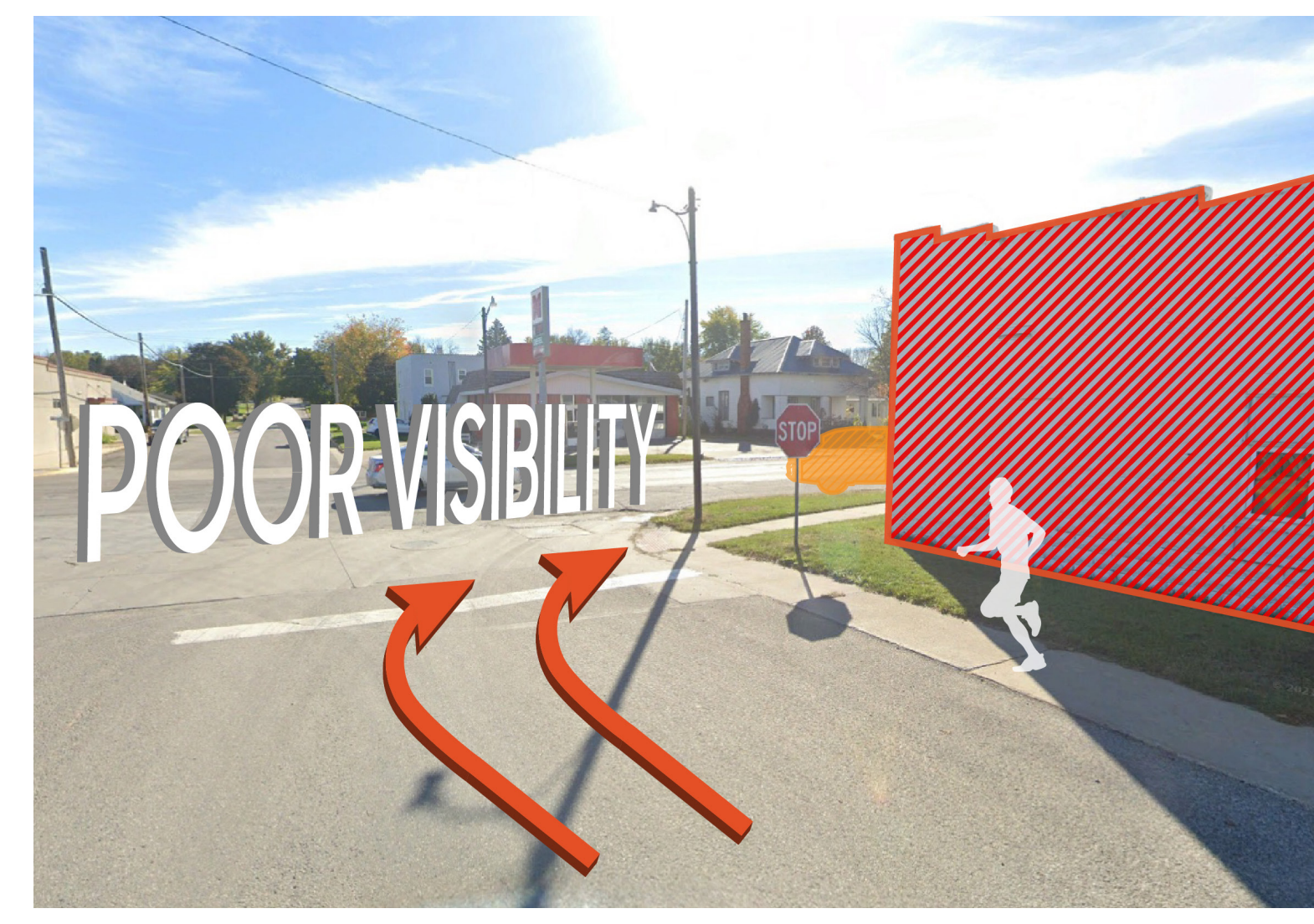
Structures and parked vehicles limit visibility on Parriott Street.