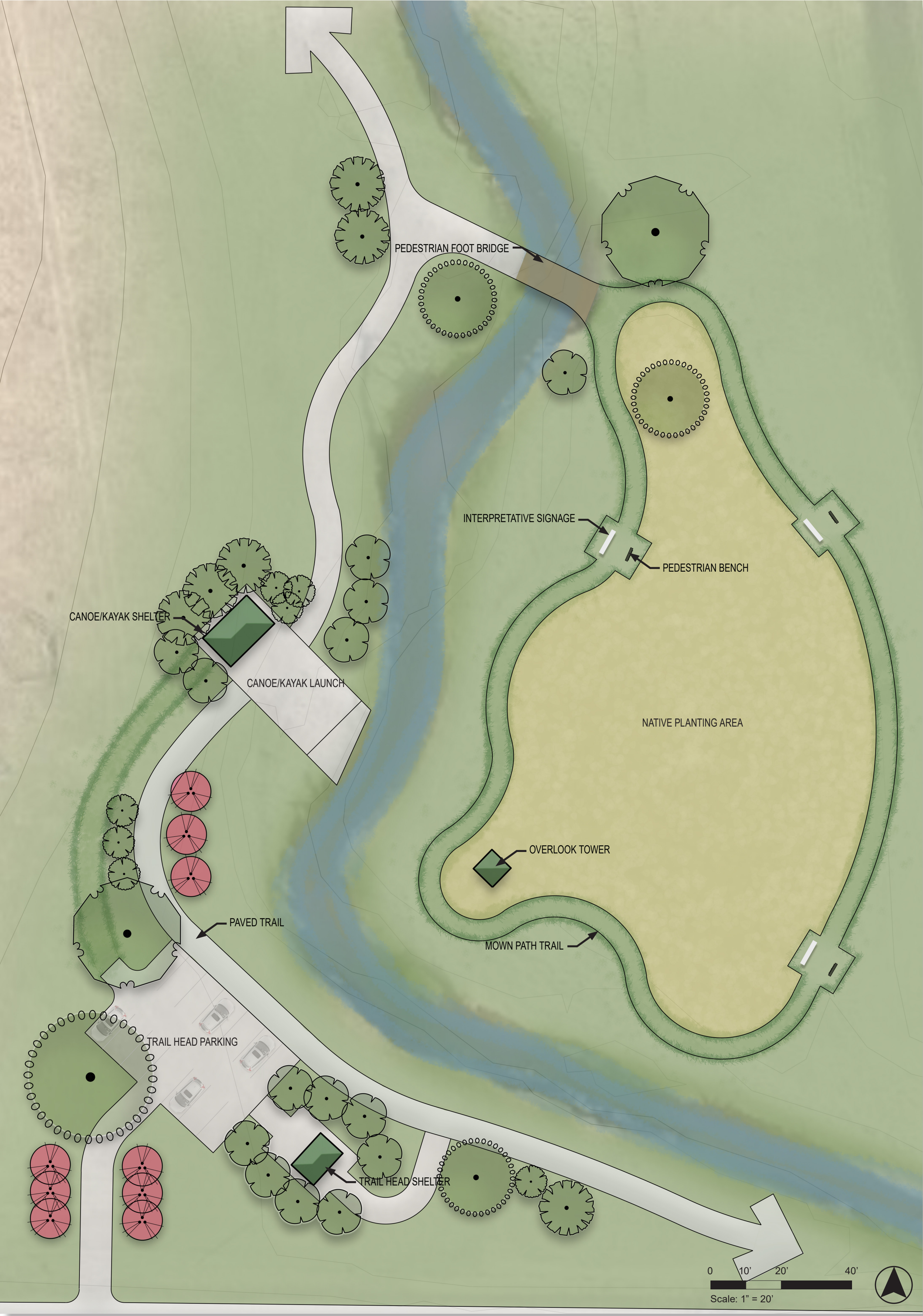
Plan depicting proposed conditions of Peacock Park.