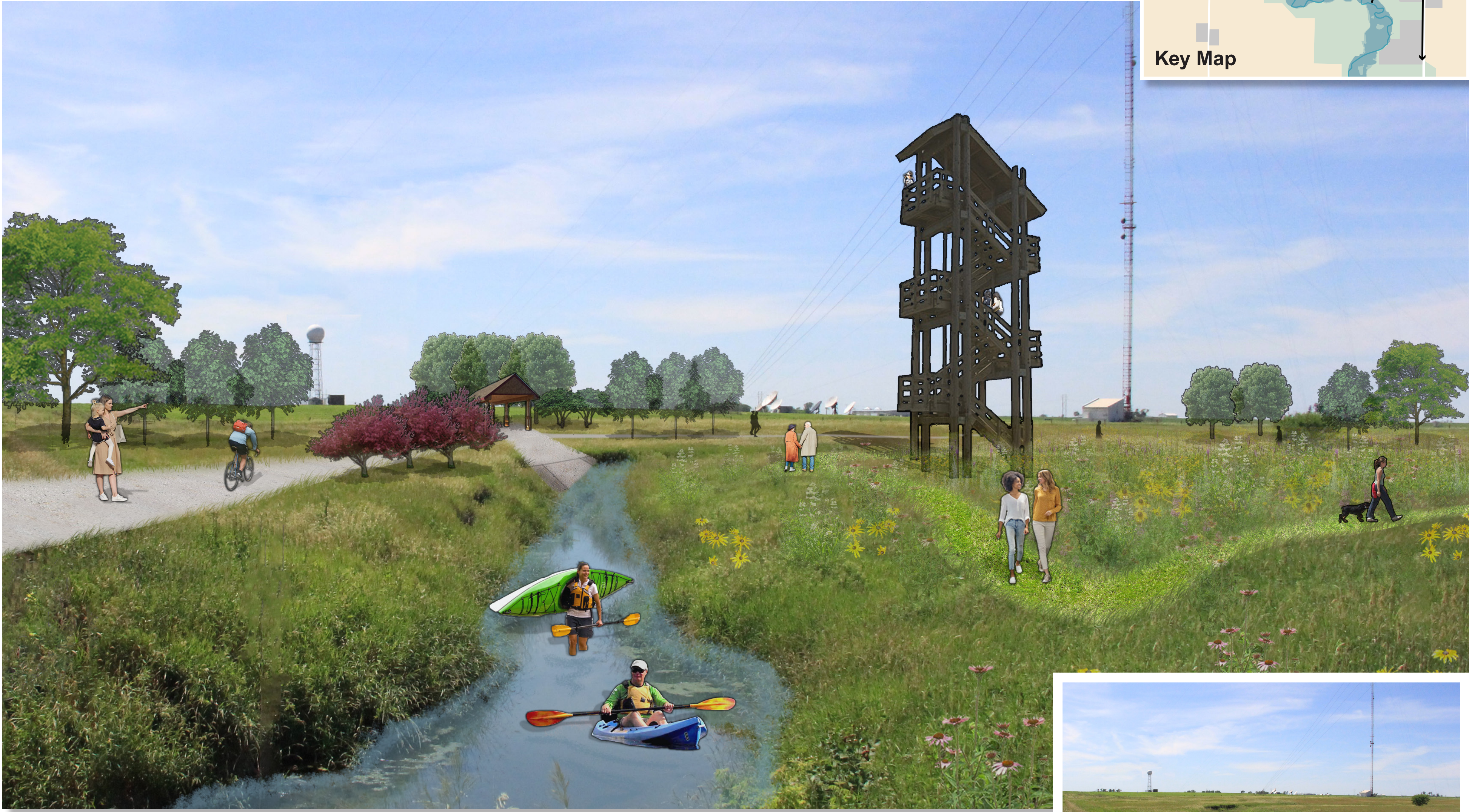
Perspective depicting proposed conditions of Peacock Park.

Peacock Park The proposed Peacock Park is situated north of NE 134th Avenue, next to Fourmile Creek. The trailhead and shelter serve as an entrance into the park, as well as a connection point to the paved trail leading north toward Timber Creek Park, and toward the housing development south of Dennler Drive. A proposed canoe/kayak launch on the west side of the park provides access to Fourmile Creek and a variety of water activities. A pedestrian foot bridge over Fourmile Creek leads to a mown trail on the east side of the park. Benches and signage allow visitors to rest and learn about the native planting area surrounding the mown trail. An overlook tower is also located along the mown trail path. This serves as an opportunity to take in panoramic views of Alleman and the surrounding area.