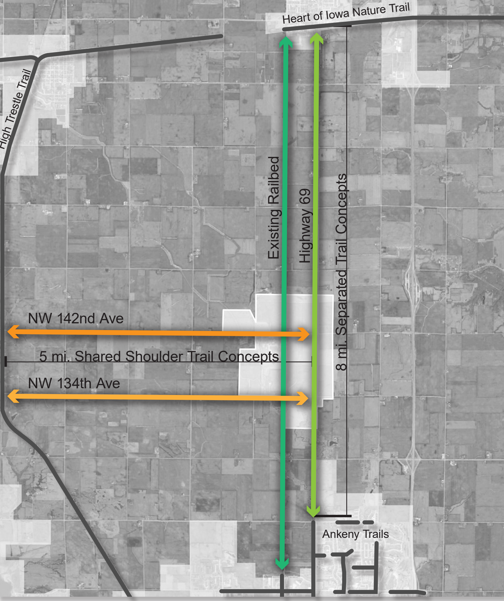
Regional trail connection options.

Regionally, Alleman is centered by the Heart of Iowa Trail, the High Trestle Trail, and various Ankeny trails. Four regional trail connections have been identified as ways to possibly link Alleman into the larger statewide trail system and provide pedestrian access to surrounding communities.