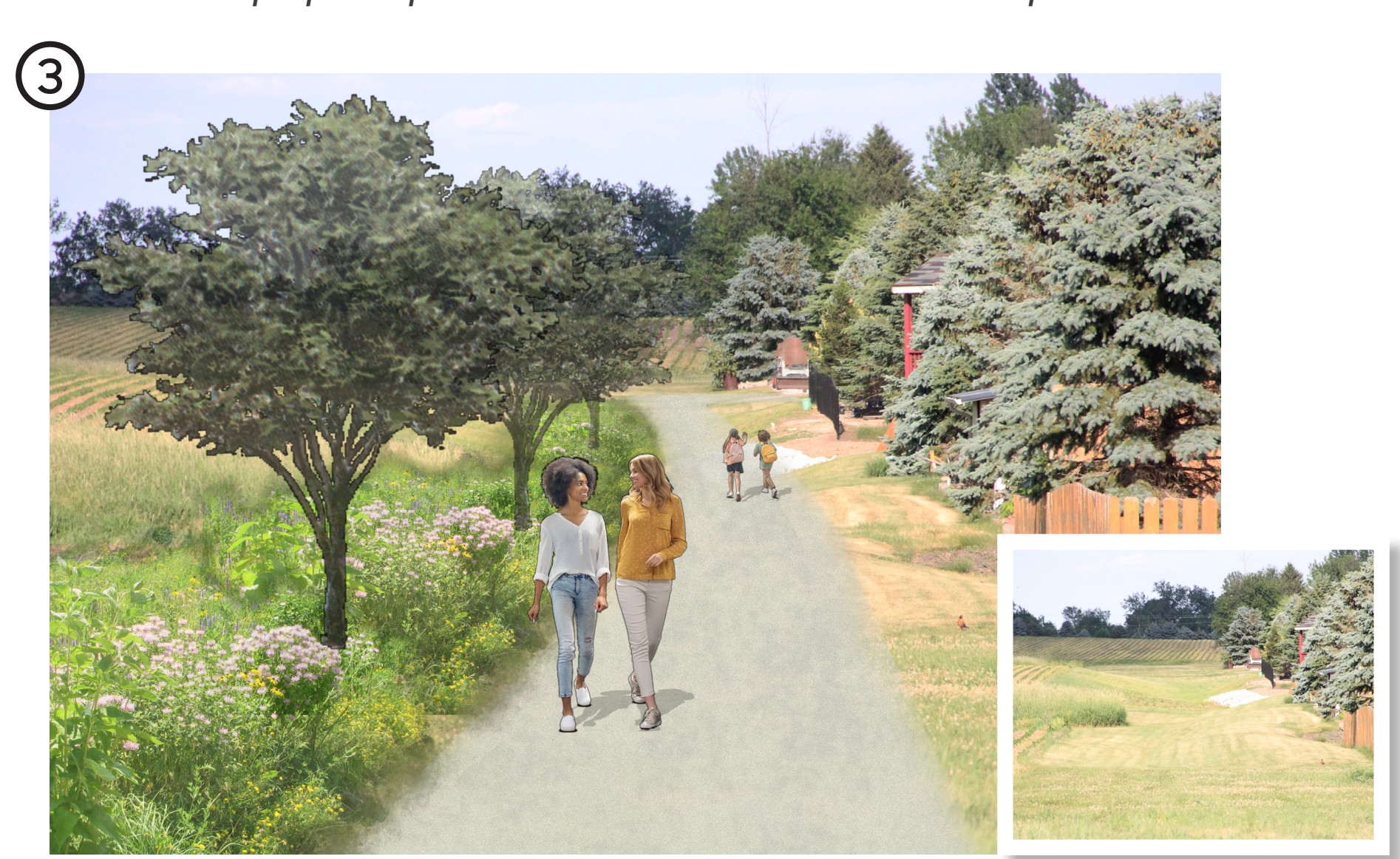
Dennler Drive proposed 10' gravel trail connection and beautification.