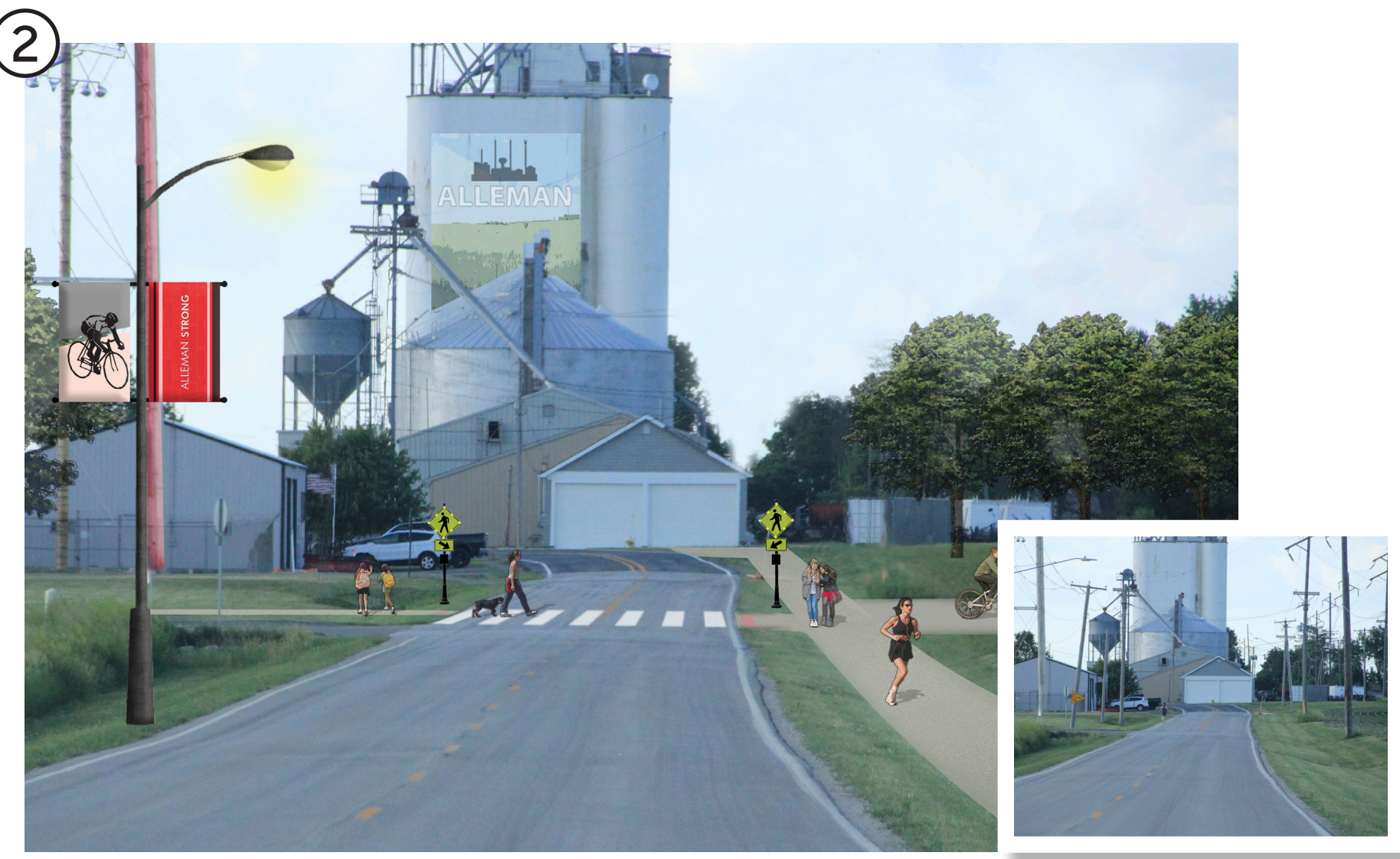
NE 6th Street proposed paved 10' trail connection and streetscape enhancements.