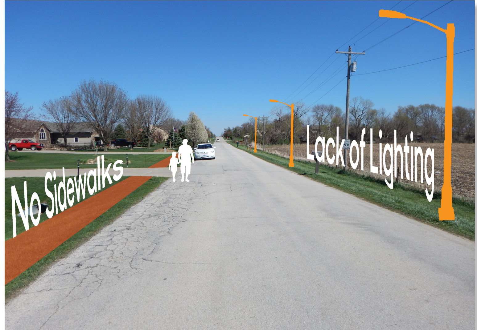
Northeast 134th Avenue lacks sidewalks on both sides of the road, forcing pedestrians to walk in the street. The absence of lighting causes visibility issues for drivers.