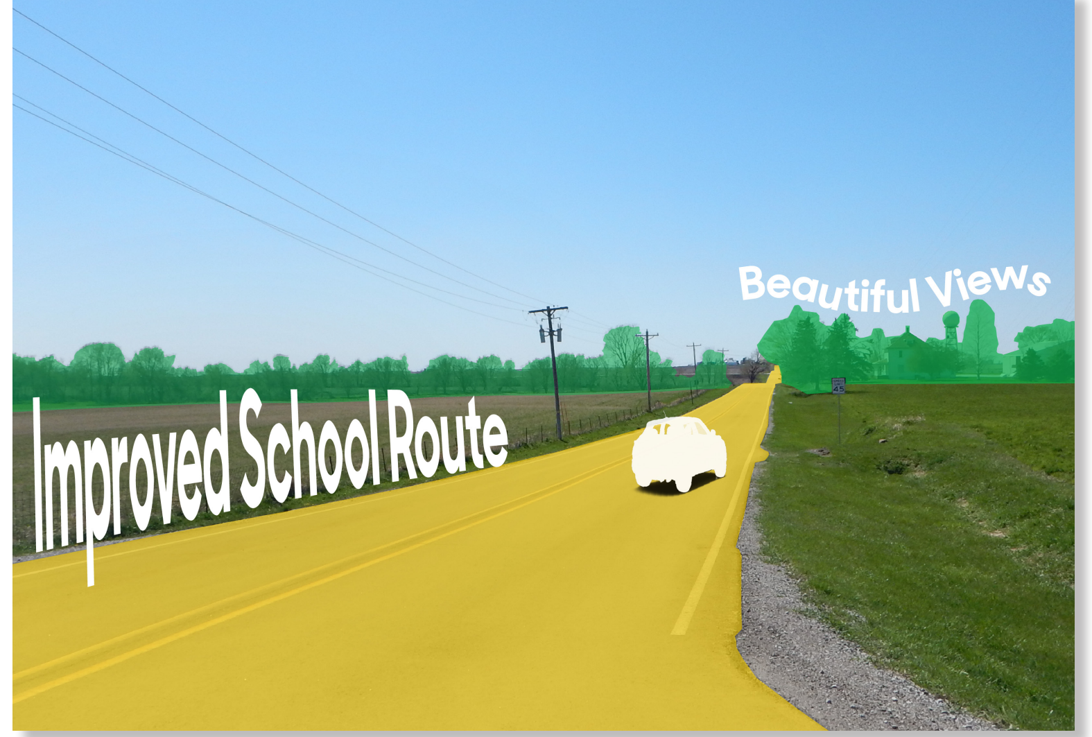
The recently paved Northeast 134th Avenue diverts school traffic from the south and east of town.