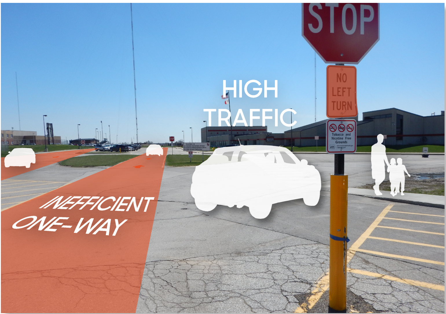
The one-way entrance and exit at the elementary school are inefficient. Contributing to traffic congestion traffic around Northeast 141st Avenue.