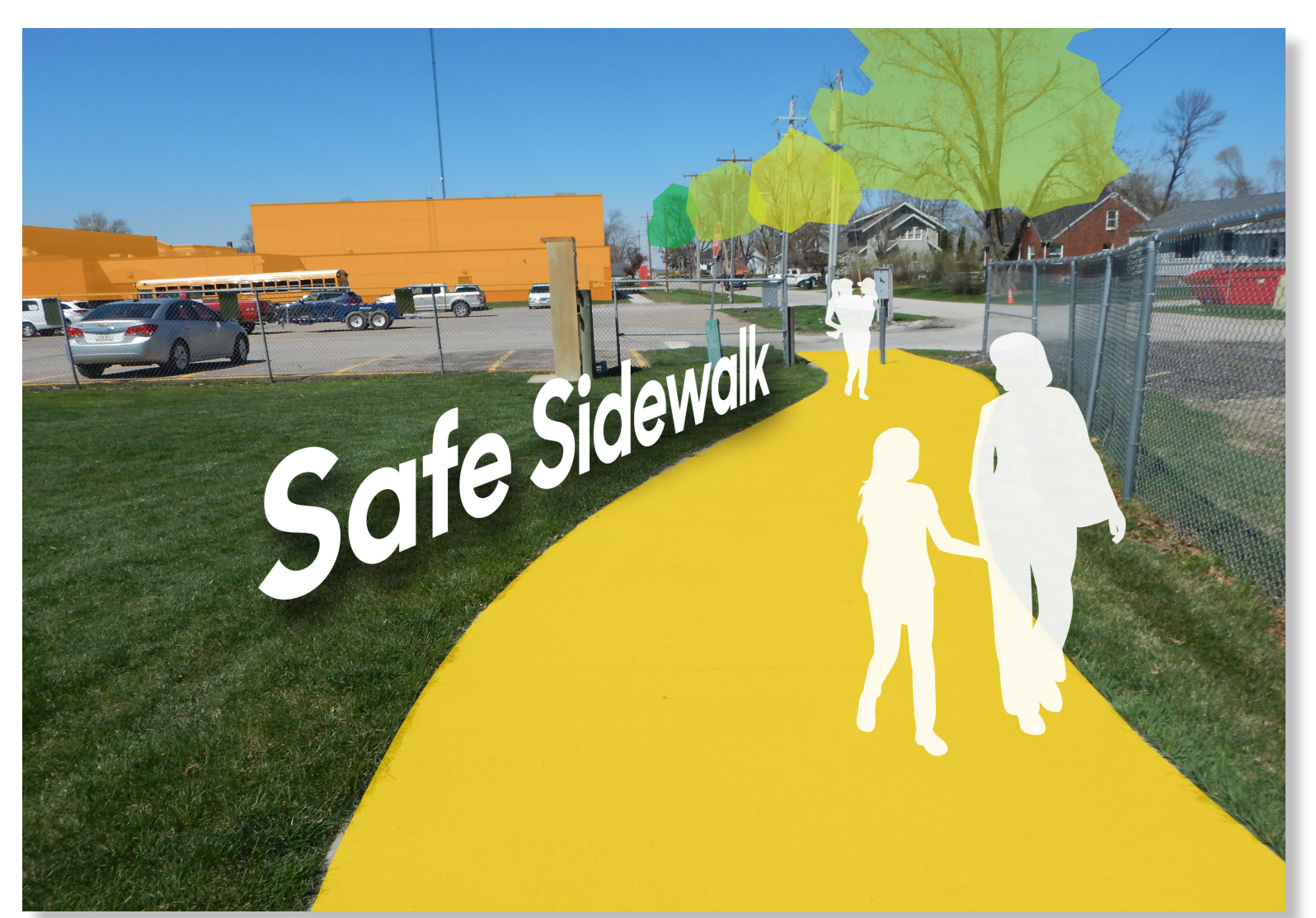
The sidewalk connecting the high school to the middle school is enjoyable and wellmaintained. Pedestrians feel safe while walking on the path.