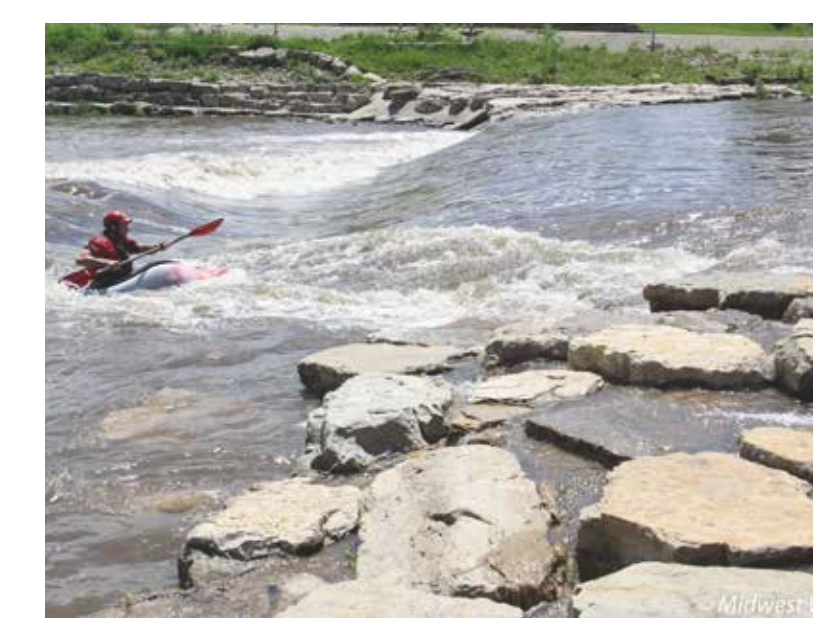
Whitewater, Charles City, IA

The whitewater park would also strengthen road, trail, and pedestrian connectivity to the west and south with new parking lot entrance on N 5th Street, leading to new stairs and accessible ramp to the Wiscotta Bridge. This location is several blocks due north of the proposed RRVT improvements and River Trailhead, and would strengthen the surface and water trail network in and around the city of Adel.