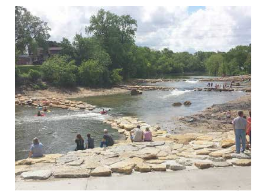
Whitewater Park, Manchester, IA