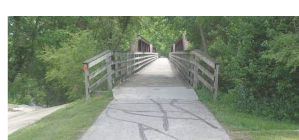
RRVT Bridge at The Raccoon River