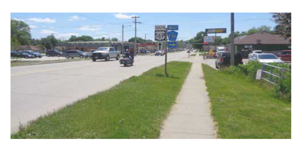
HWY 169 & HWY 6