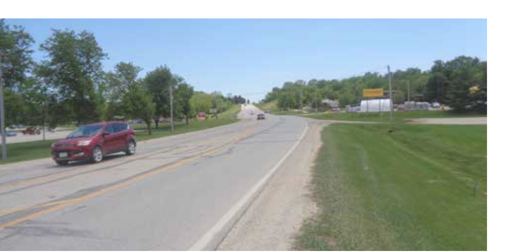
HWY 6 South