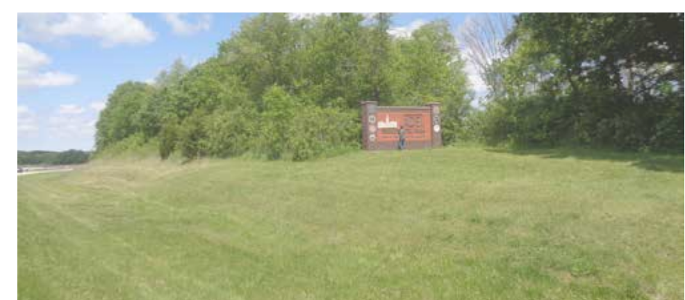
Existing Gateway Signs North & East of Town