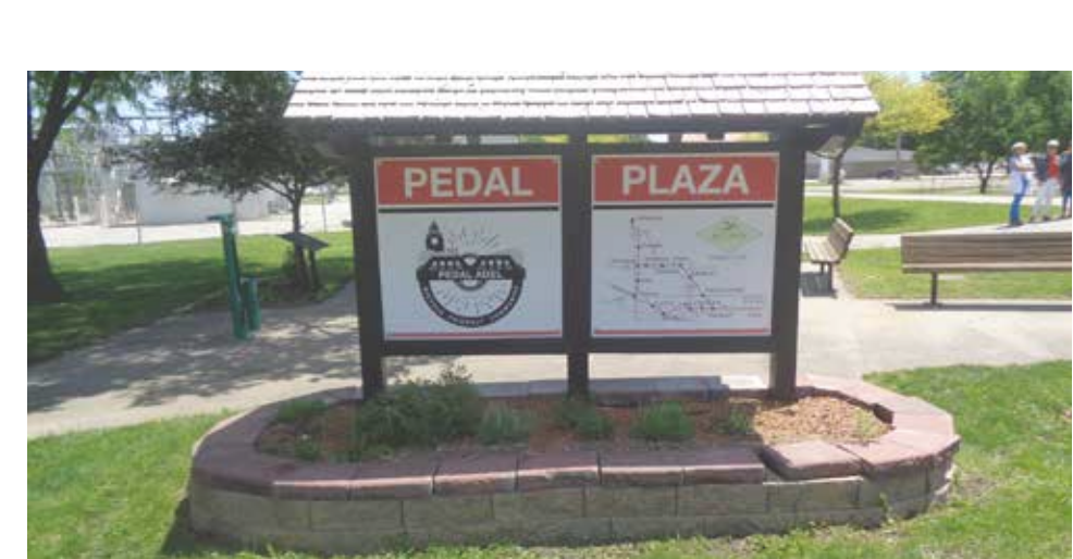
Pedal Plaza Trailhead at RRVT/HWY169